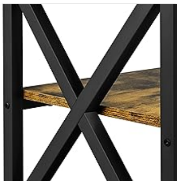
Image: Details of the table's construction, highlighting the robust steel frame, adjustable footpads for stability on uneven surfaces, and the X-shape cross-side design for enhanced structural integrity.