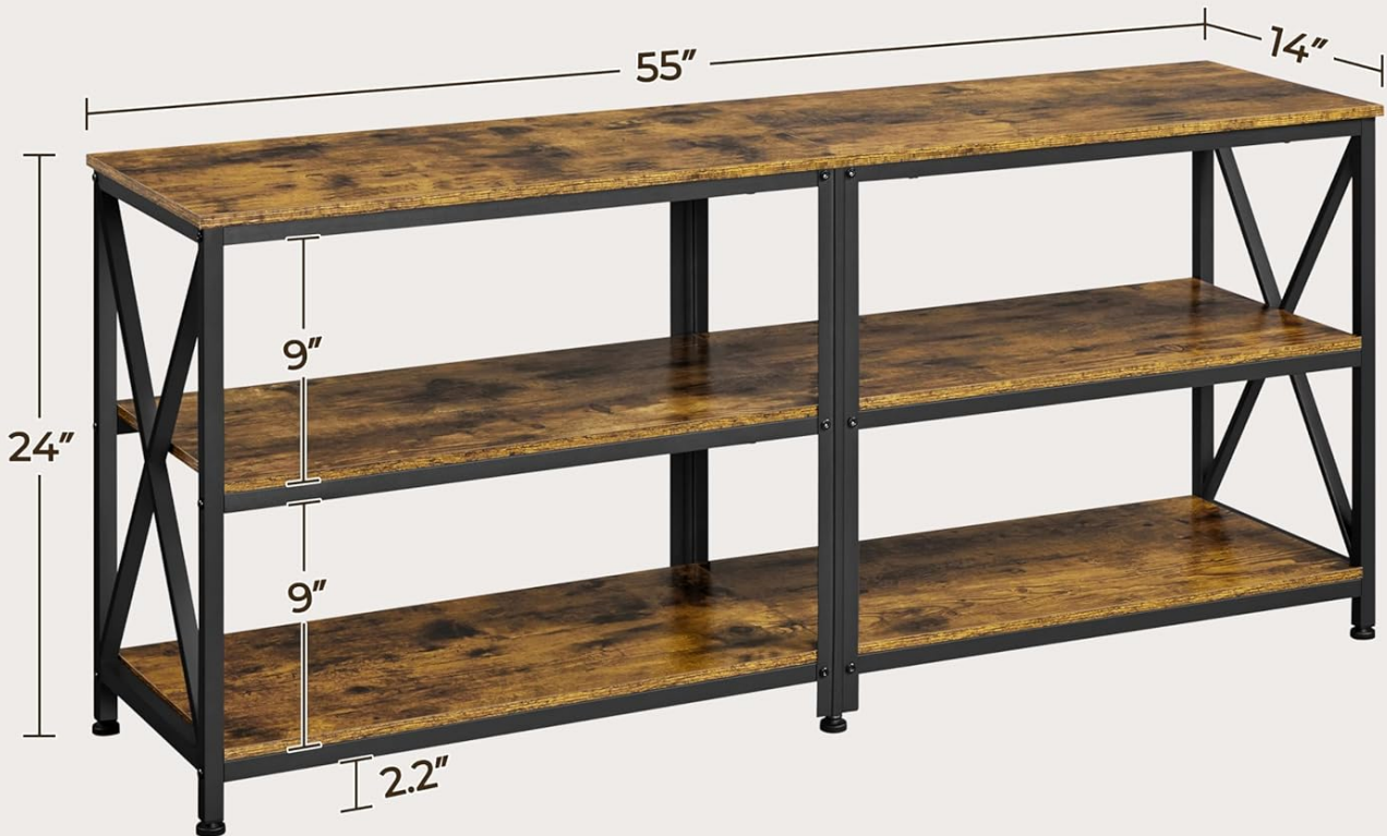
Image: A detailed diagram illustrating the dimensions of the console table (55"W x 14"D x 24"H) and the weight capacities for the tabletop (66 lbs) and each shelf (55 lbs).