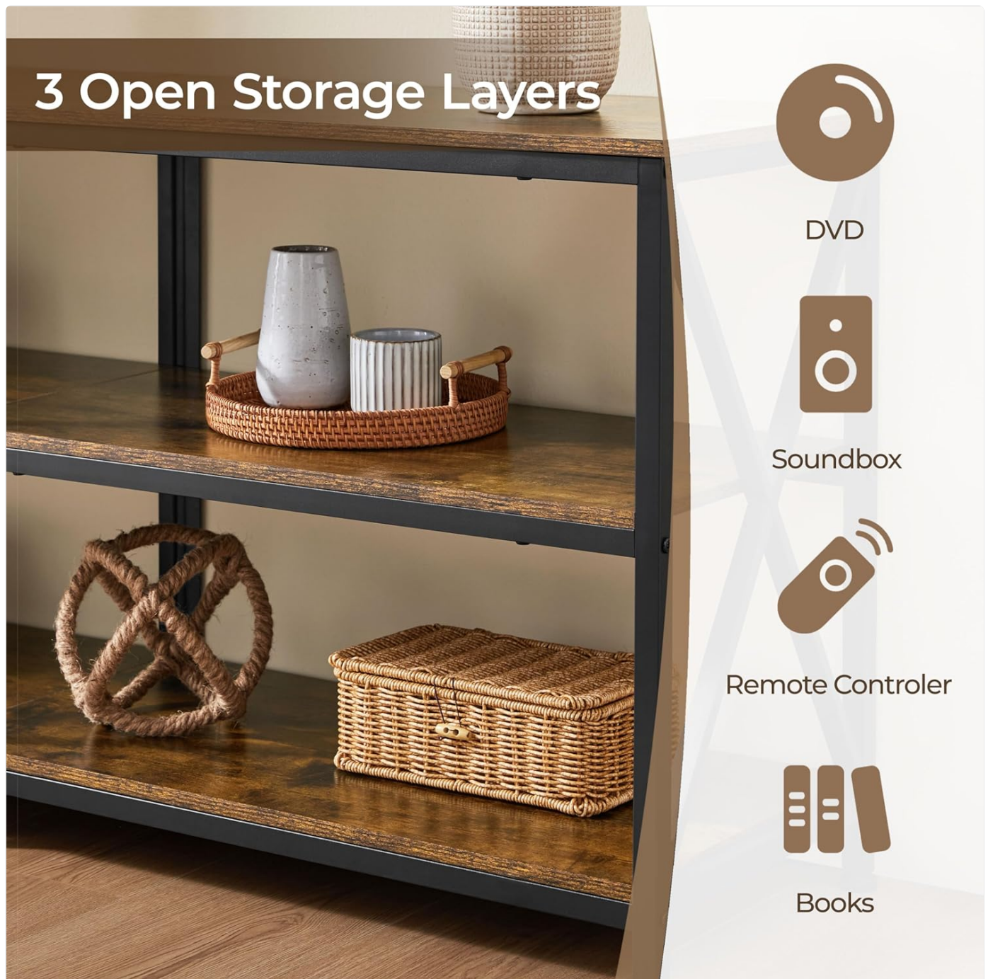
Image: A detailed view of the three open storage layers, illustrating how various items such as DVDs, a soundbox, remote controls, and books can be neatly organized and displayed.