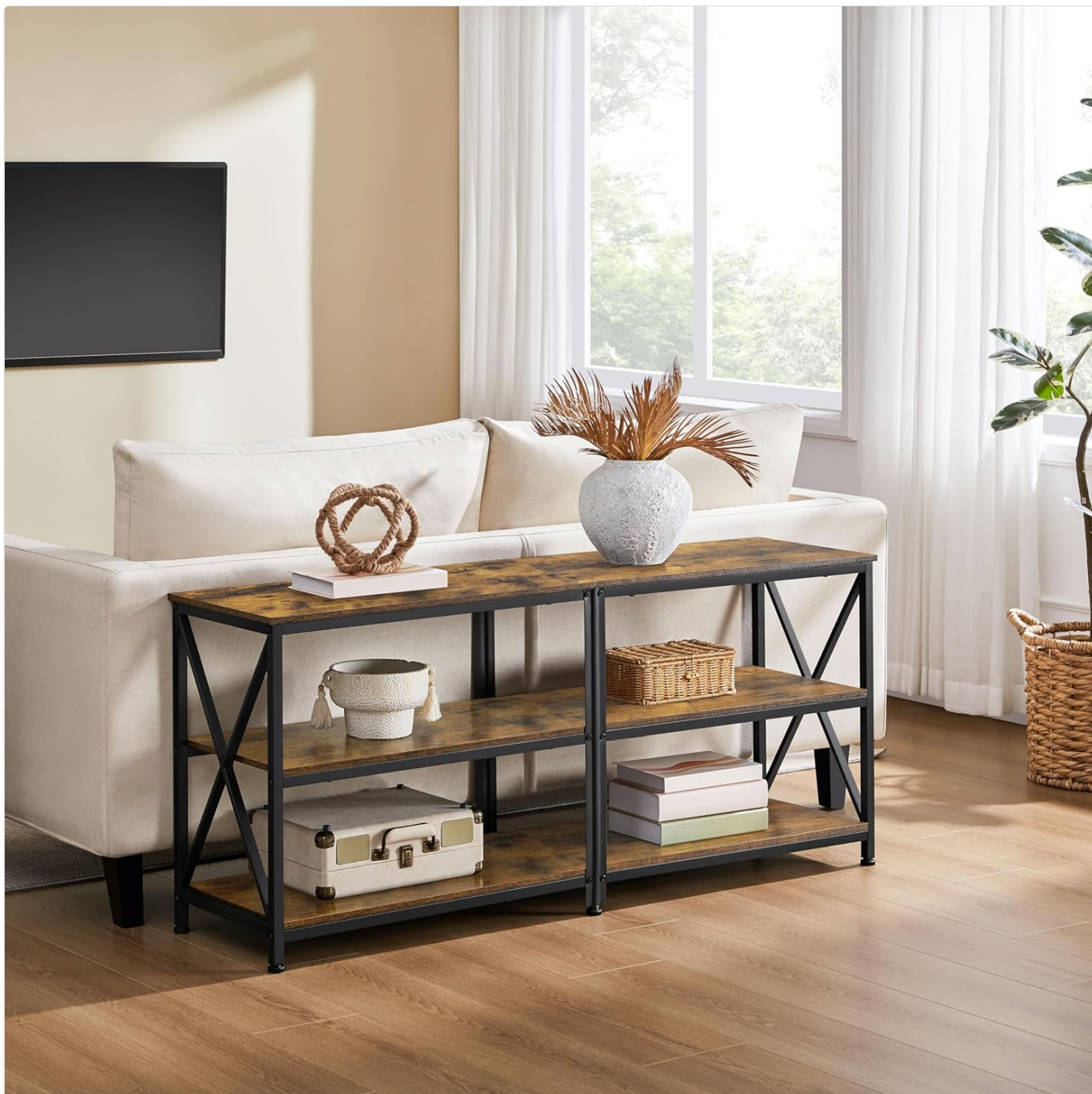
Image: The Yaheetech Console Table, a 55-inch rustic brown unit with a metal frame, positioned behind a couch in a living room, demonstrating its intended use and aesthetic.