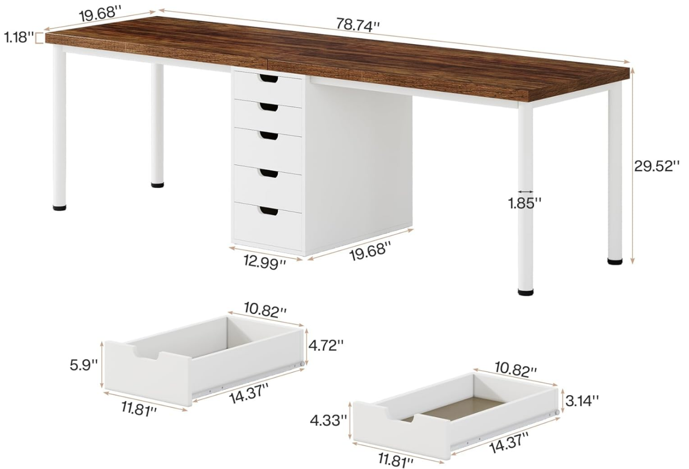
Figure 2: Desk dimensions and component breakdown for assembly.