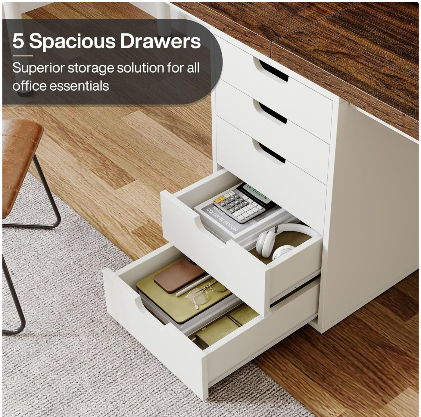
Figure 4: The five spacious drawers provide ample storage.