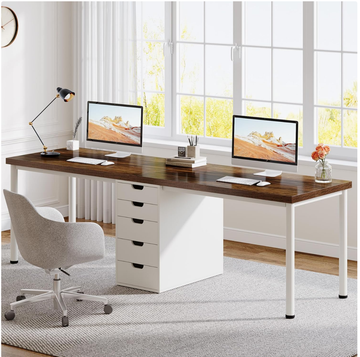
Figure 1: Tribesigns Two Person Computer Desk (Brown/White) in a typical setup.