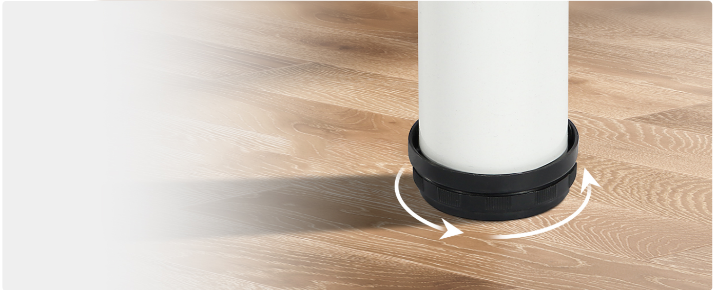
Figure 3: Adjustable feet for leveling the desk.