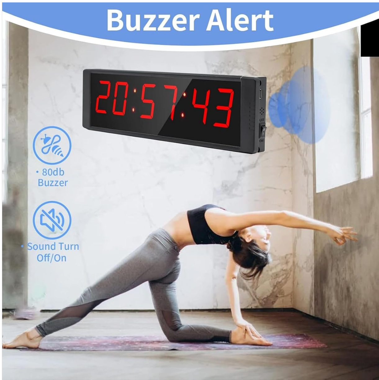
Image: Buzzer alert feature.