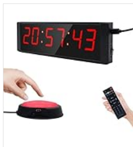
Image: Package contents of the Ousmile YS-GT-RED Digital Timer.