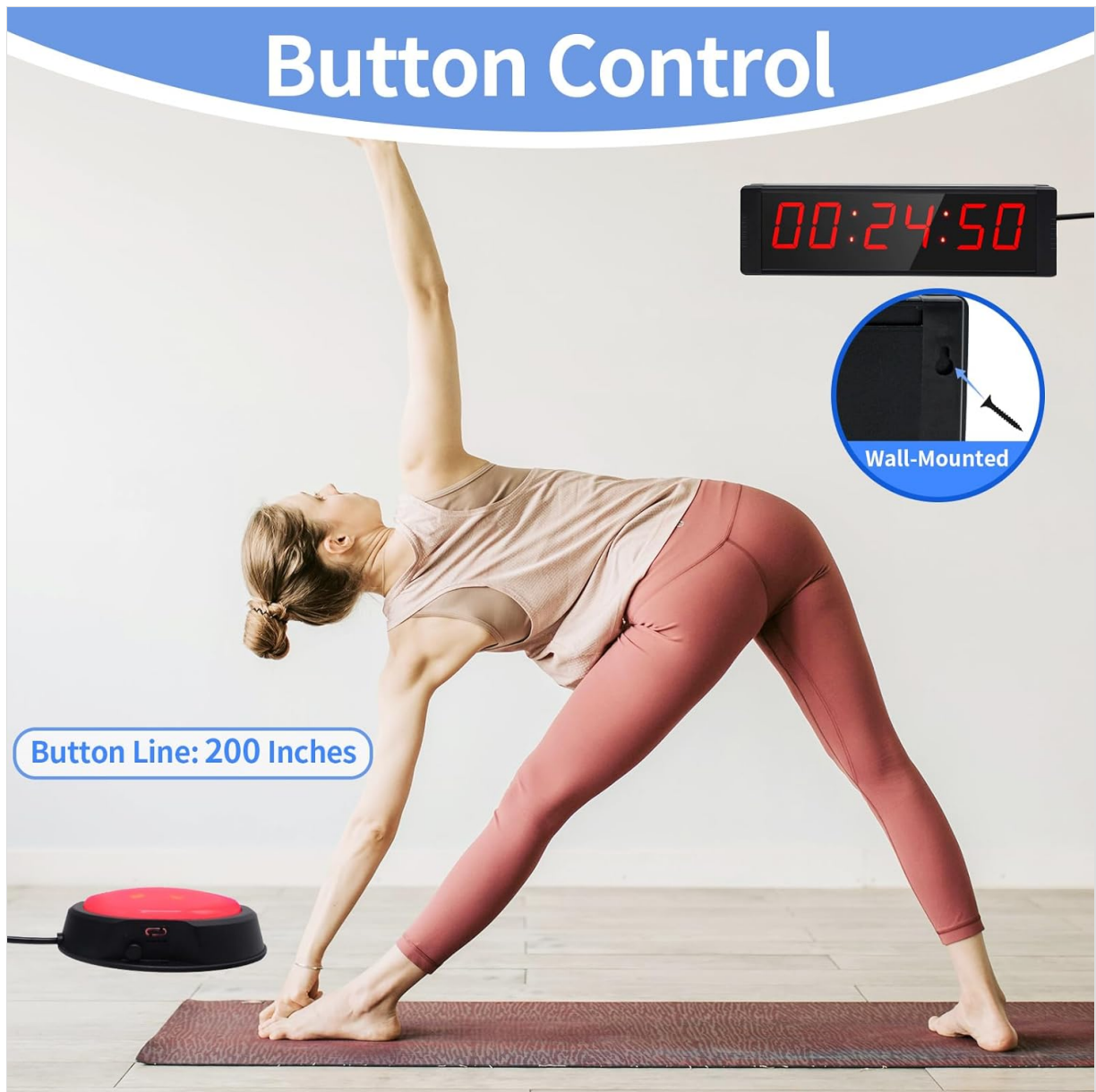
Image: Demonstrating the external pushbutton control.