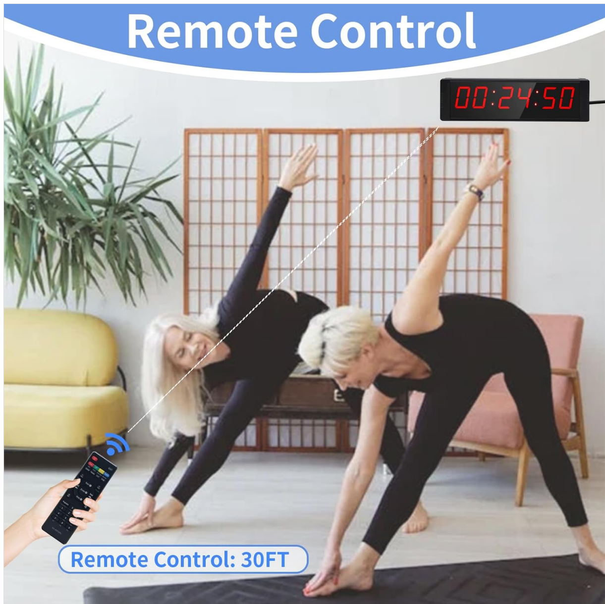
Image: Remote control for the digital timer.