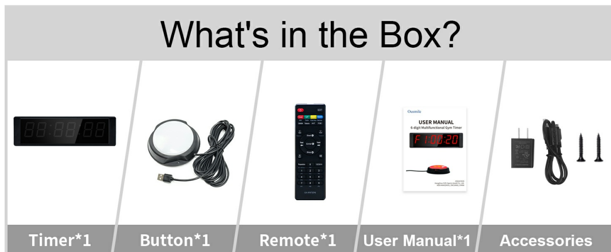
Image: Digital timer connected to power.

outlet. The LED display will illuminate upon successful connection.