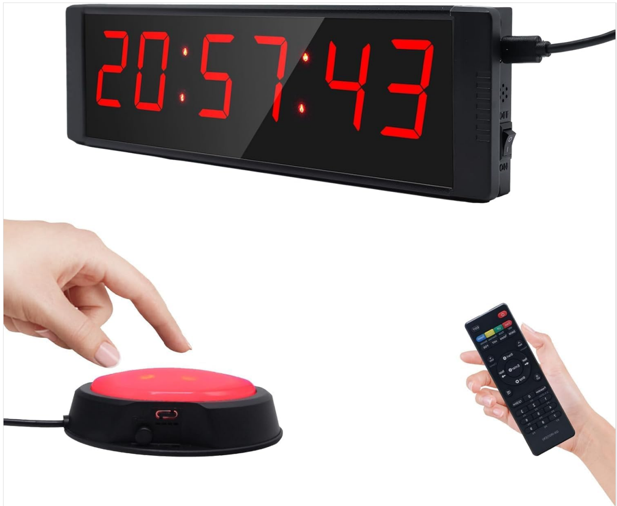
Image: Digital timer with remote and pushbutton.