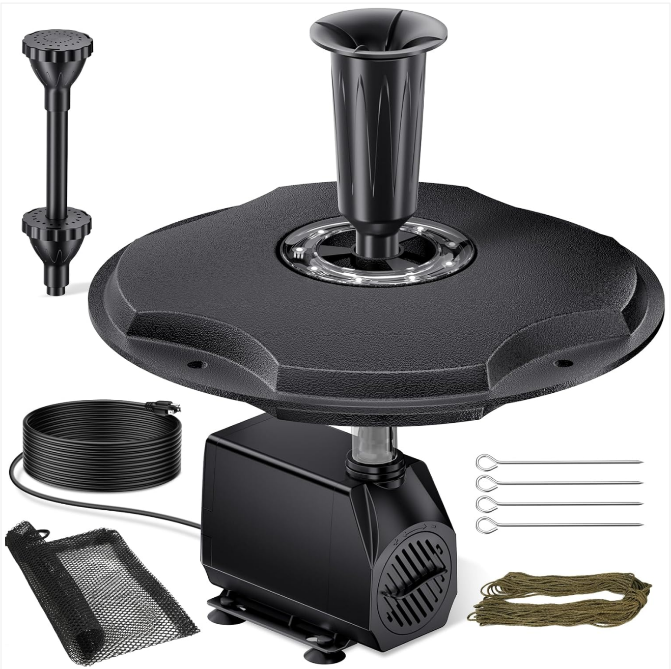
All components of the POPOSOAP Floating Pond Fountain laid out for inspection.