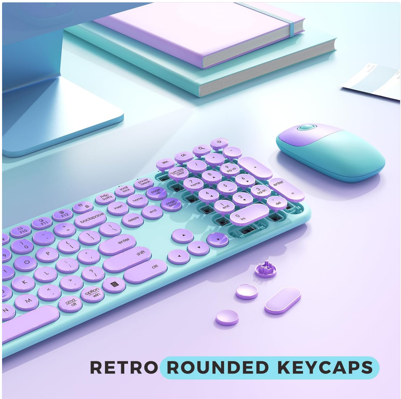
Figure 4.1: The retro rounded keycaps provide a distinct typing experience.