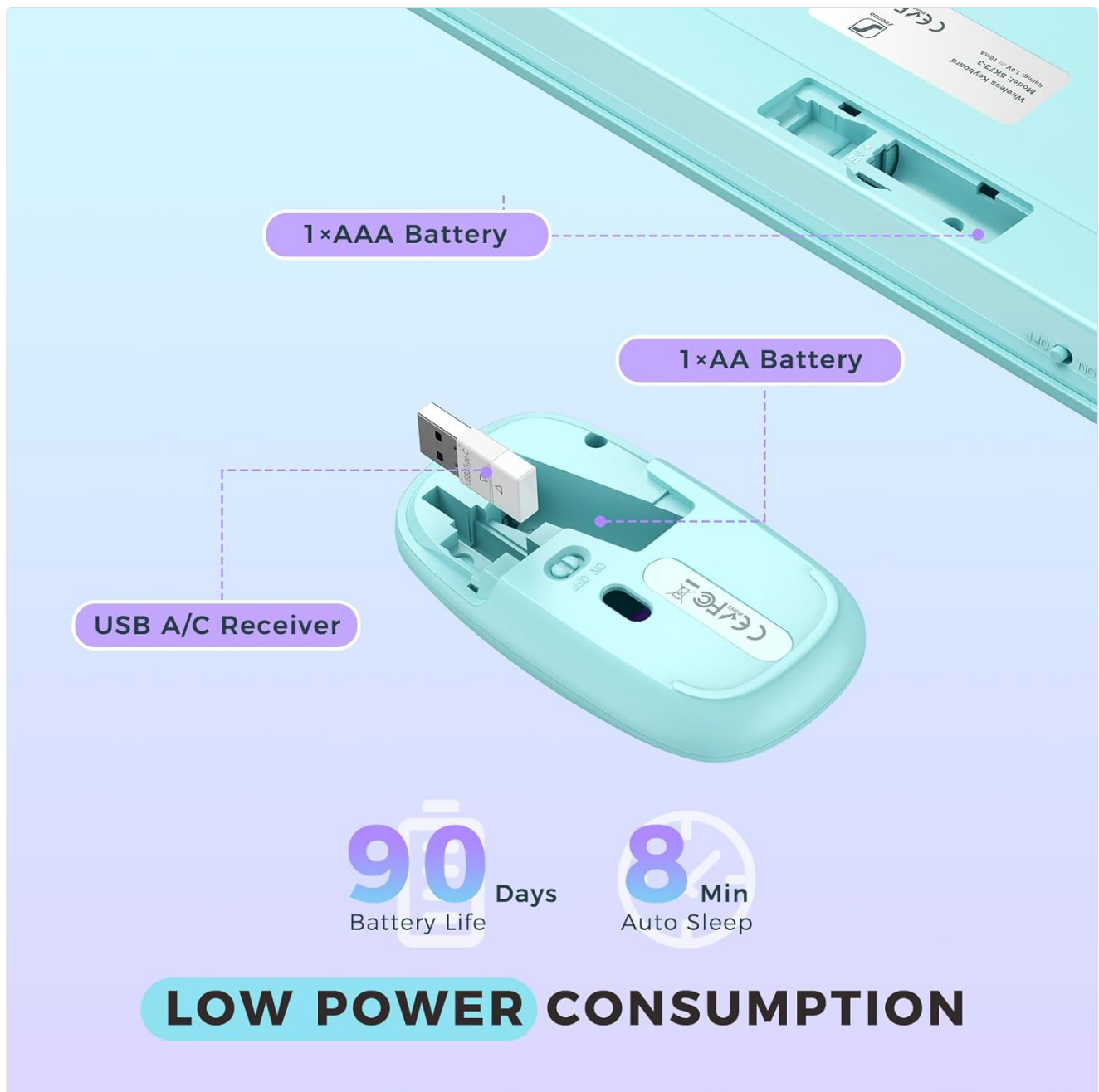
Figure 3.1: Battery installation for the keyboard and mouse. The 2-in-1 receiver is located in the mouse's battery compartment.