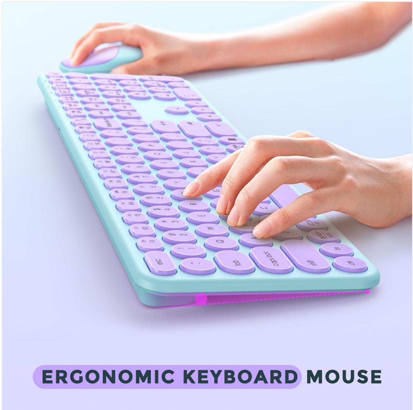
Figure 4.2: The ergonomic design of the keyboard and mouse promotes comfort during use.