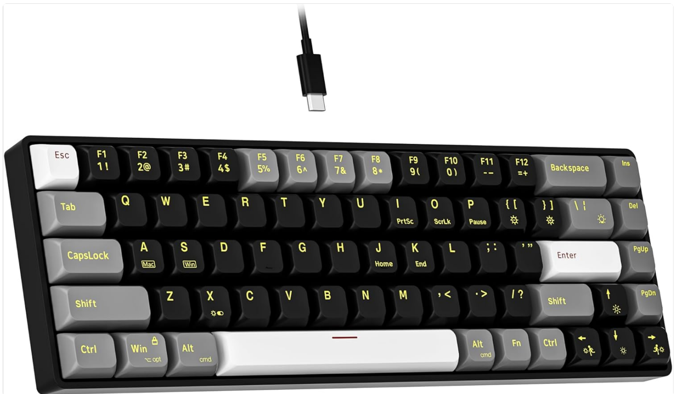
Image: The Newmen GM681 mechanical keyboard, showcasing its compact layout and the detachable USB-C cable.

The Newmen GM681 is a compact 60% (68-key) mechanical gaming keyboard designed for PC gamers and office work. It features a durable wired connection, customizable LED backlighting, and responsive Red mechanical switches. Its ergonomic design aims to reduce fatigue during extended use.