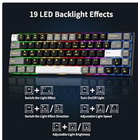
Image: The Newmen GM681 keyboard illuminated with its vibrant rainbow LED backlighting, showcasing various lighting effects.