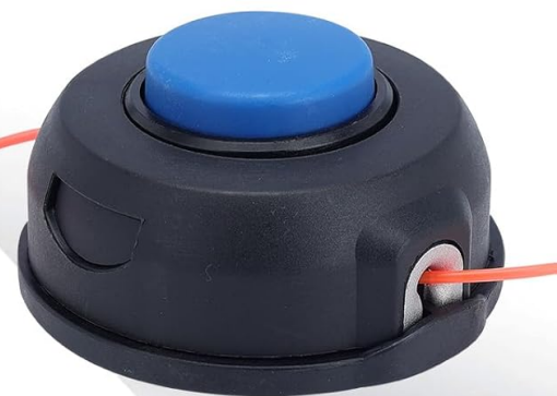
Image 3.1: Visual guide for easy installation of the trimmer head onto the shaft.