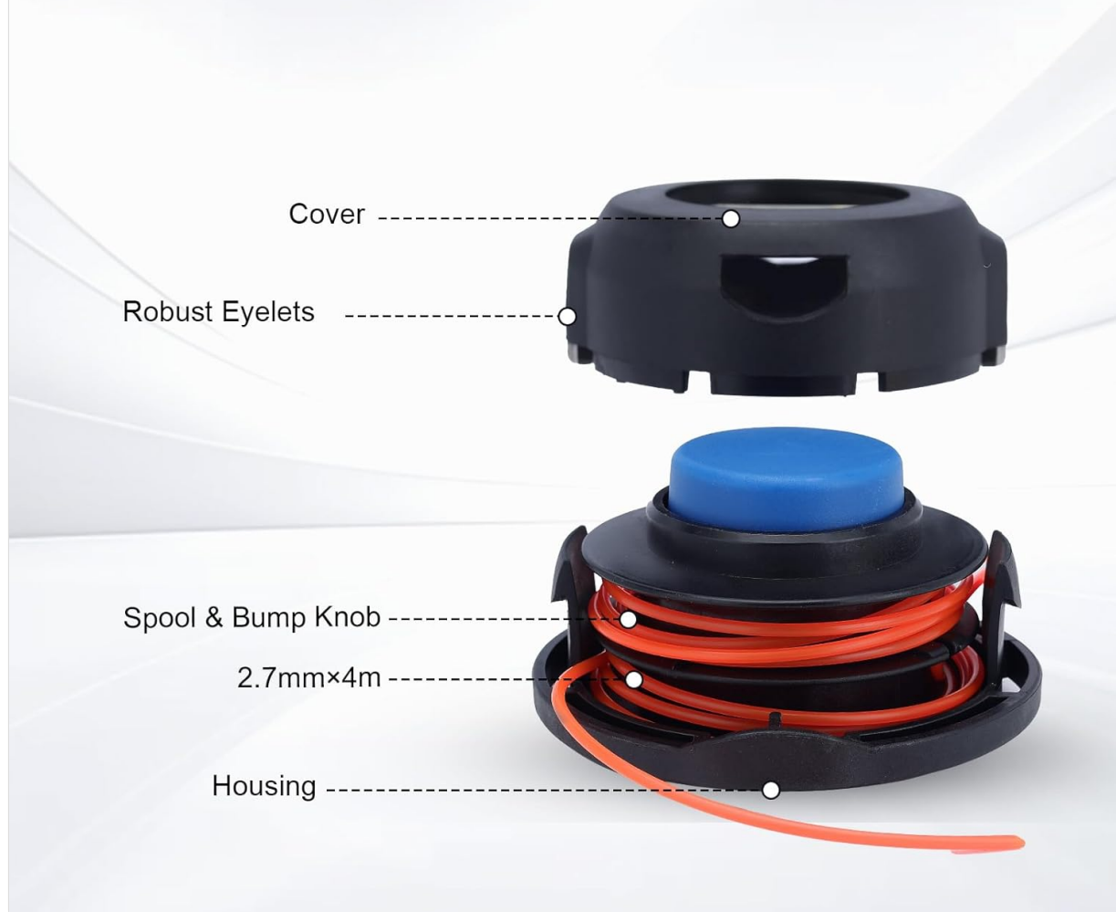
Image 4.2: Exploded view showing the cover, robust eyelets, spool & bump knob, and housing of the trimmer head.