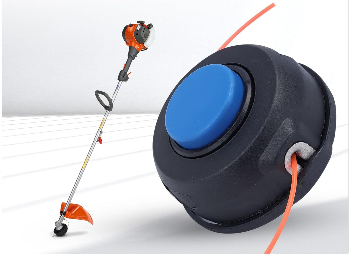
Image 3.2: The Savior T25 Trimmer Head properly installed on a compatible Husqvarna trimmer.