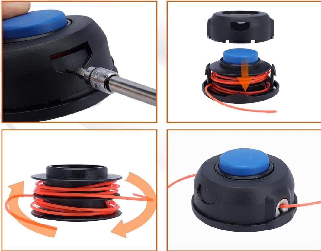
Image 4.1: Step-by-step guide for reloading the trimmer line into the head.