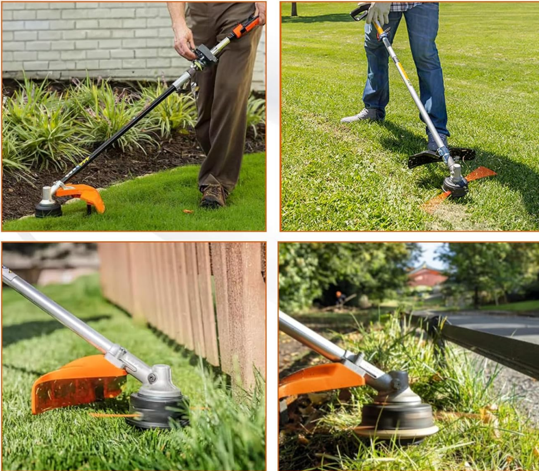
Image 4.3: Examples of the trimmer head being used in different landscaping situations.