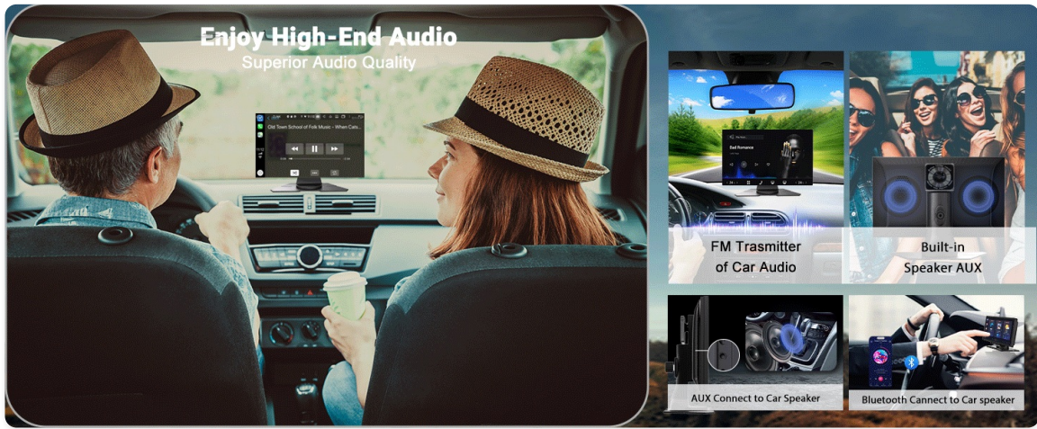
Image: A visual guide to the CarPlay screen's audio output options, showing connections for Bluetooth, AUX, FM, and internal speakers.