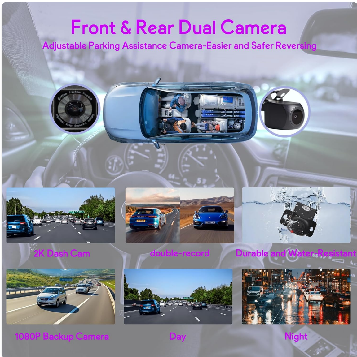
Image: Diagram showing the front and rear dual cameras, highlighting features like 2K dash cam, 1080P backup camera, and day/night recording capabilities.