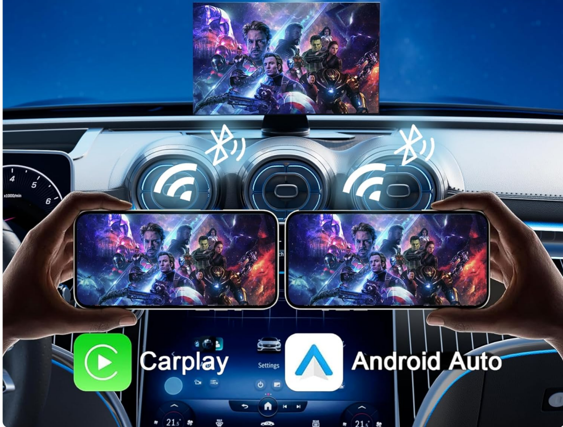
Image: The CarPlay screen displaying both Apple CarPlay and Android Auto interfaces, highlighting MirrorLink and WiFi video capabilities.