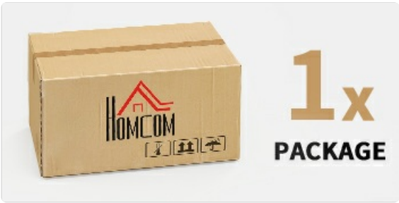
Image: A cardboard box indicating the product comes in one package.

Before beginning assembly, ensure all parts listed in the assembly diagram are present and undamaged. If any parts are missing or damaged, please contact customer support.