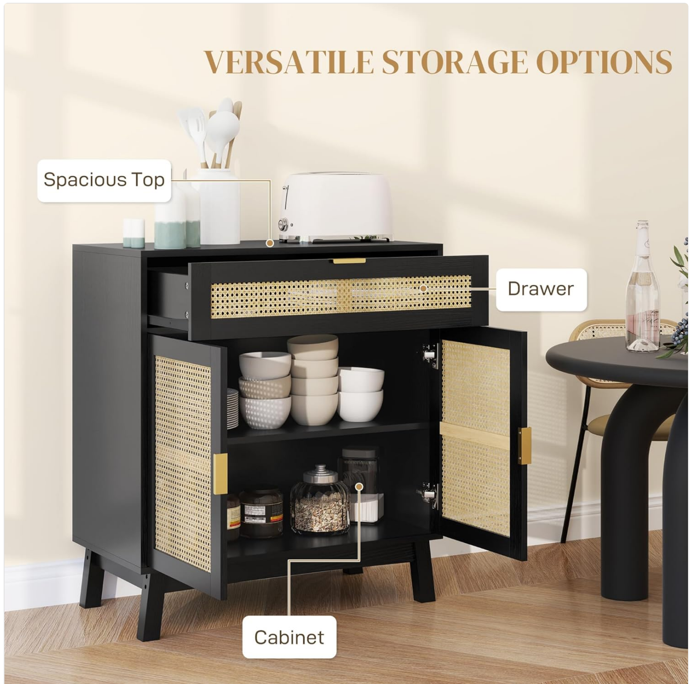
Image: The cabinet with its drawer and doors open, showcasing the internal storage compartments.

The drawer and doors operate smoothly. The doors are equipped with small magnets to ensure they stay closed when not in use. To open, gently pull the handle. To close, push until the magnet engages.