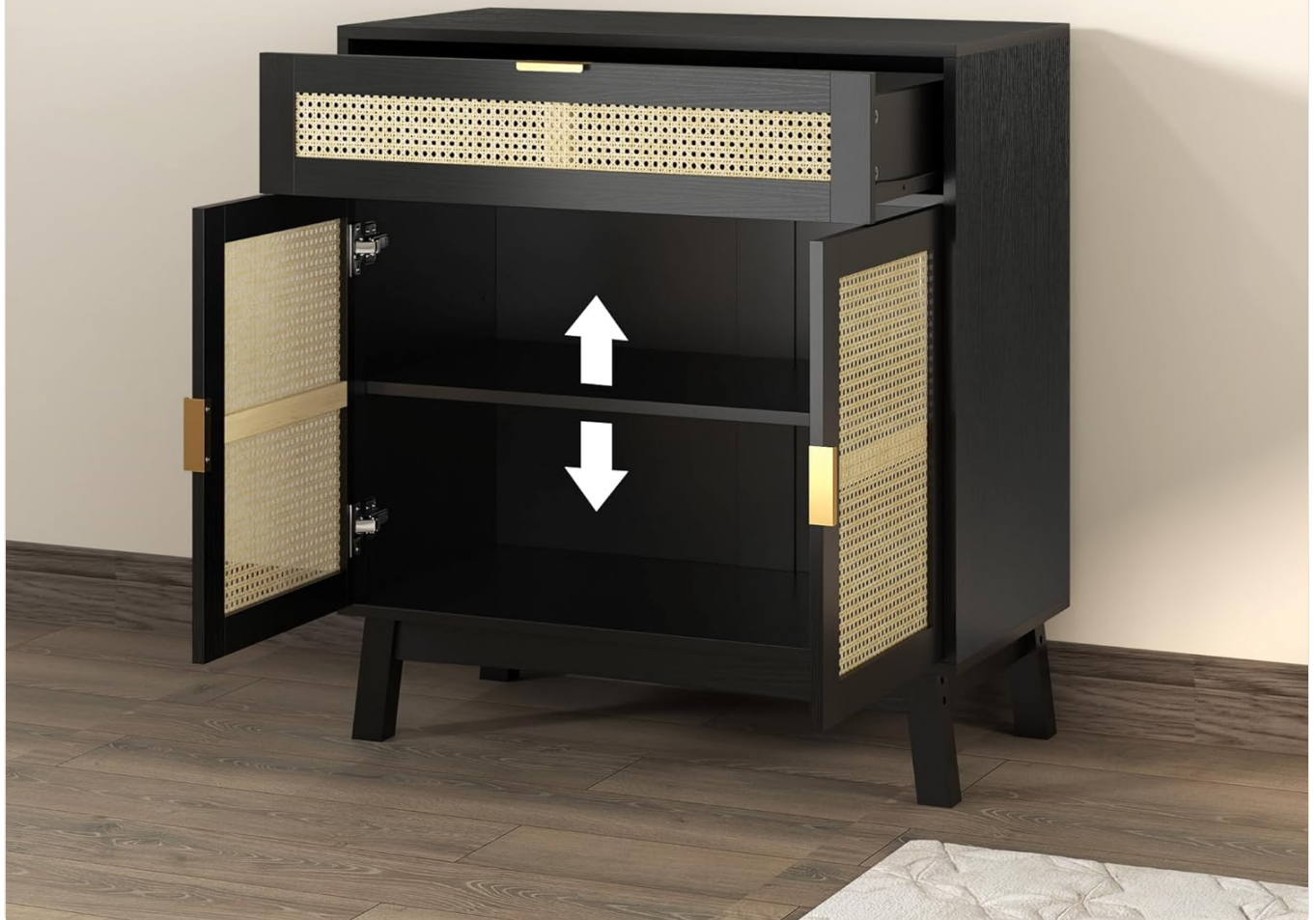
Image: The adjustable shelf inside the cabinet, demonstrating its three-position adjustability.