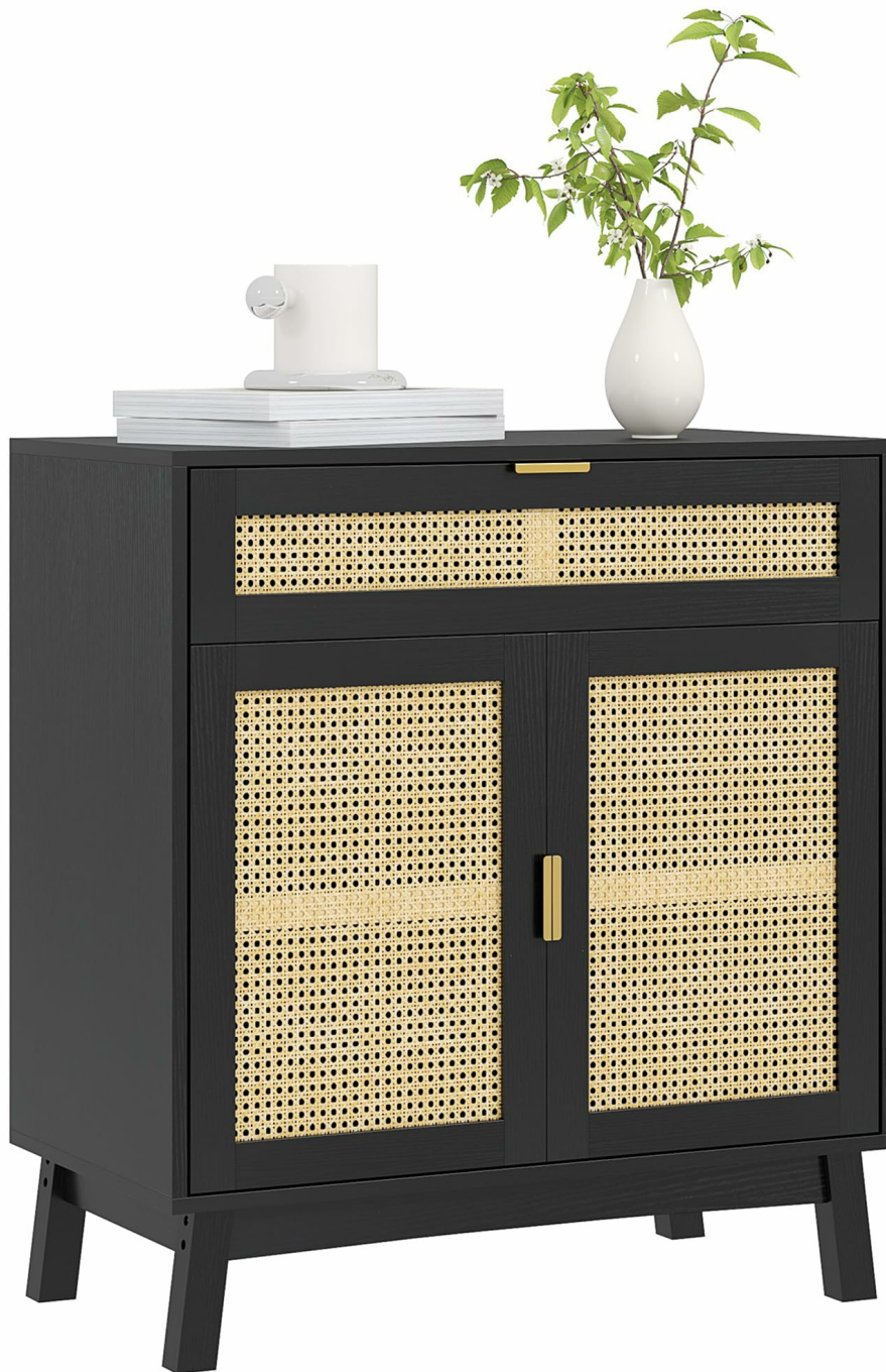
Image: The HOMCOM Boho Sideboard Storage Cabinet, featuring a black finish and rattan doors, positioned in a modern living room.