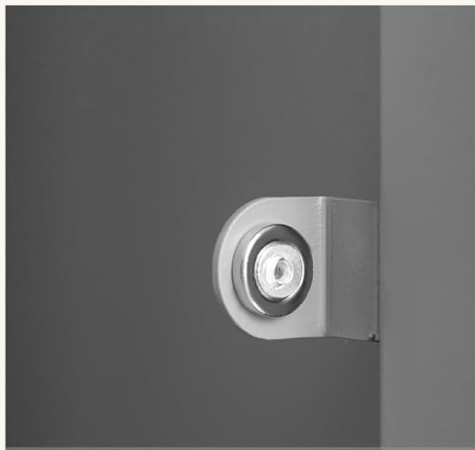
Magnetic Door Catches