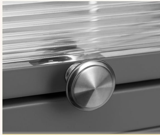
Exquisite Silver Knobs