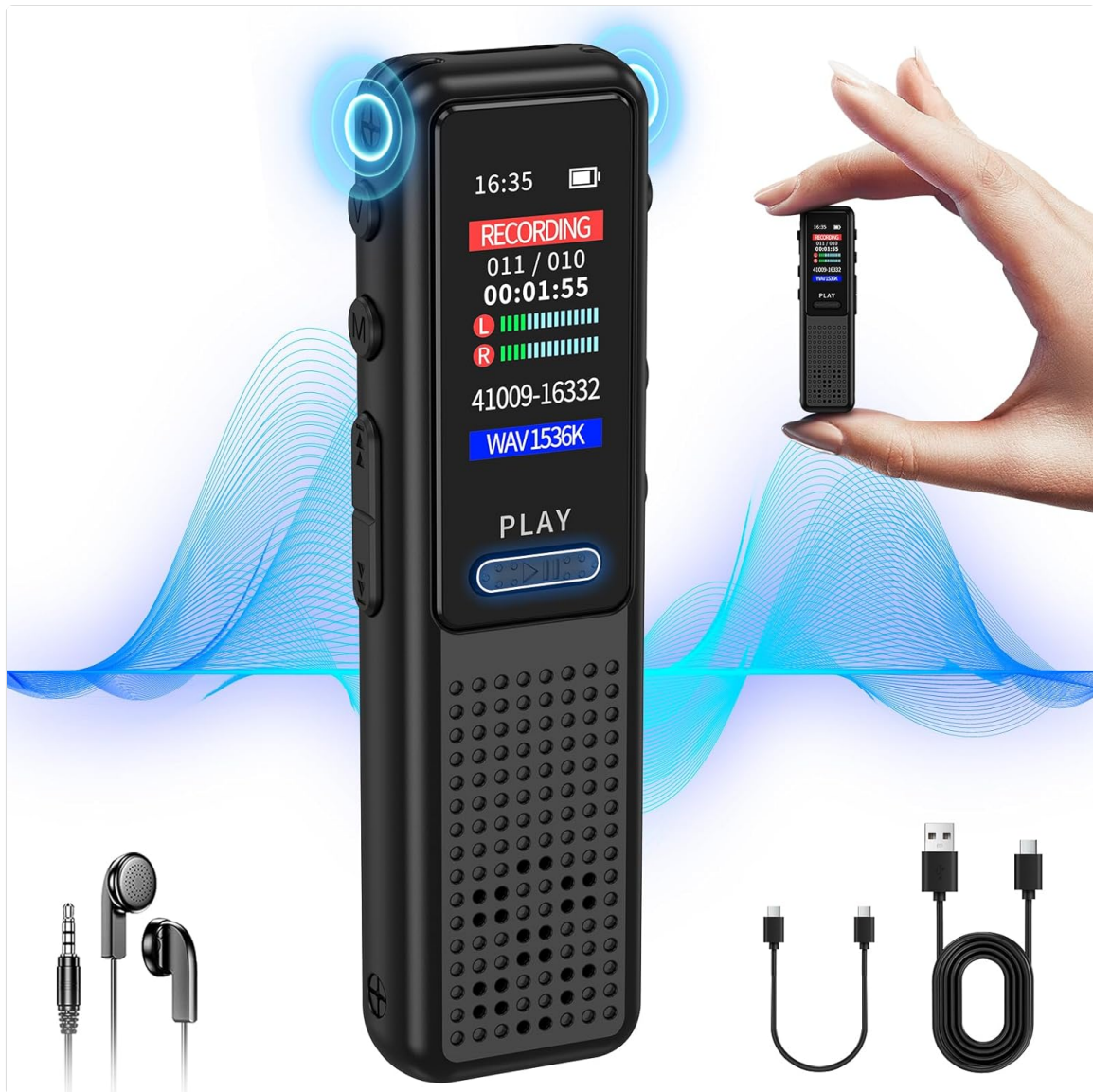
Image: The ZIPCIDe 128GB Digital Voice Recorder shown with its included accessories: headphones, Type-C cable, and Type-C OTG cable. The recorder itself is sleek and black, with a display screen and control buttons.