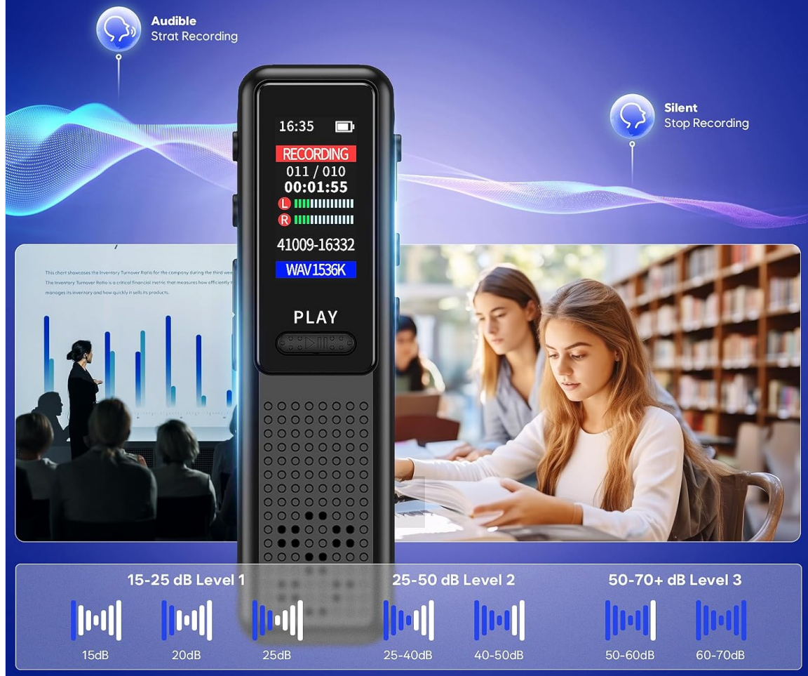
Image: An illustration explaining the Voice Activated Recording (VOR) feature, showing how the device starts recording when audible sound is detected and stops during silence. It also displays three levels of voice sensitivity with corresponding decibel ranges.

7 levels of voice sensitivity, skip invalid silences Saving time and space