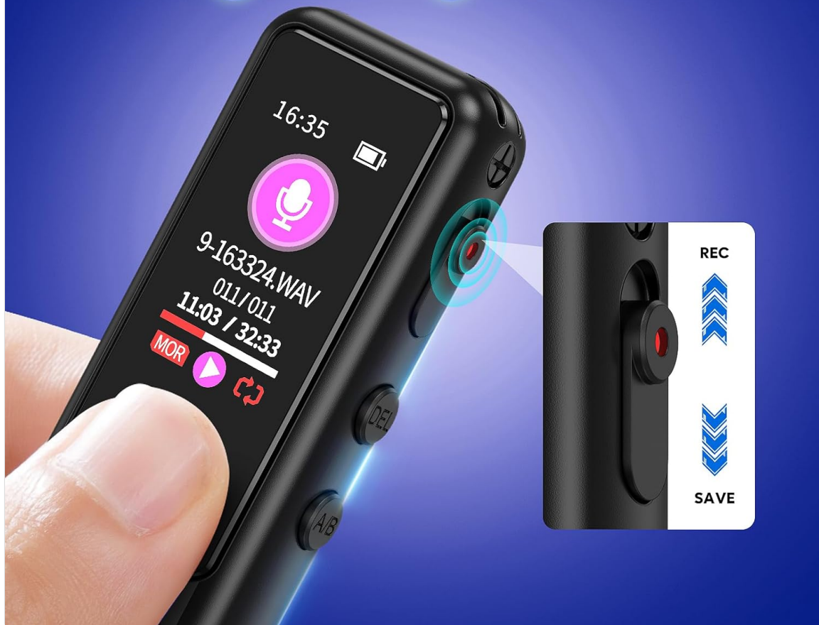
Image: A close-up of the ZIPCIDe voice recorder showing the "REC" and "SAVE" positions of the recording slider button, indicating one-click operation for starting and saving recordings.