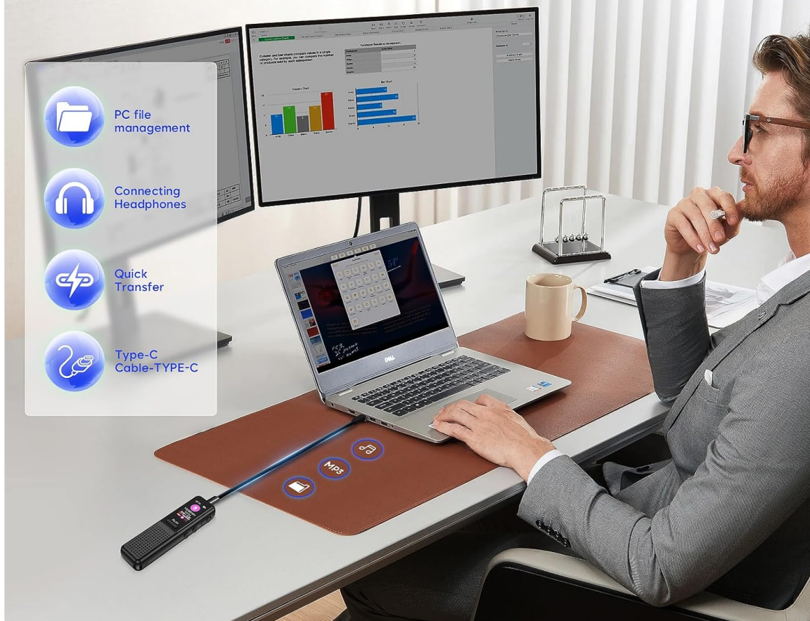
Image: A person using a laptop with the ZIPCODE voice recorder connected via a Type-C cable, demonstrating convenient file download and management on a computer. Icons for PC file management, connecting headphones, and quick transfer are also shown.