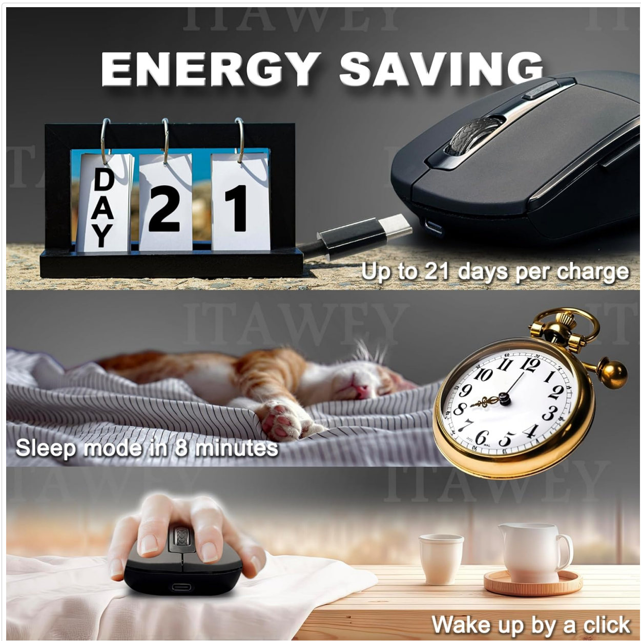
Figure 4.1: Charging the Mouse