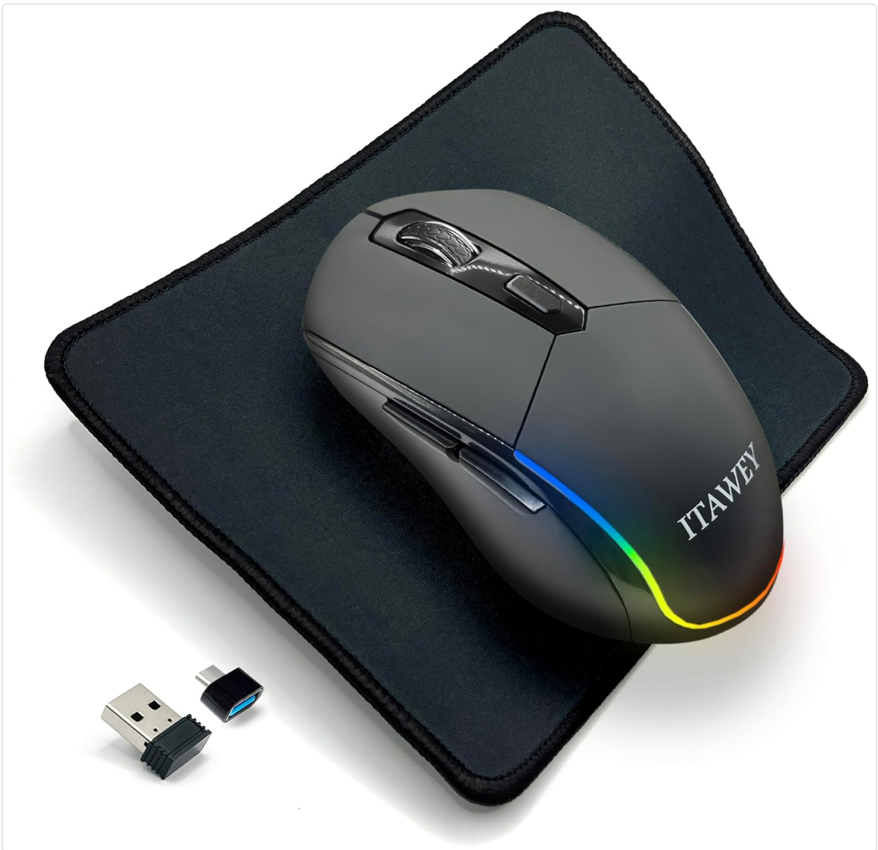
Figure 4.3: Mouse, Pad, and Adapters