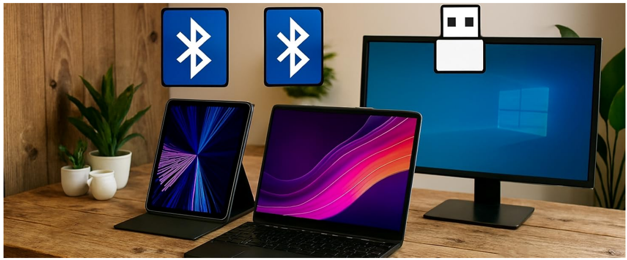
Figure 4.5: Tri-Mode Connection Example

To switch between connected devices, simply move the MODE switch to the desired channel (USB, BT1, or BT2).