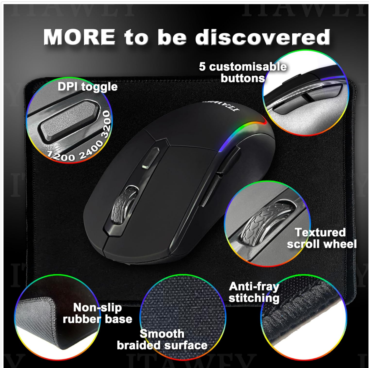
Figure 3.1: Mouse Components