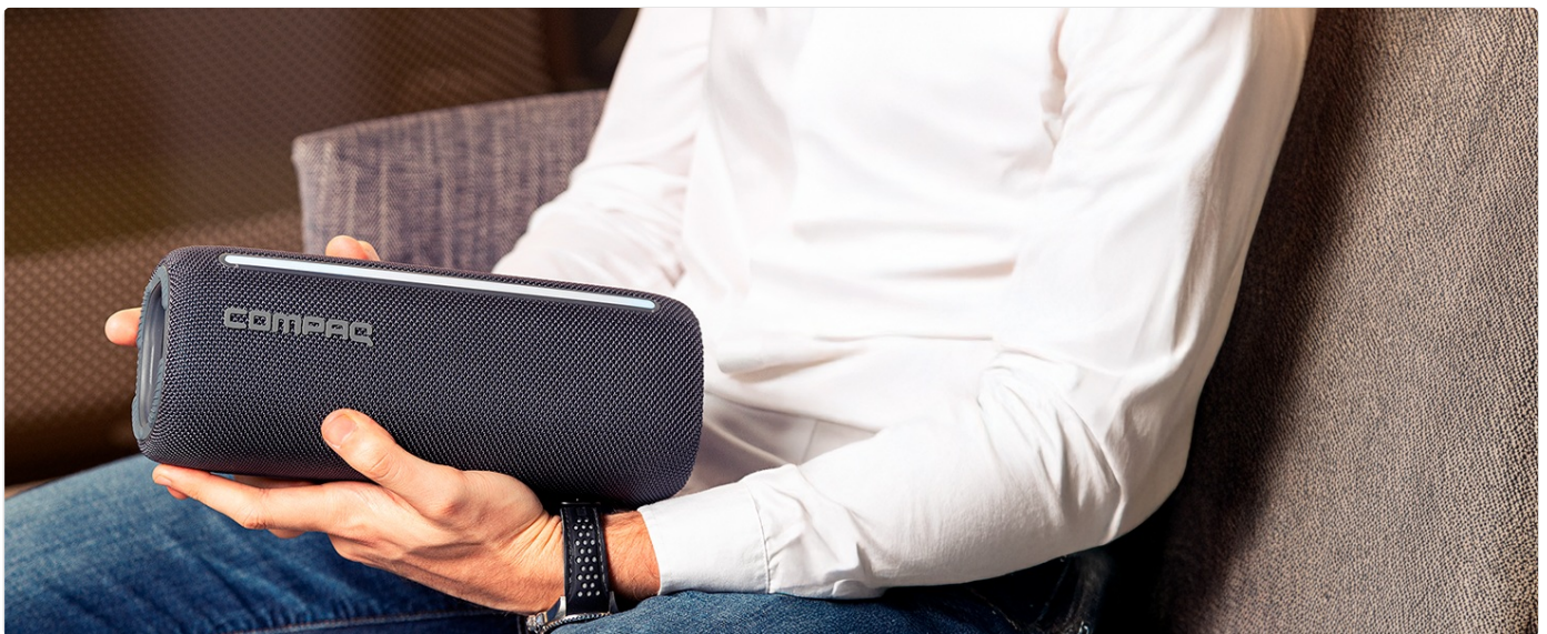
The Compaq CMQ 200W Bluetooth Speaker highlighting its Bluetooth connectivity feature.