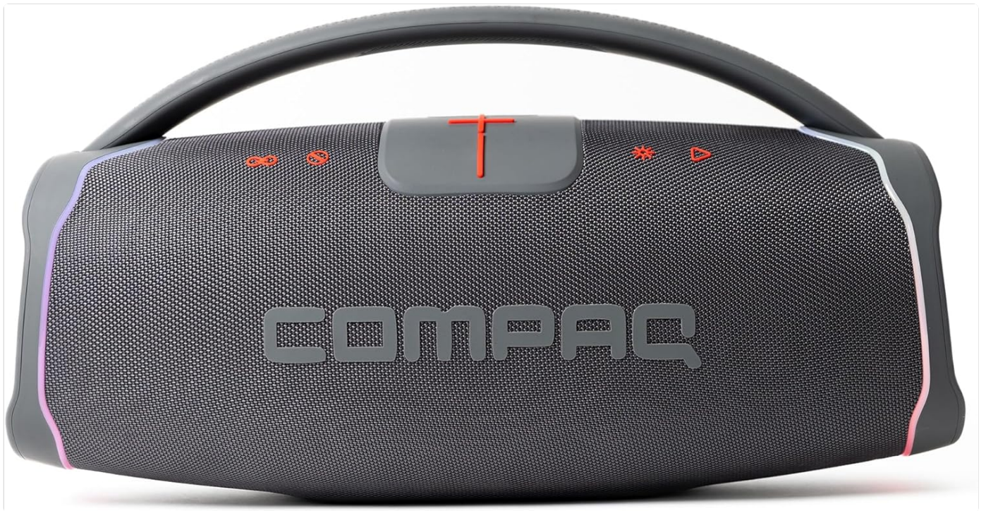
Front view of the Compaq CMQ 200W Bluetooth Speaker, showcasing the speaker grille, Compaq logo, and control panel with illuminated buttons.