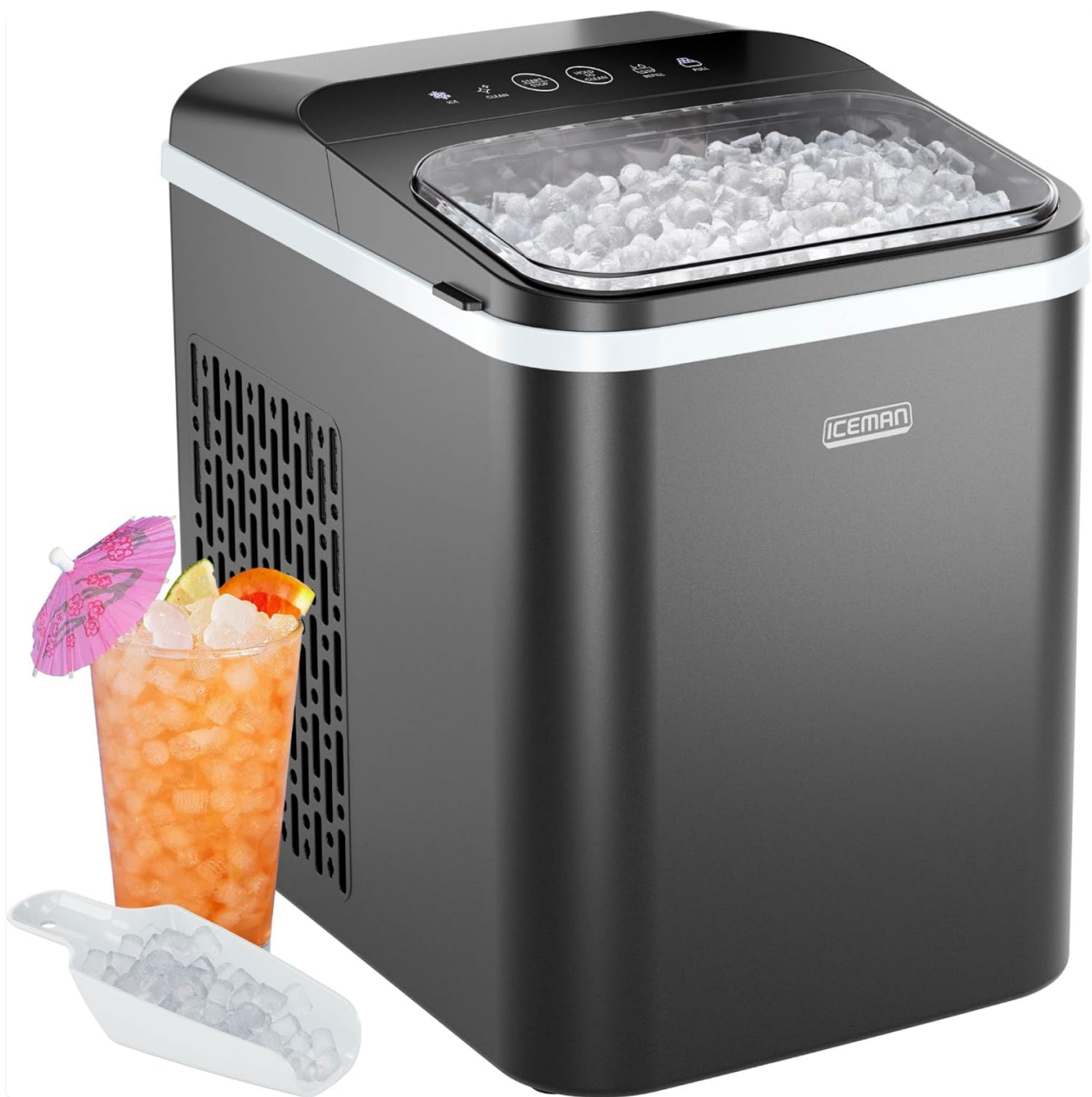
Figure 1: Iceman Compact Pebble Ice Machine