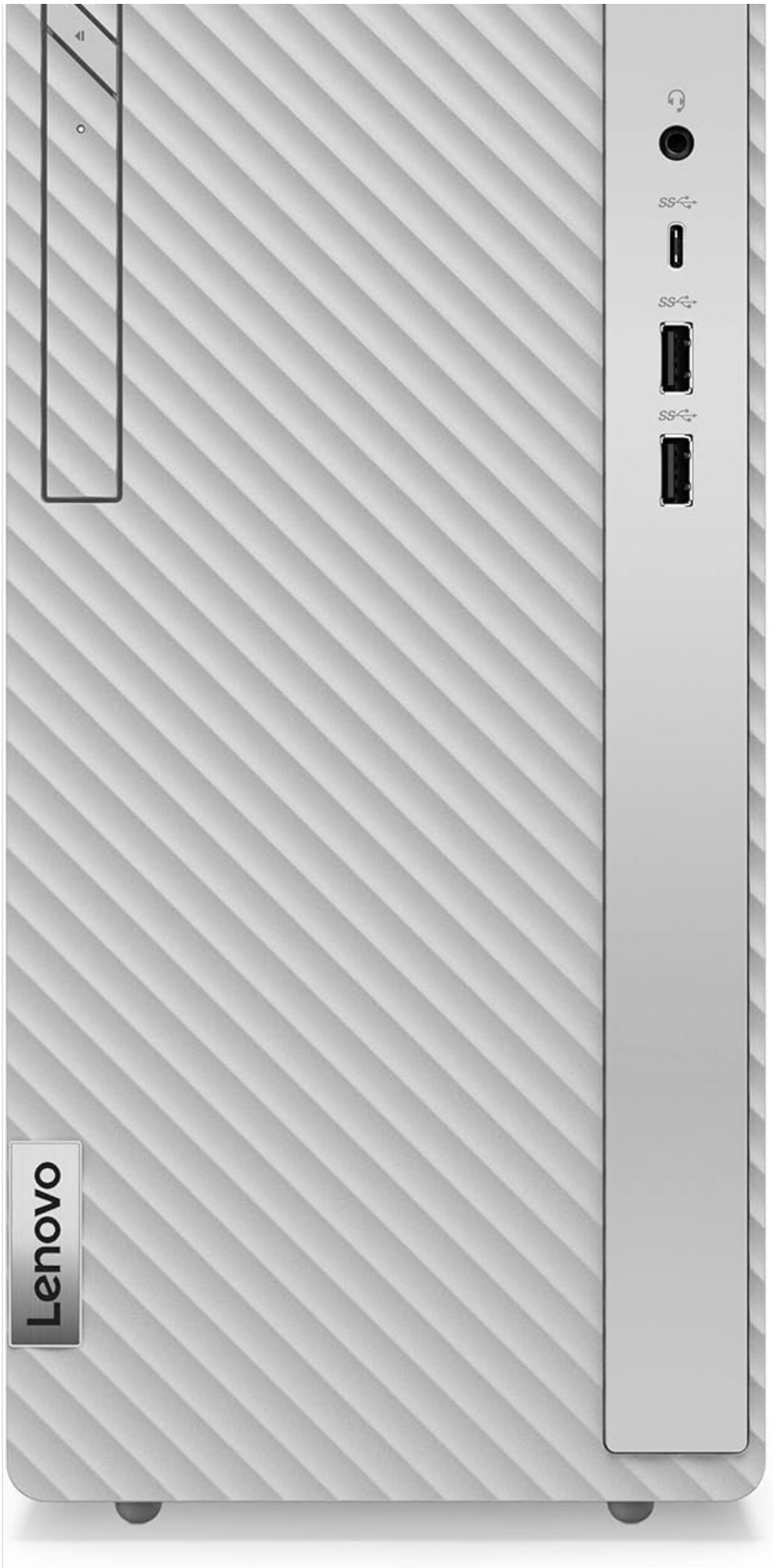
Image: Front view of the Lenovo IdeaCentre Tower Desktop Computer.