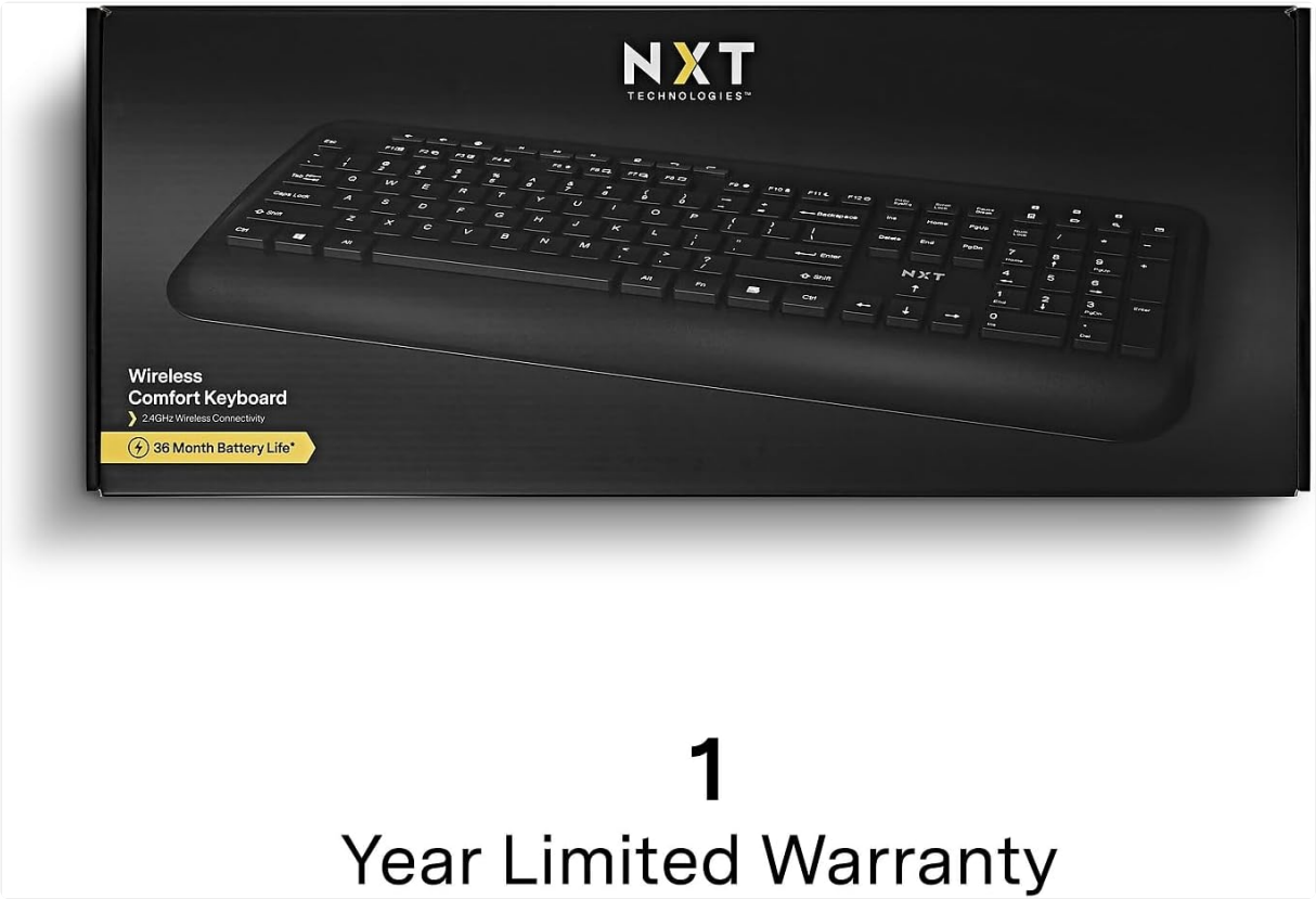
Figure 5: Product packaging indicating the 1 Year Limited Warranty provided with the keyboard.

This NXT Technologies Wireless Comfort Keyboard comes with a 1 Year Limited Warranty from the manufacturer. Please retain your proof of purchase for warranty claims.