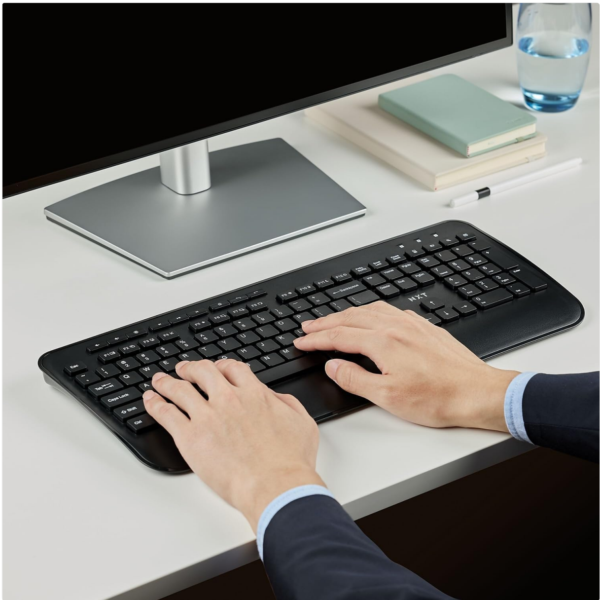
Figure 4: A user demonstrating the ergonomic design of the keyboard with hands comfortably positioned on the integrated wrist rest during typing.