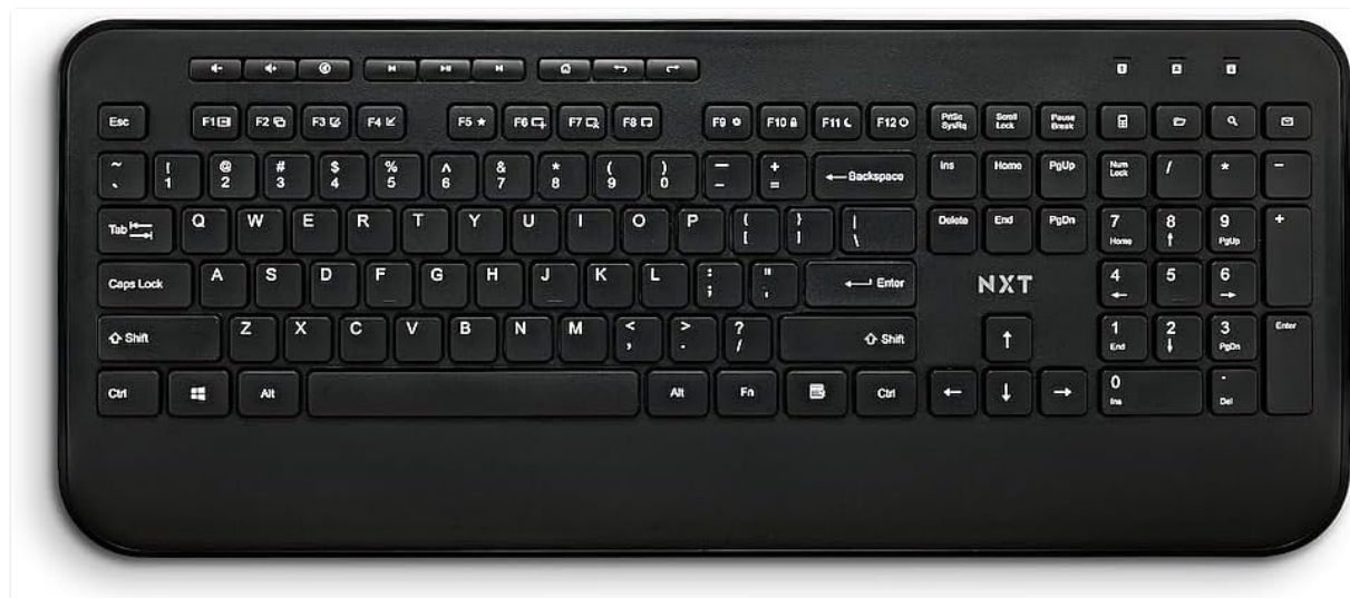
Figure 1: Top-down view of the NXT Technologies Wireless Comfort Keyboard, showcasing its full layout including the numeric keypad and function keys.

Experience reliable wireless connectivity of up to 23 feet with this wireless keyboard. A combination of media keys and hot keys ensure quick access to favorite functions and allow for easy performance of day-to-day computing tasks. The low battery indicator keeps you informed when the battery needs replacing. This wireless comfort keyboard is built with a slim key profile, while the integrated wrist rest and adjustable-tilt legs provide ergonomic comfort during extended typing.