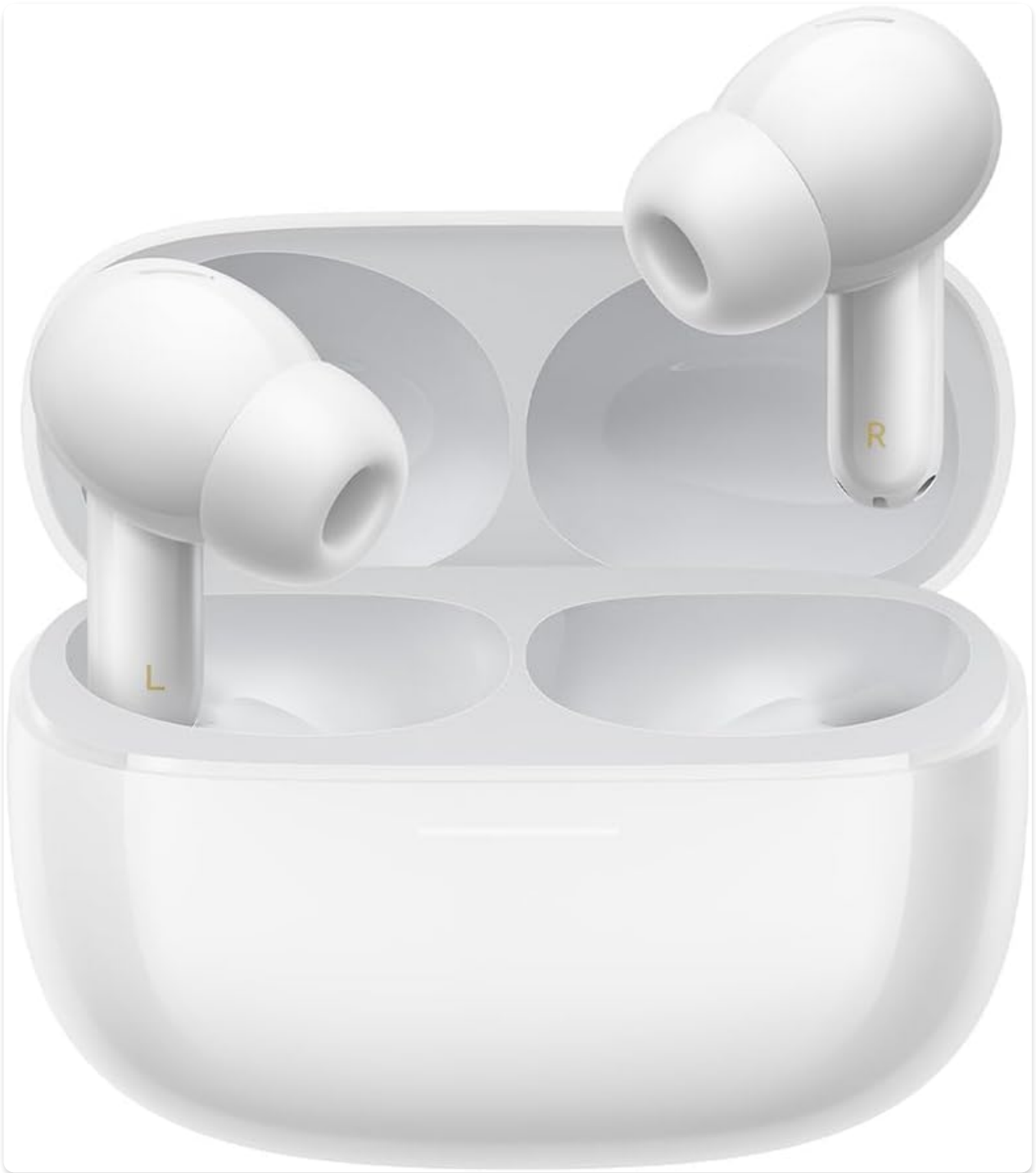
Image: The Redmi Buds 6 Pro in Glacier White, shown inside their open charging case. The earbuds are visible with their "L" and "R" indicators.