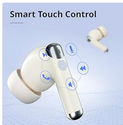
Illustration of the smart touch control functions on the earbud.

The Tronsmart Soundi R4 earbuds feature a sleek, ergonomic design for a comfortable and secure fit. Each earbud is equipped with a touch-sensitive area for easy control of various functions.