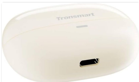
Bottom view of the charging case showing the USB-C charging port.

The Tronsmart Soundi R4 earbuds feature a sleek, ergonomic design for a comfortable and secure fit. Each earbud is equipped with a touch-sensitive area for easy control of various functions.