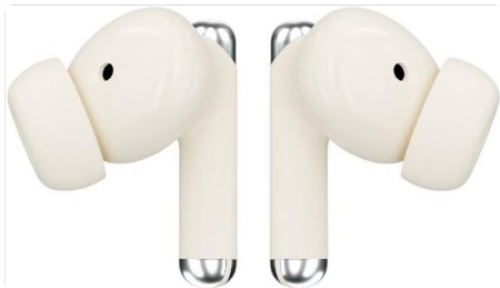
Detailed view of the left and right Soundi R4 earbuds.