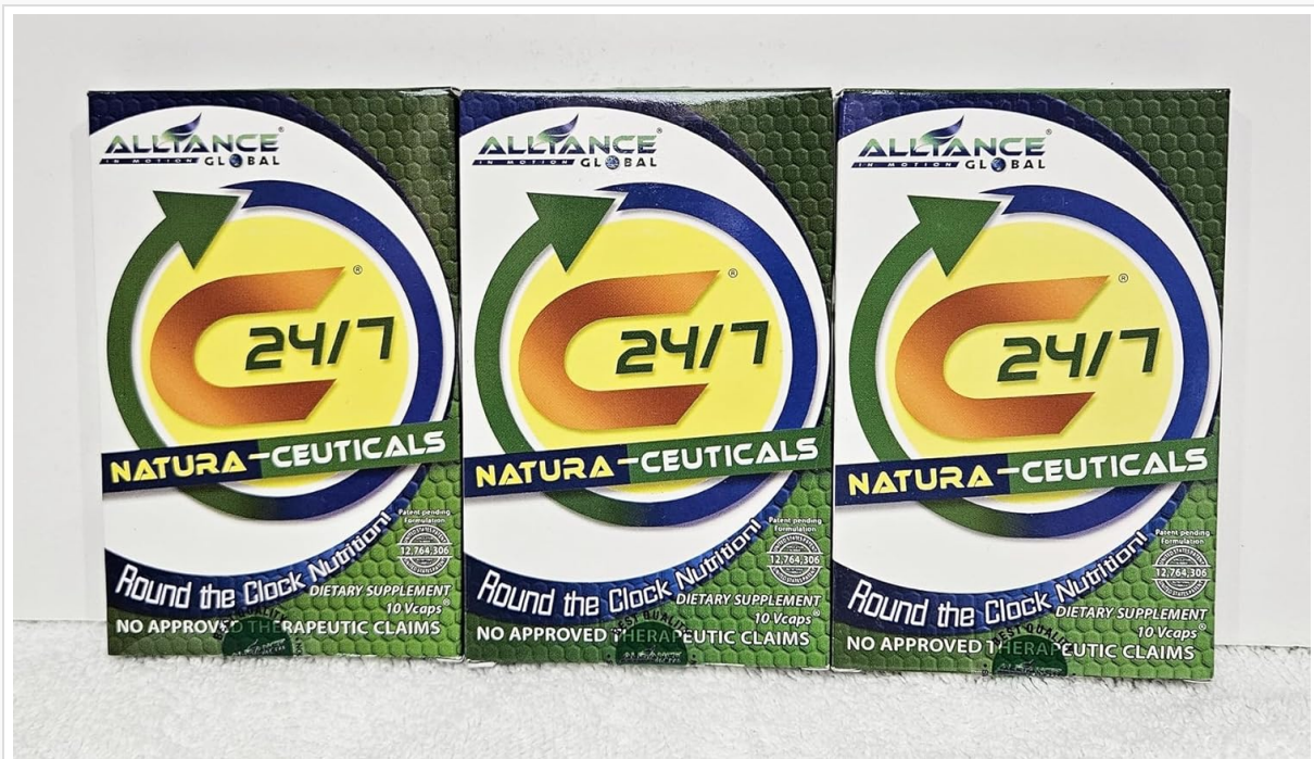
Image 1.1: Three boxes of C24/7 Natura-Ceutical Dietary Food Supplement, showcasing the product packaging.

The C24/7 Natura-Ceutical Dietary Food Supplement is designed to provide comprehensive nutritional support. Each box contains 10 tablets, formulated with a blend of essential vitamins, minerals, amino acids, and other beneficial compounds to support overall health and wellness.