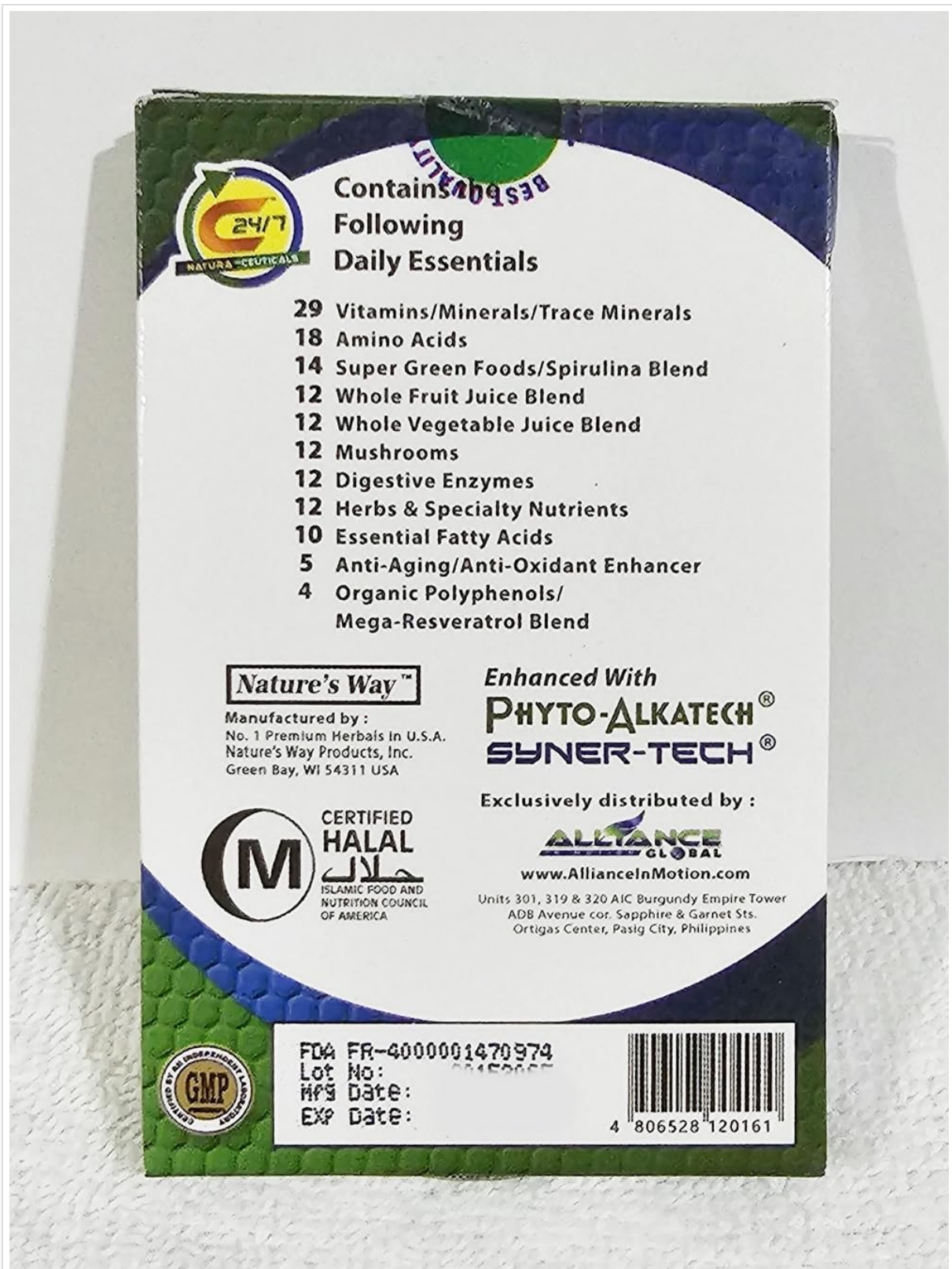
Image 3.1: Back of the C24/7 Natura-Ceutical box, detailing the extensive list of ingredients and nutritional components.