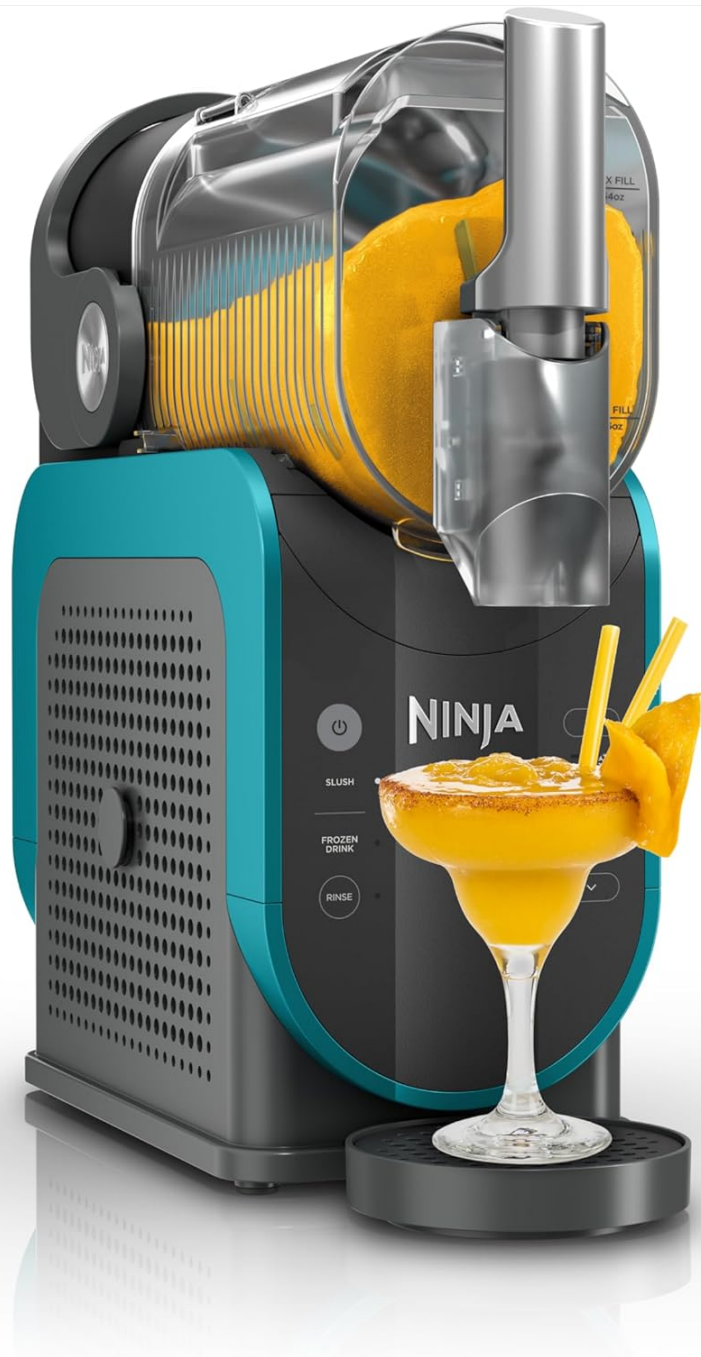
Figure 1: The Ninja SLUSHi Professional Frozen Drink Maker, showcasing its sleek design and the 88 oz. vessel.