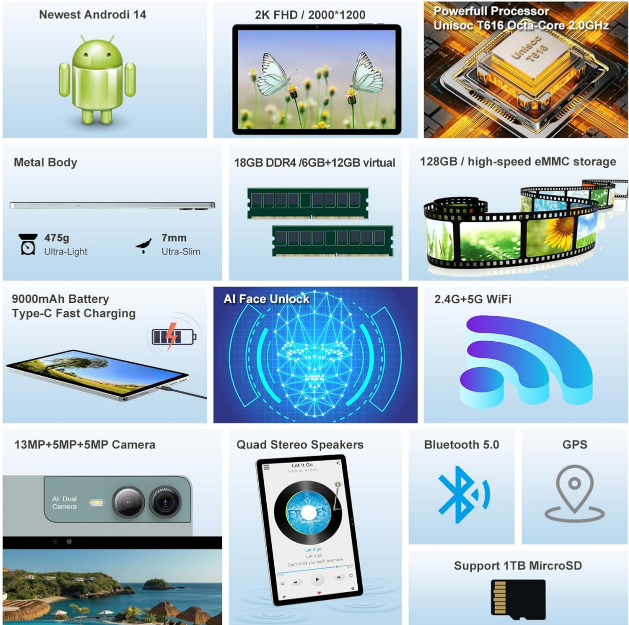
Image: A visual summary of the Brvaiuen F11 Tablet's core specifications, including Android 14, 2K display, T616 processor, RAM, storage, battery, cameras, and connectivity options.