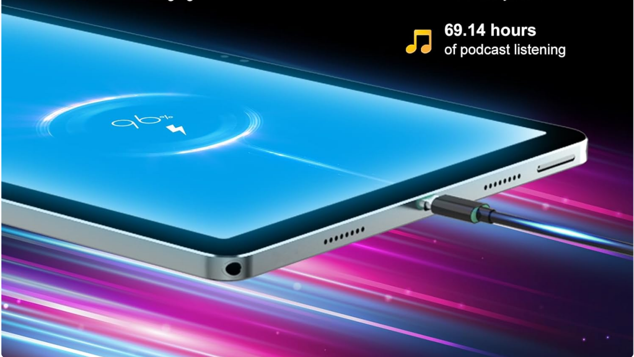
Image: The Brvaiuen F11 Tablet connected to a charger, illustrating its 9000mAh battery and 15W fast charging capability, with estimated usage times for video playback, standby, and podcast listening.