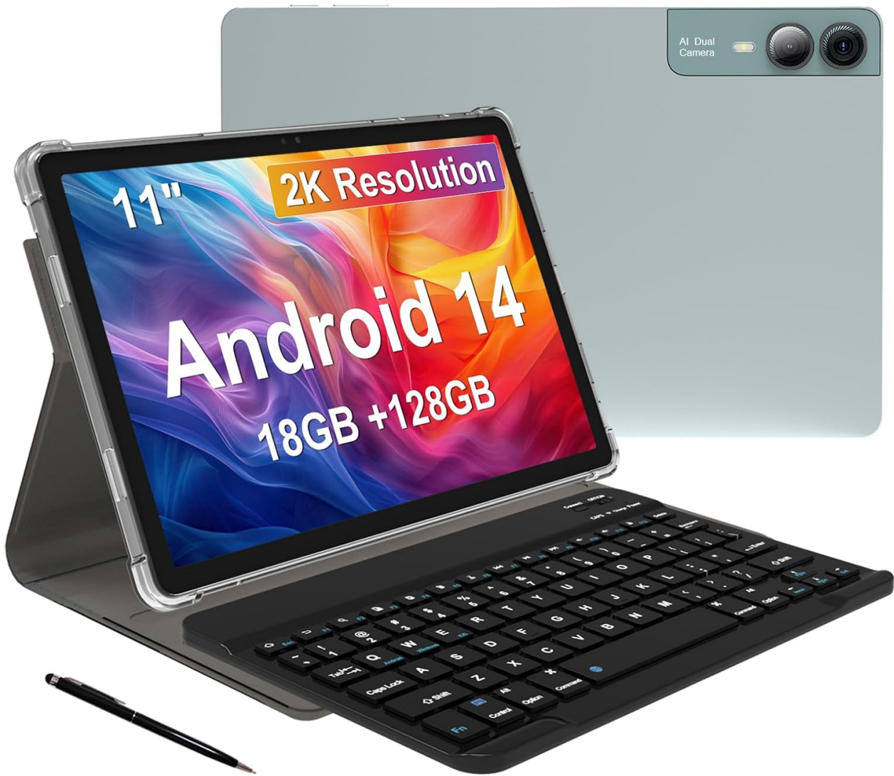
Image: Front view of the Brvaiuen F11 Tablet with the detachable keyboard and stylus, showcasing the 11-inch display and rear camera module.