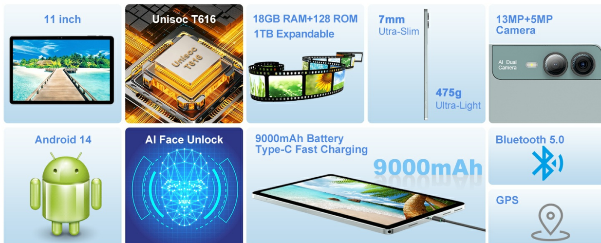
Image: Detailed view of the tablet's triple camera system, highlighting the 13MP autofocus rear camera, 5MP AI secondary camera, and 5MP front camera with AI Face Unlock capabilities.