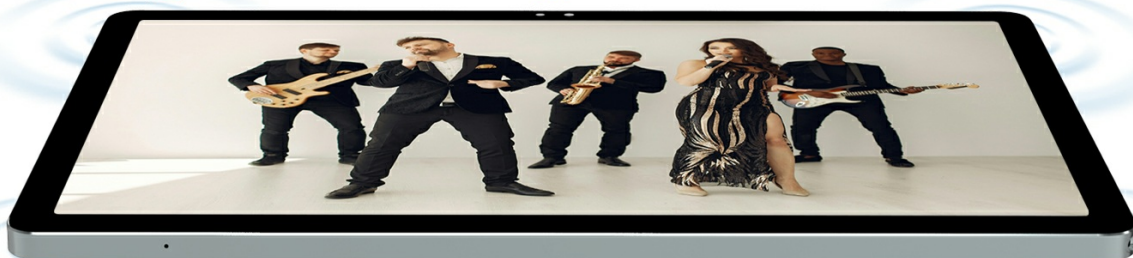
Image: Illustration depicting the tablet's connectivity features, including dual-band Wi-Fi and Bluetooth 5.0, enabling connection to various devices and networks.