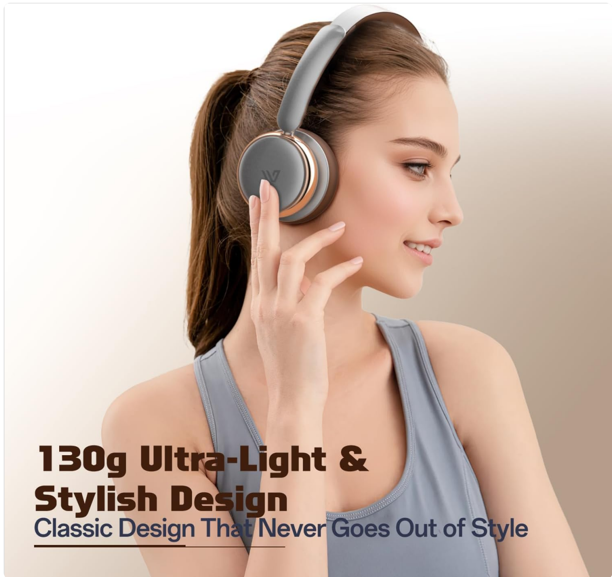
Image: A woman wearing the Weofly Nova headphones, illustrating their lightweight and stylish design. The headphones weigh only 130g.

Cancellation and Bluetooth 5.4 connectivity.