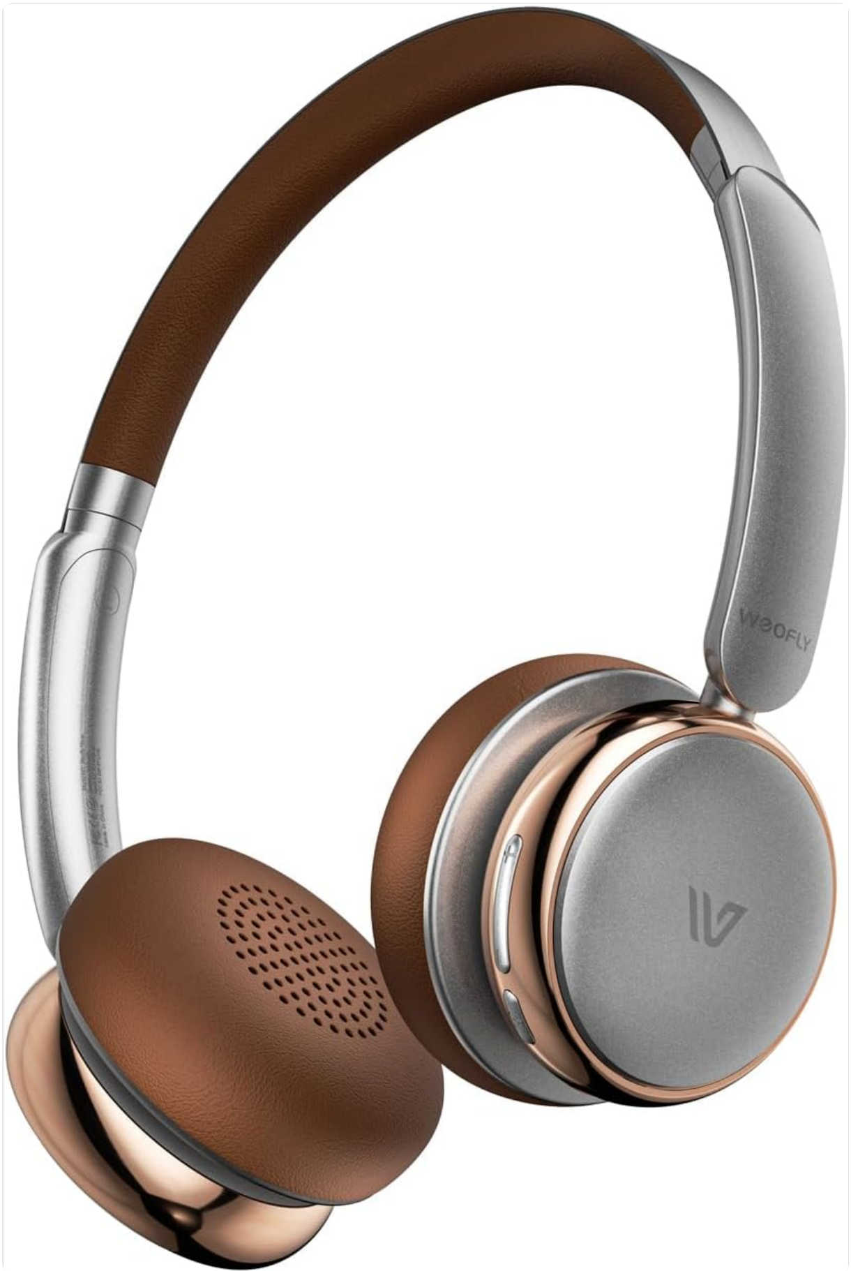
Image: The Weofly Nova Active Noise Cancelling Headphones in Silver, showcasing their design.