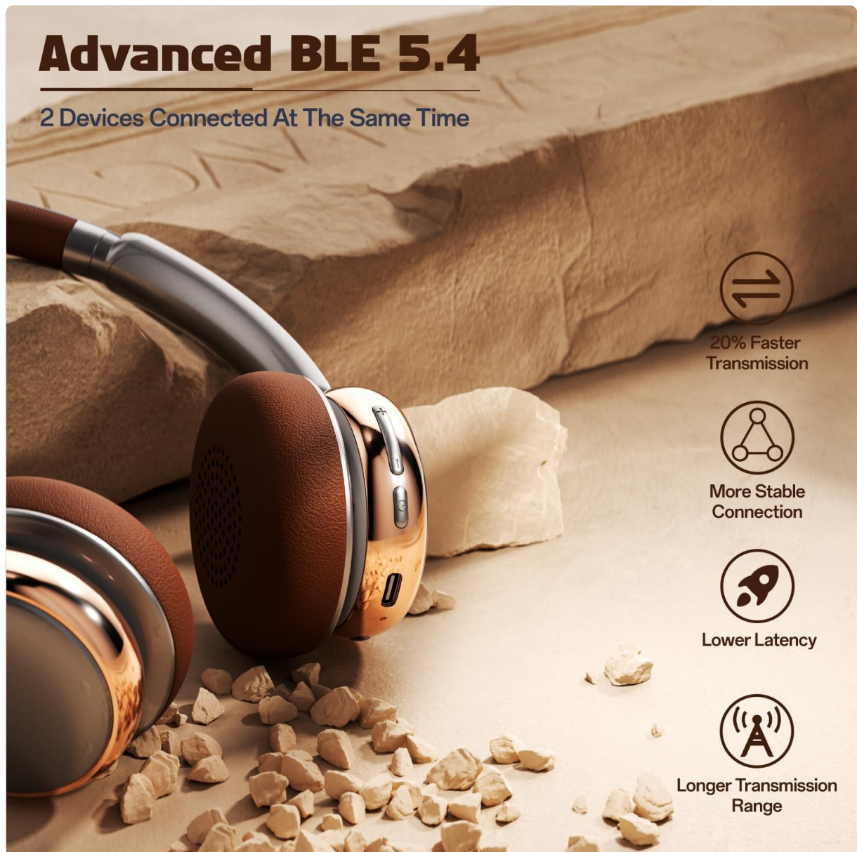
Image: An illustration showing the Weofly Nova headphones connecting to a laptop and a smartphone via advanced Bluetooth 5.4, highlighting faster transmission and stable connection.

The headphones can connect to two devices simultaneously. To connect a second device, repeat the pairing process. The headphones will automatically switch between devices for calls or media playback.