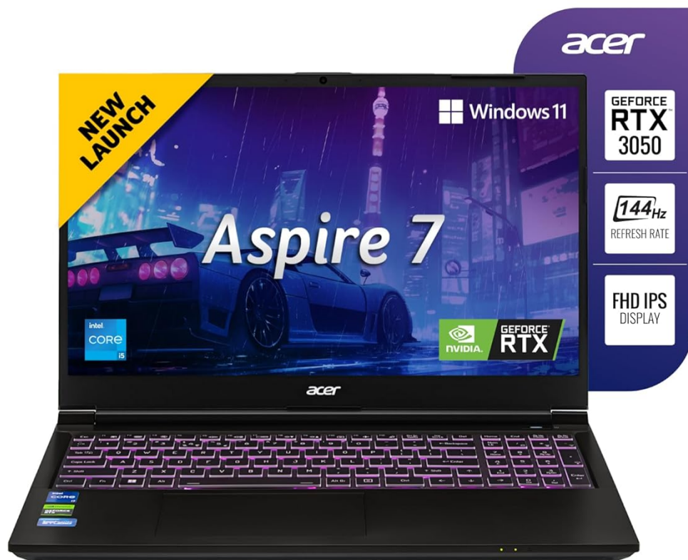
Image: The Acer Aspire 7 A715-79G laptop with its lid open, showcasing the display and keyboard.