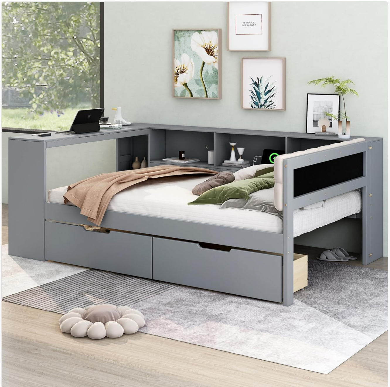
Image: Fully assembled Flieks Full Size Platform Bed, showcasing the integrated storage shelves, charging station, and under-bed drawers.