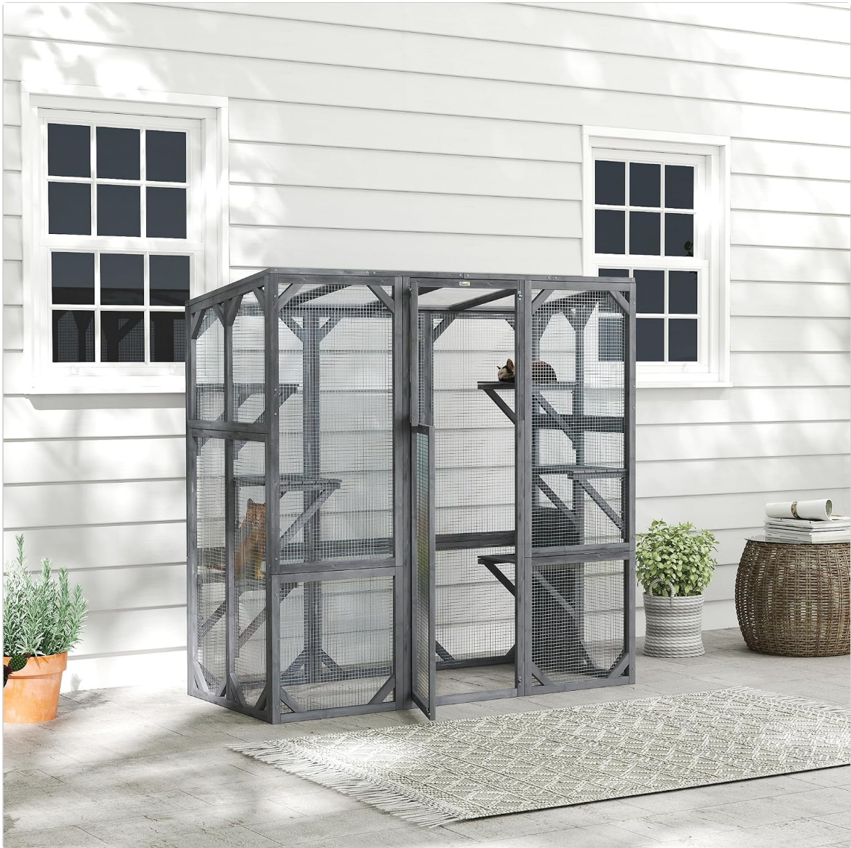
Figure 4.2: Dimensional overview of the catio, showing height, width, and depth, along with platform placements.