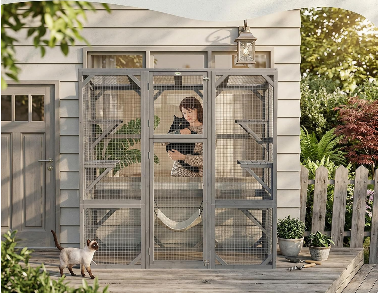
Figure 5.1: Example of connecting the catio to a window for direct cat access.

Can be connected to a window or a pet door and allow cats to enter freely