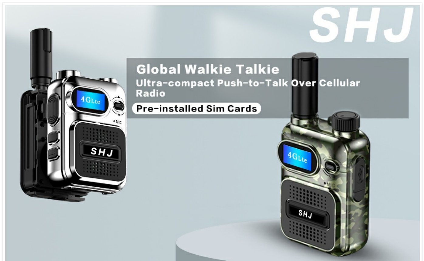
Image 1.1: The SHJ H28Y 4G PoC Radio, highlighting its ultra-compact design and Push-to-Talk Over Cellular capabilities.

The SHJ H28Y 4G PoC Radio is designed for reliable and efficient communication over 4G LTE cellular networks. This device utilizes Push-to-Talk Over Cellular (PoC) technology, enabling instant voice communication across wide areas. This manual provides essential information for setting up, operating, maintaining, and troubleshooting your radio.