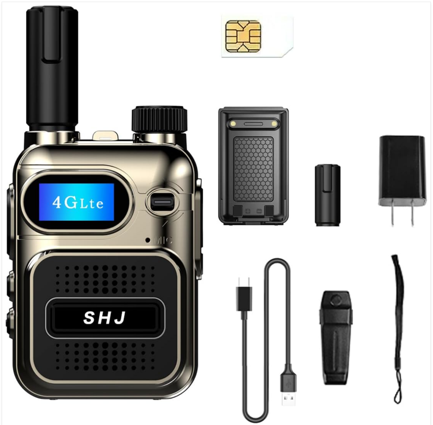
Image 2.1: Contents of the SHJ H28Y 4G PoC Radio package, including the radio, SIM card, battery, charger, and other accessories.