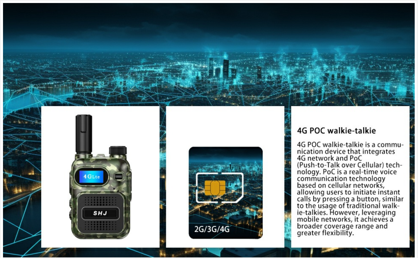
Image 3.1: Illustration of the 4G PoC radio and SIM card, demonstrating the concept of cellular network integration.