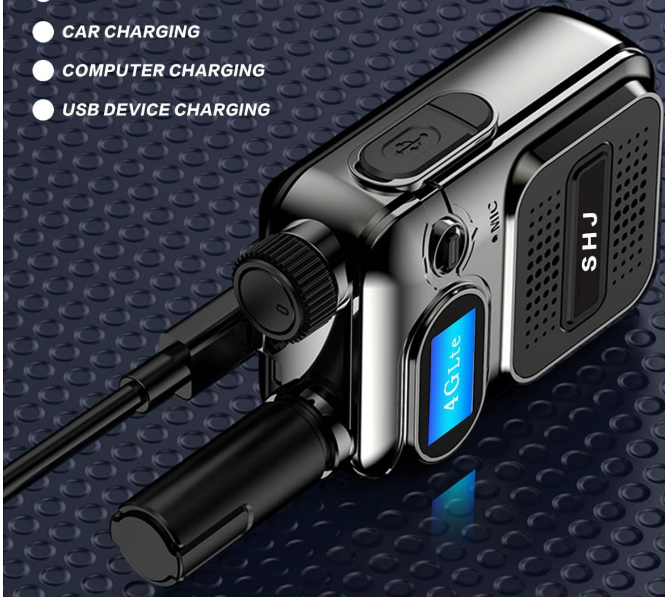
Image 3.2: The SHJ H28Y radio being charged via its Type-C port, illustrating various charging methods.