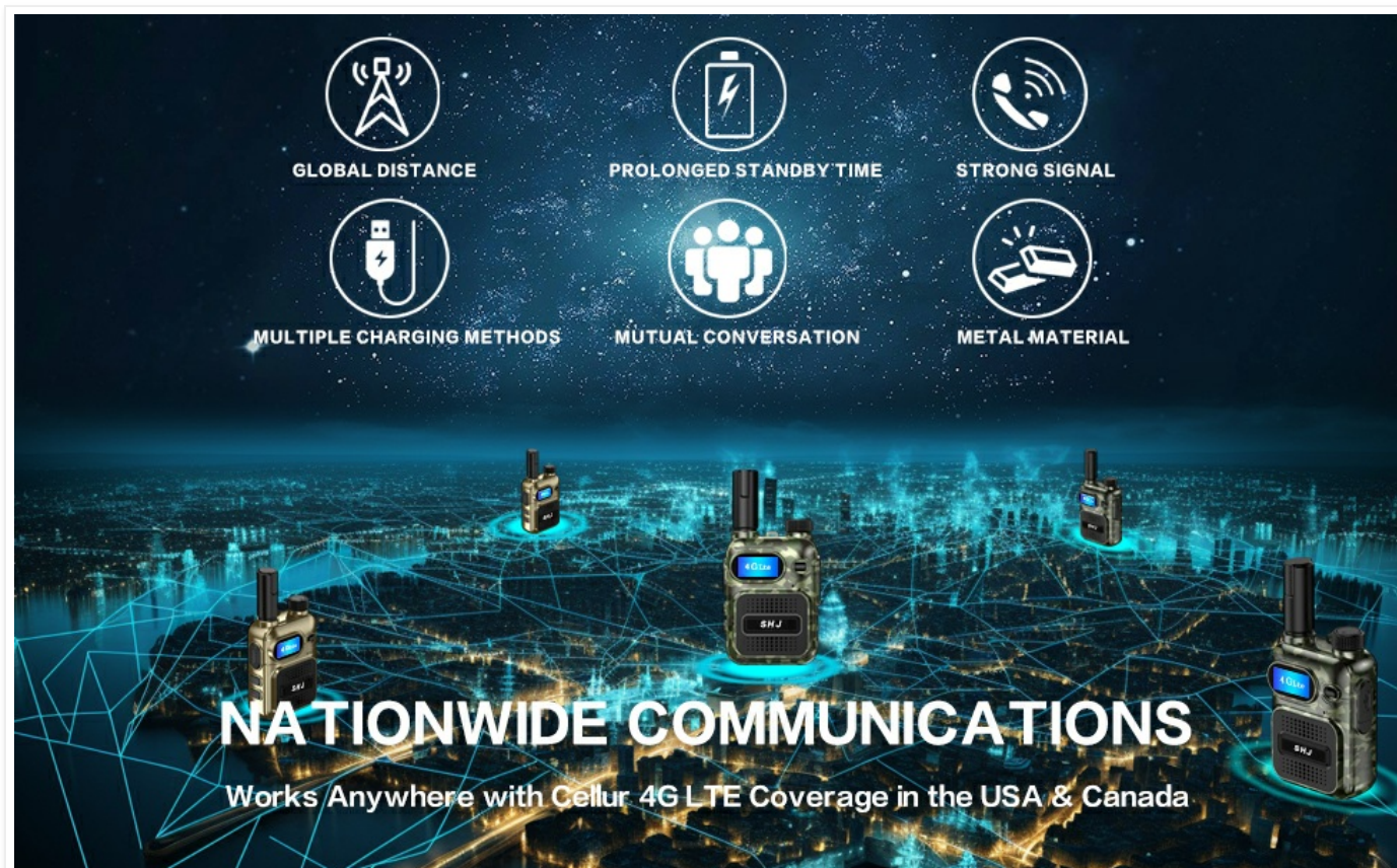
Image 4.2: Depiction of nationwide communication capabilities, emphasizing operation within 4G LTE coverage areas.