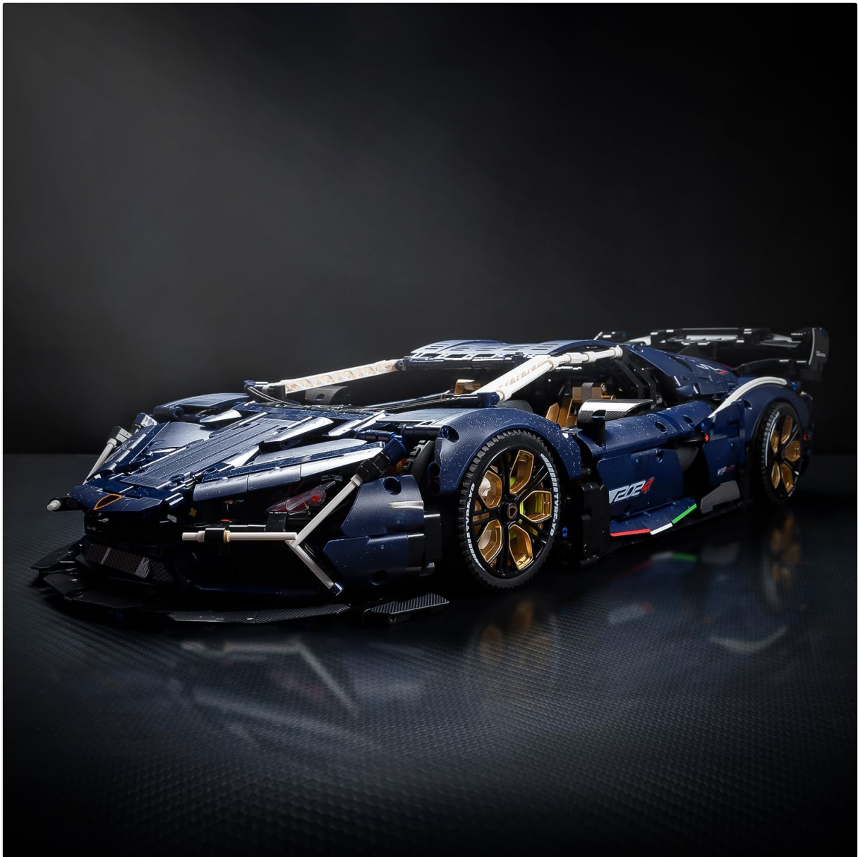
Image: A dynamic side view of the UNCLE BRICK Lamb AVENTTAOR Technic Car Model, highlighting its stellar deep blue finish and golden wheels.