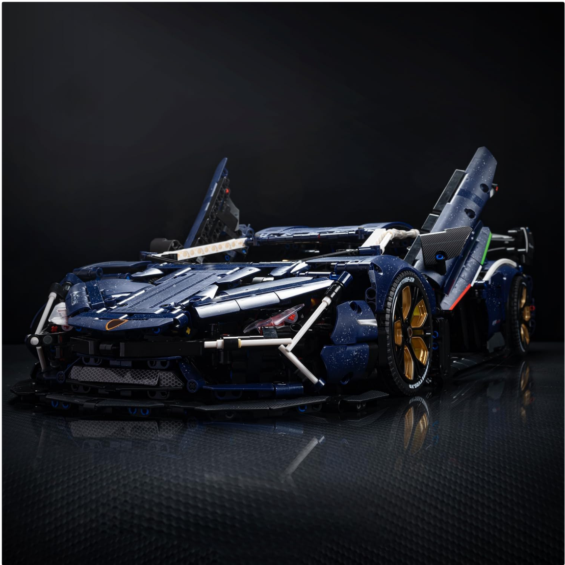
Image: The UNCLE BRICK Lamb AVENTTAOR model with its classic scissor doors in the open position, highlighting the interior details.