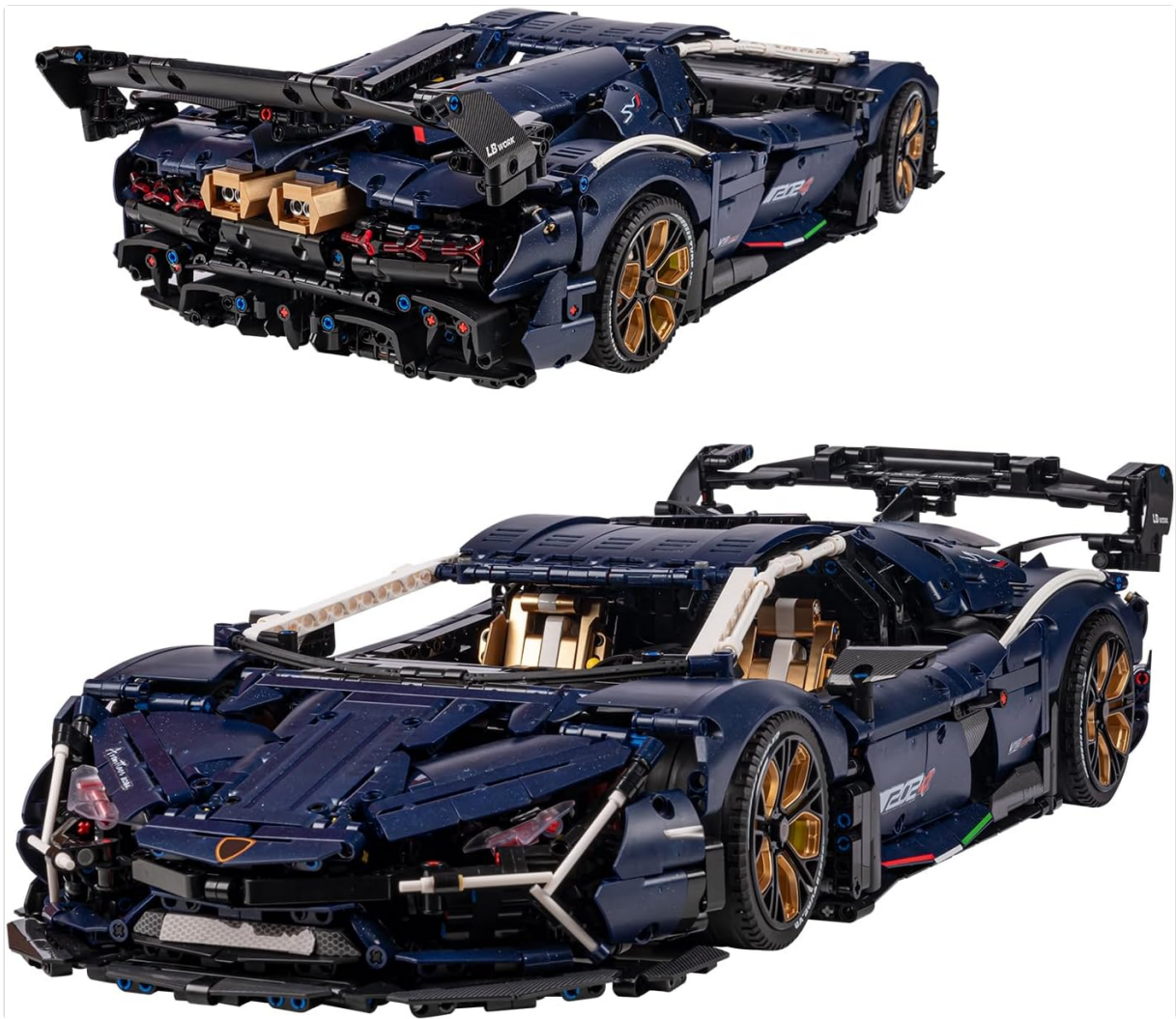
Image: The fully assembled UNCLE BRICK Lamb AVENTTAOR Technic Car Model, showcasing its detailed design and stellar deep blue exterior.