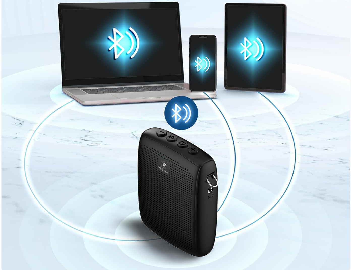
Figure 4.2: Seamless Bluetooth connectivity for audio playback.

Effortlessly connect your devices for easy audio