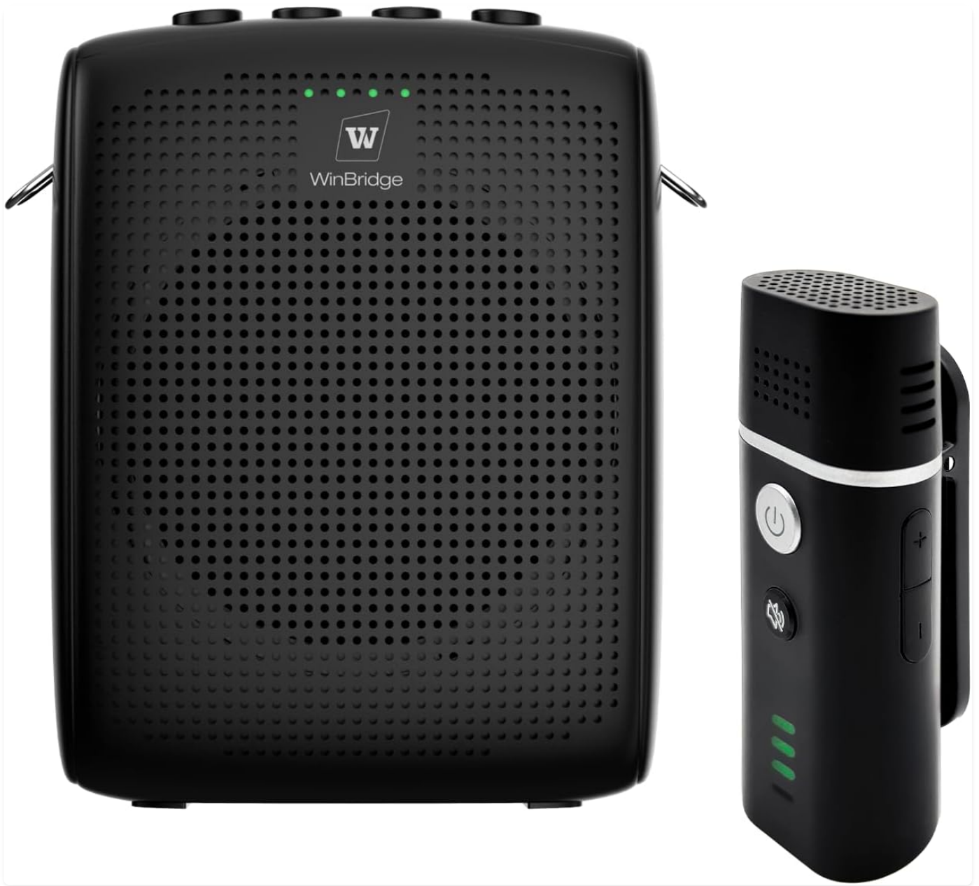
Figure 1.1: WinBridge WB006 Portable Voice Amplifier and U10 Wireless Lavalier Microphone.