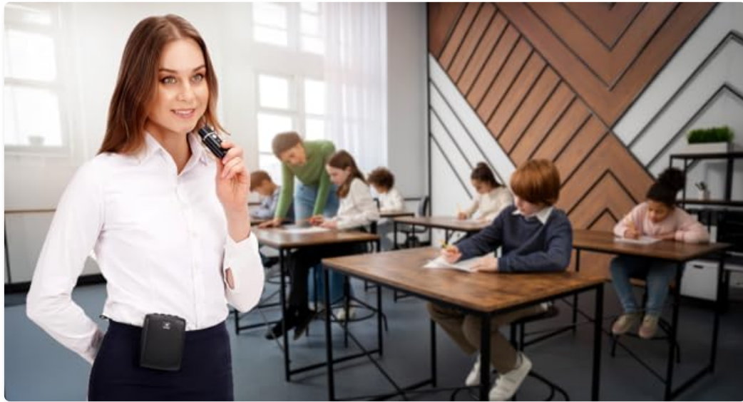
Figure 3.3: Multiple ways to wear the microphone and speaker for comfort and convenience.

Important Note: To ensure optimal sound quality and prevent sound delay or feedback, the speaker and wireless lavalier microphone should not be placed too close to each other during operation. Maintain a reasonable distance.