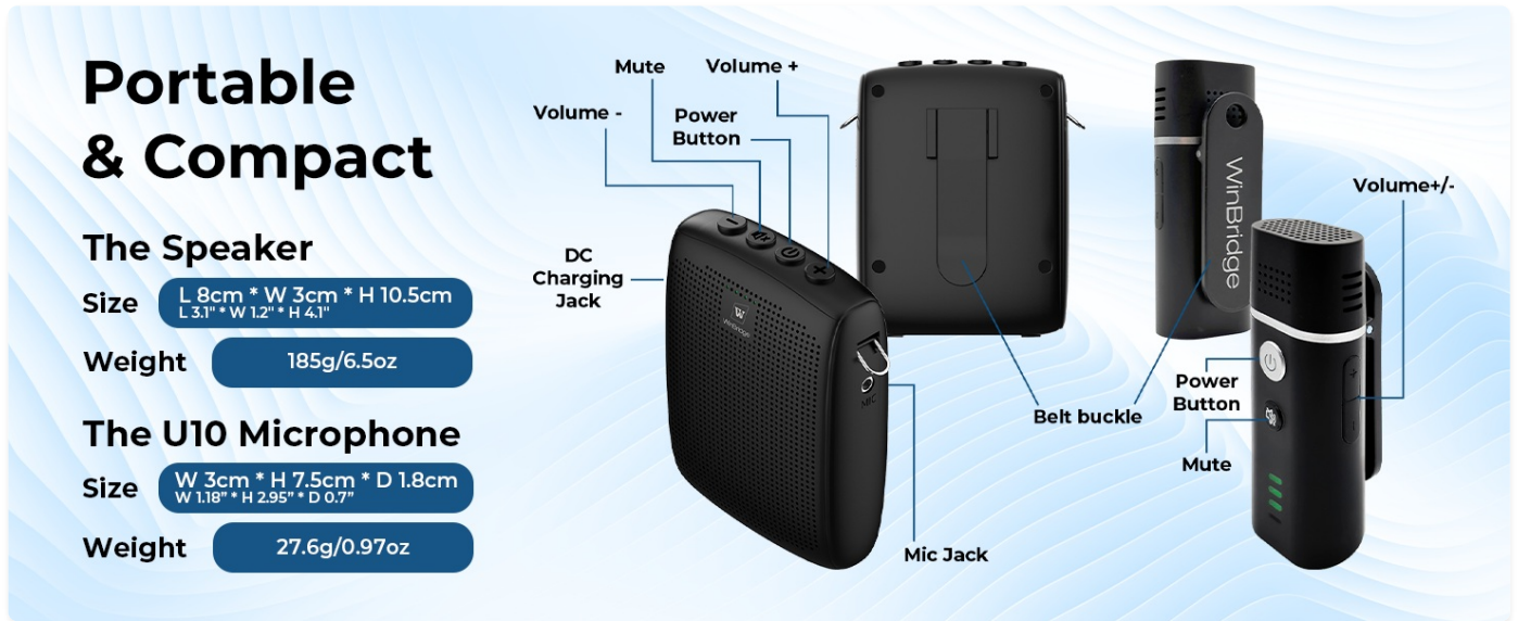
Figure 4.1: Instant mute control on the microphone.