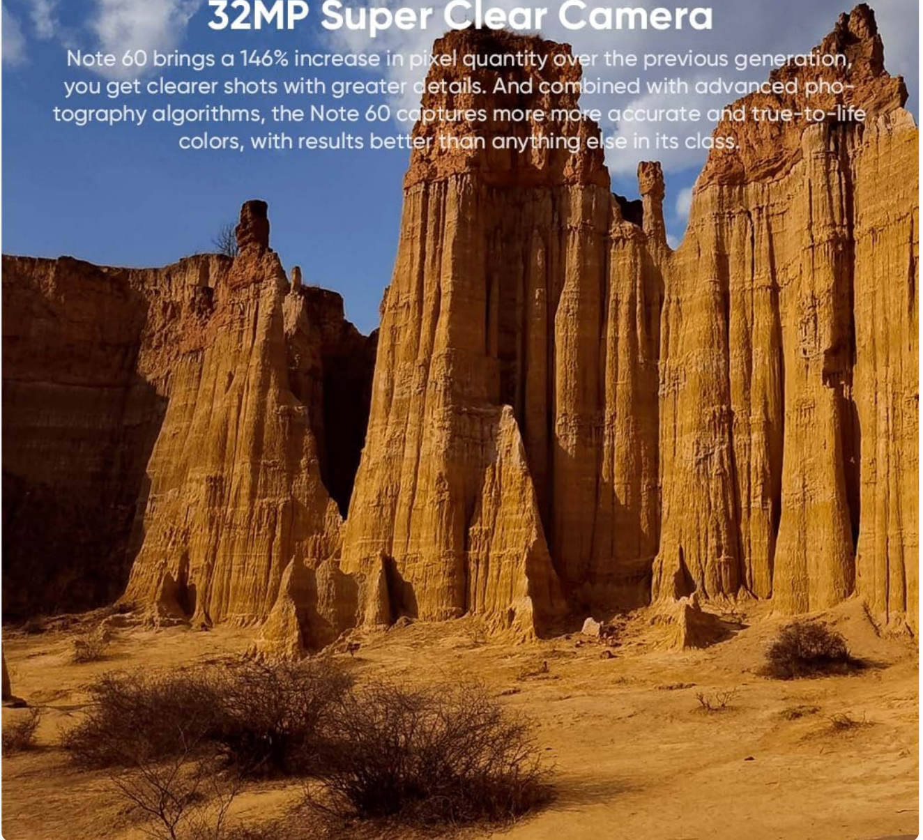
Figure 4: An example image demonstrating the clarity and detail captured by the 32 MP Super Clear Camera.

Note 60 brings a 146% increase in pixel quantity over the previous generation, you get clearer shots with greater details. And combined with advanced photography algorithms, the Note 60 captures more accurate and true-to-life colors, with results better than anything else in its class.