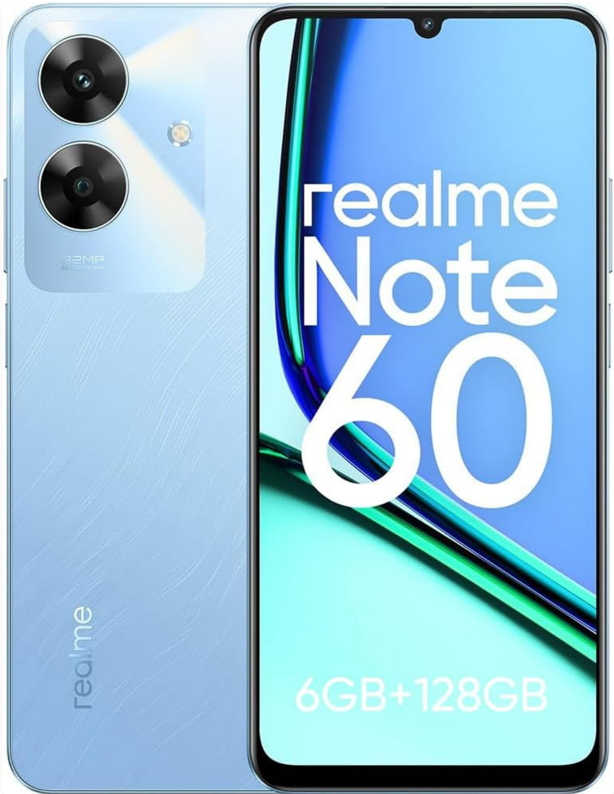
Figure 1: Front and rear view of the realme Note 60 smartphone, highlighting its sleek design and camera module.