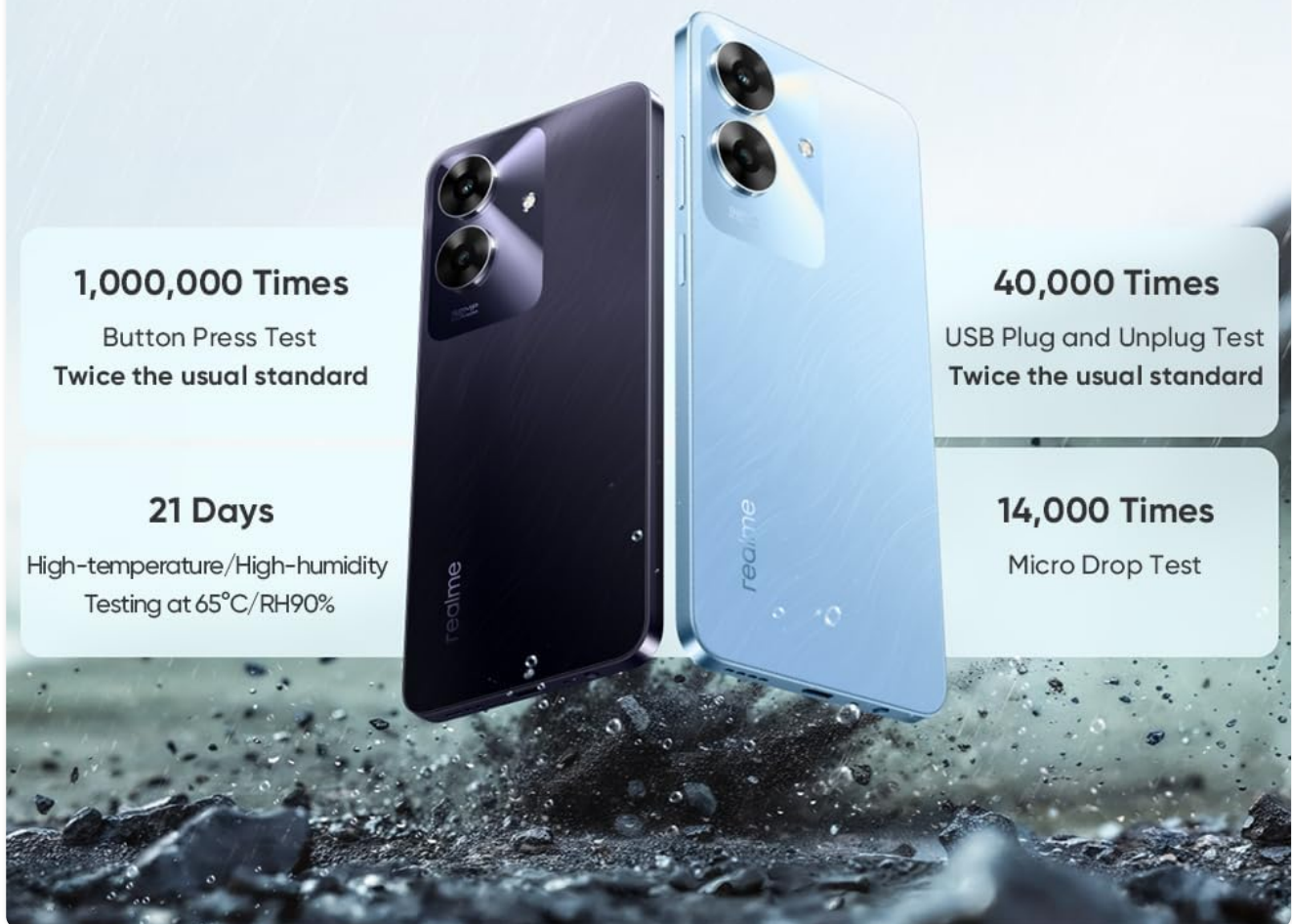
Figure 7: Illustration of the extensive quality testing the realme Note 60 undergoes to ensure durability and reliability.