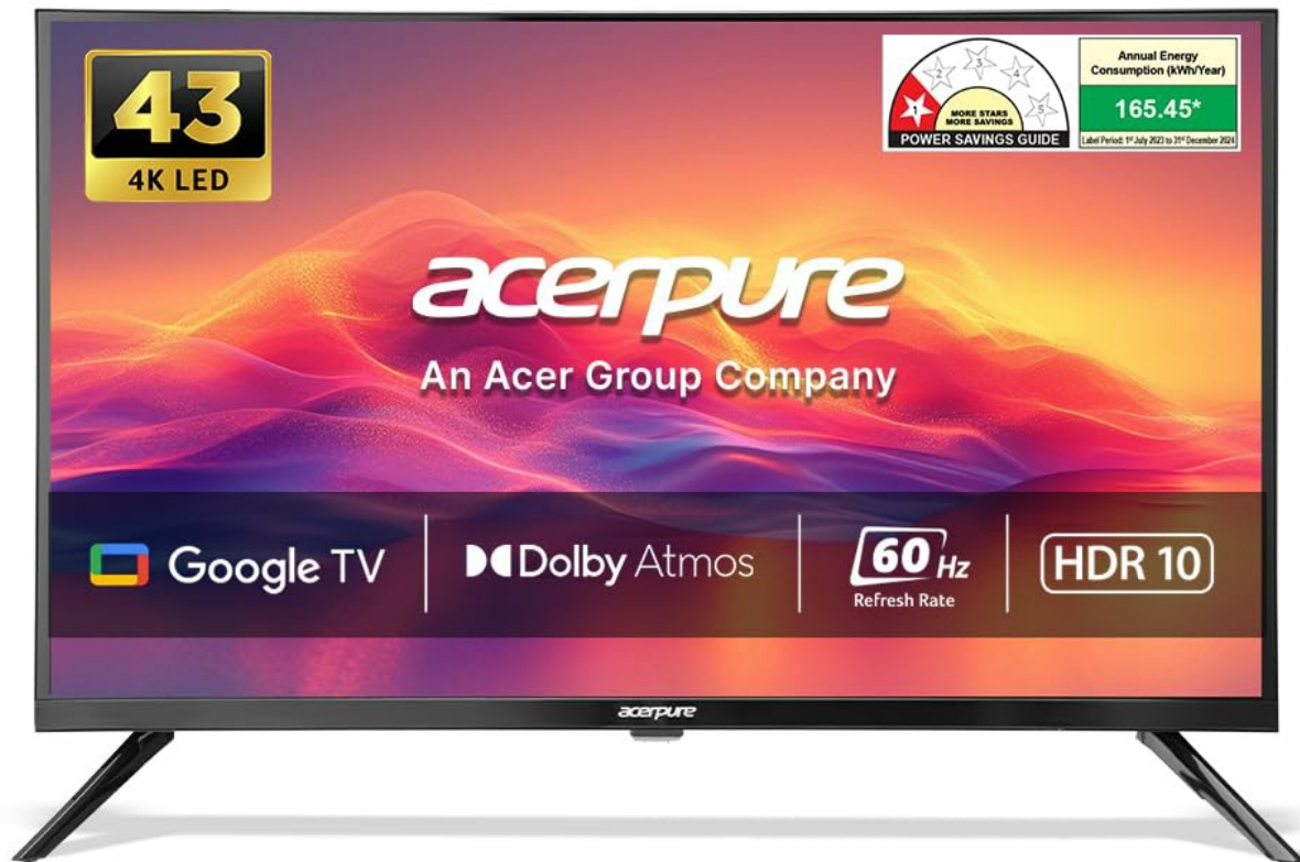
Image: The Acerpure Swift Series 43-inch UHD LED Smart Google TV with its included table stand.