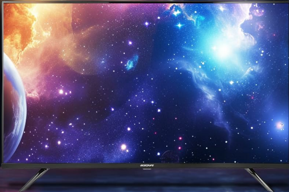
Image: The television displaying content with a visual representation of Dolby Atmos sound.