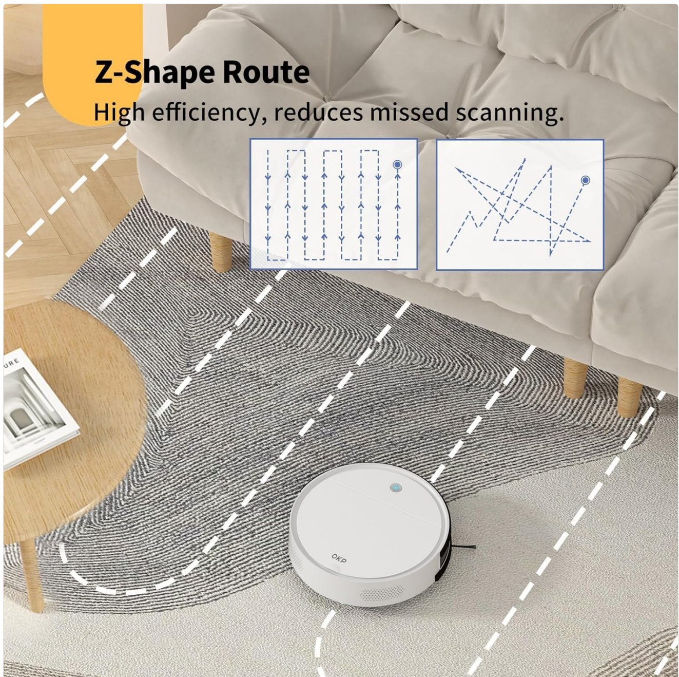
Image: The OKP Life K5 Robot Vacuum cleaning a room, with an overlay illustrating its efficient Z-Shape (zigzag) cleaning path, designed to maximize coverage and minimize missed areas.