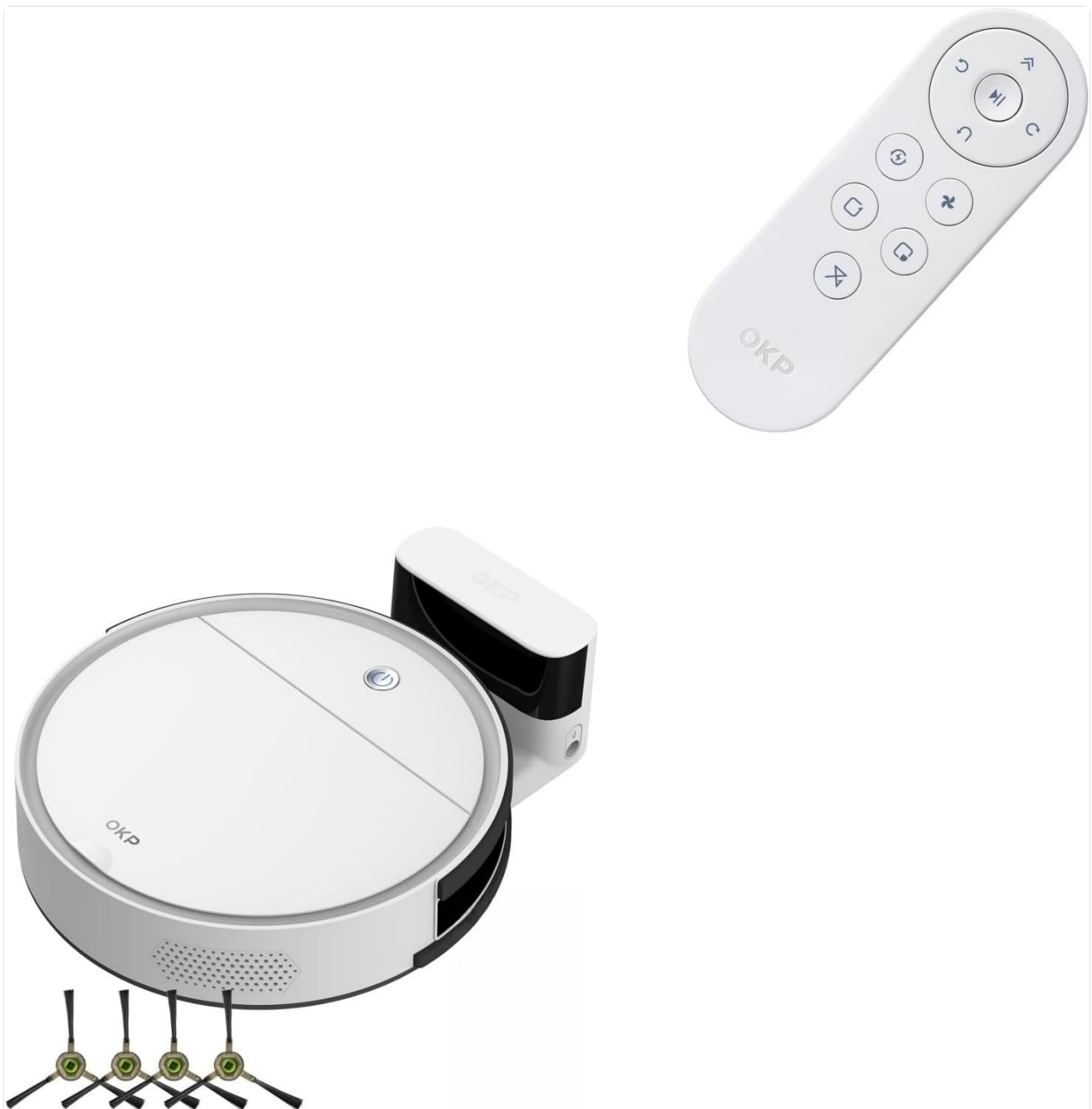
Image: A top-down view of the OKP Life K5 Robot Vacuum, highlighting its sleek, disc-shaped design and central power button.