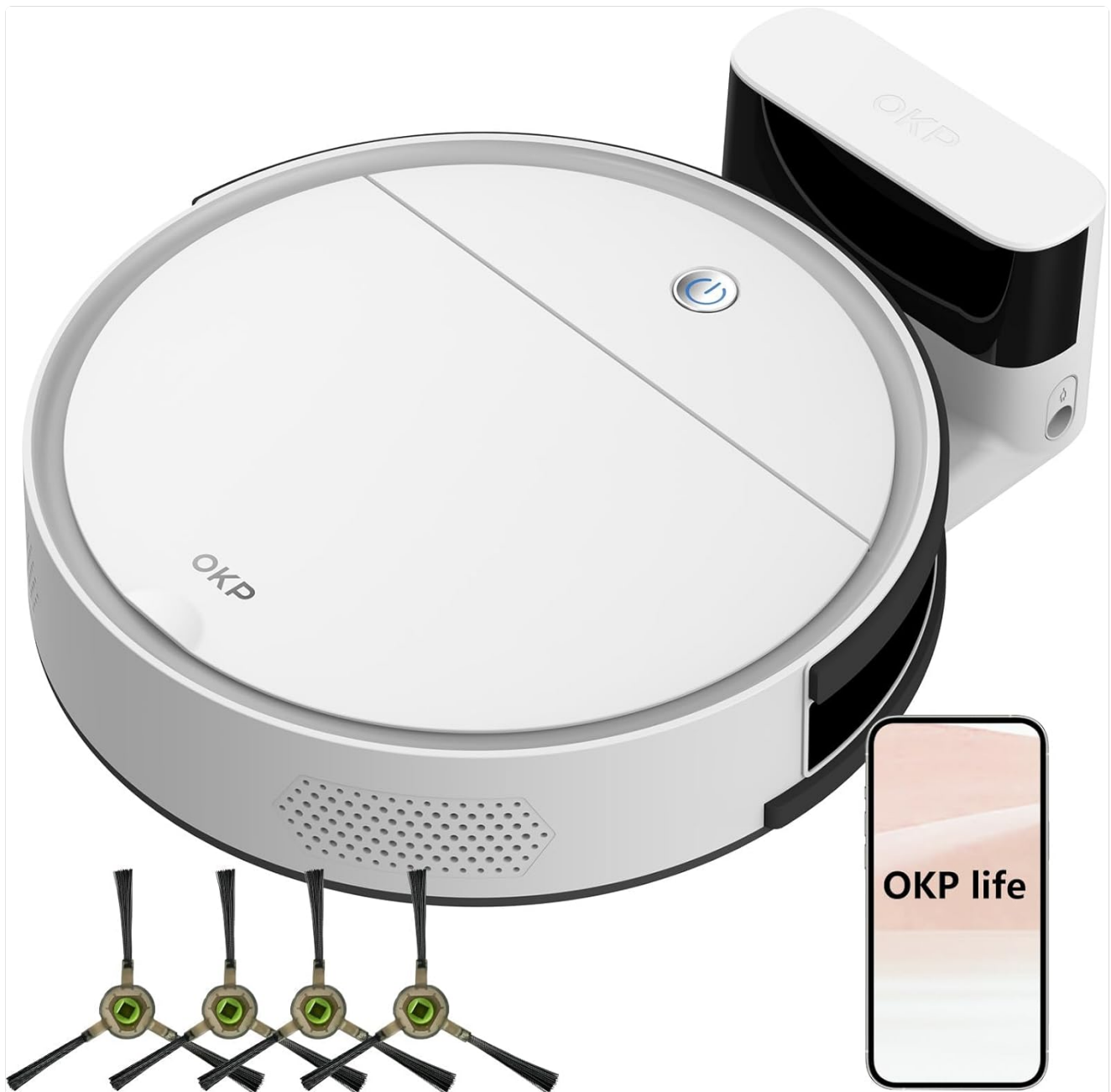
Image: The OKP Life K5 Robot Vacuum, its remote control, and a set of four side brushes, illustrating the typical package contents.