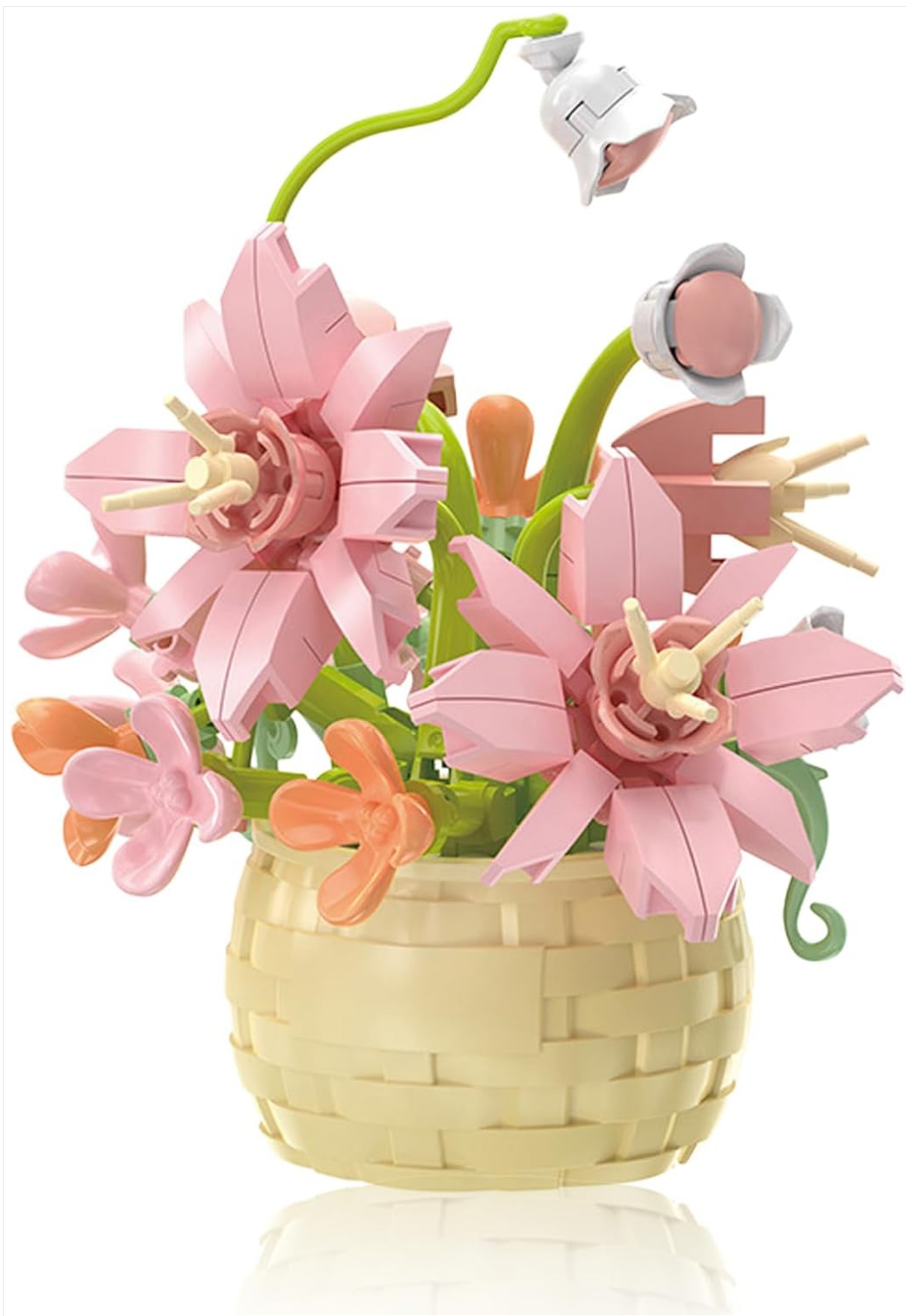
Image: The assembled Perfume Lily Mini Flowers Building Block Set, showcasing the delicate pink and white flower design within a light-colored flowerpot.