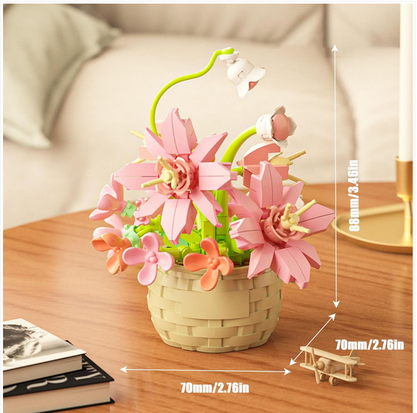
Image: The Perfume Lily building block set displayed with its approximate dimensions (88mm height, 70mm width), indicating its compact size.

Tip: Working on a clean, flat surface can prevent loss of small pieces. Patience is key when assembling mini bricks.