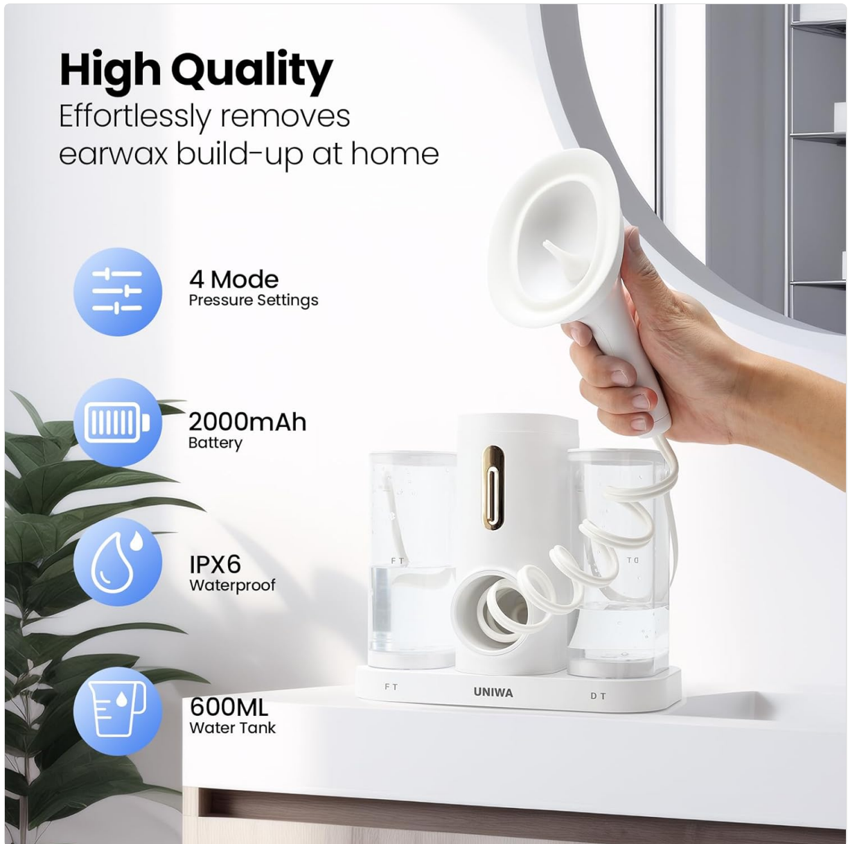
Image: The UNIWA Electric Ear Cleaner unit, illustrating its key features including 4 pressure settings, 2000mAh battery, IPX6 waterproof rating, and 600ml water tank capacity.