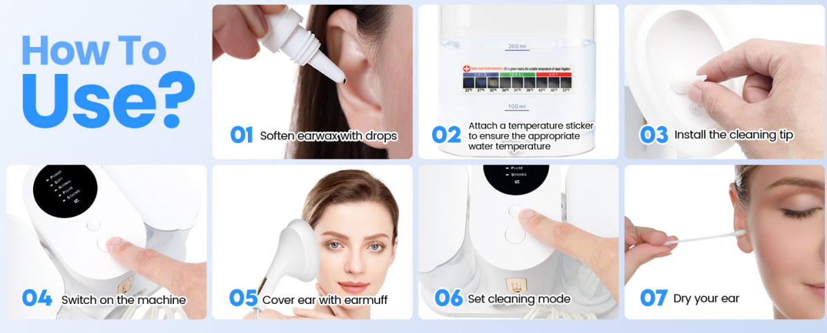
Image: Visual guide showing steps for softening earwax, checking water temperature, installing the cleaning tip, and preparing the device for use.