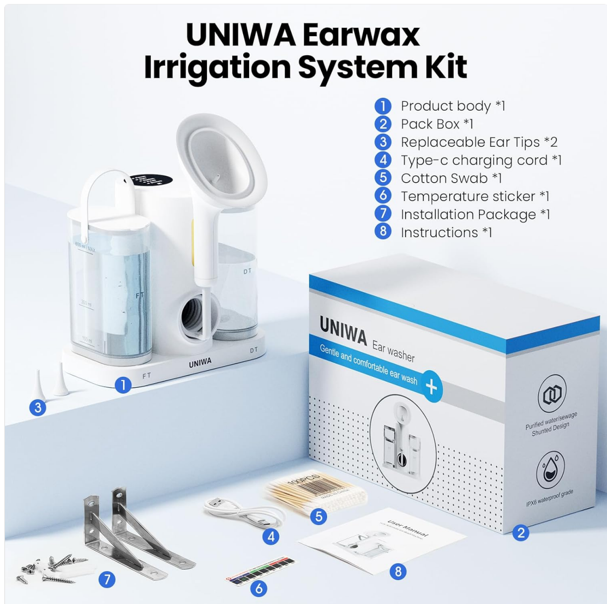
Image: Contents of the UNIWA Electric Ear Cleaner kit, including the main unit, ear tips, charging cable, cotton swabs, temperature sticker, and user manual.