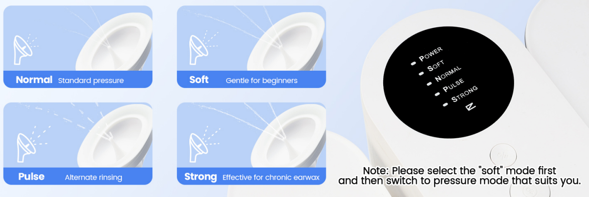
Image: Diagram illustrating the four cleaning pressure modes: Soft, Normal, Pulse, and Strong, with a note to start with 'Soft' mode.