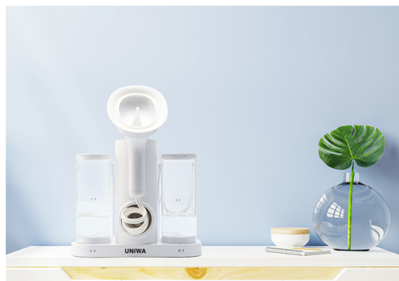
Image: Two storage options for the UNIWA Electric Ear Cleaner, showing it mounted on a wall and placed on a countertop.