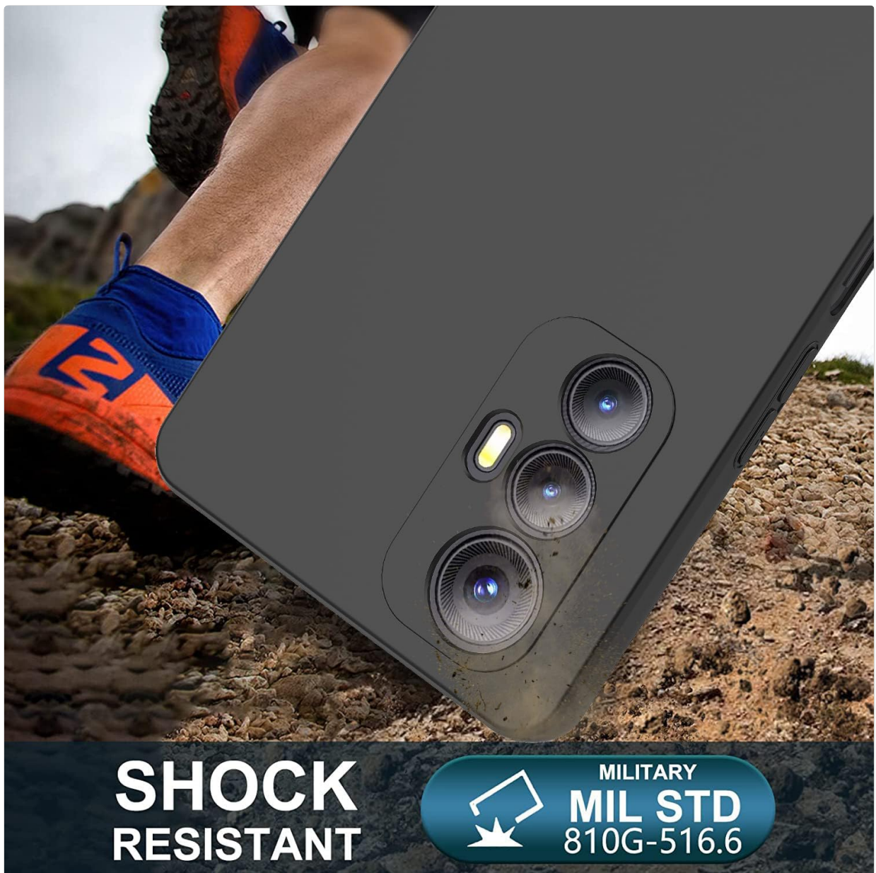
Image: The case protecting the phone on a rugged surface, illustrating its shock-resistant capabilities.