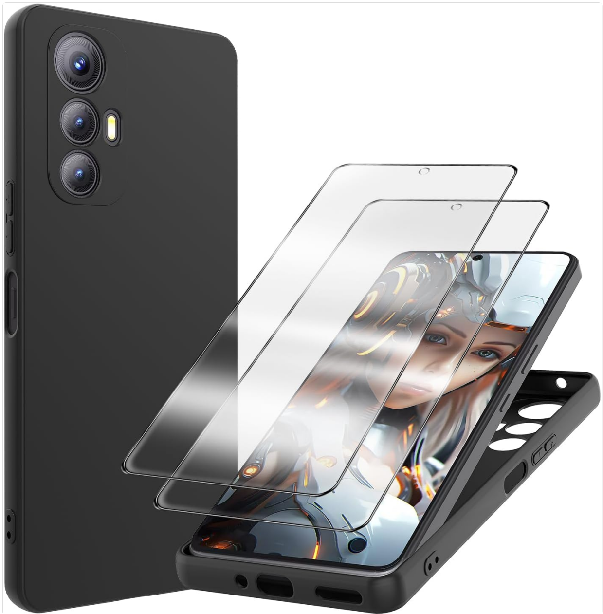
Image: The YJROP silicone case and tempered glass screen protector for Cubot Max 5, illustrating the components before assembly.