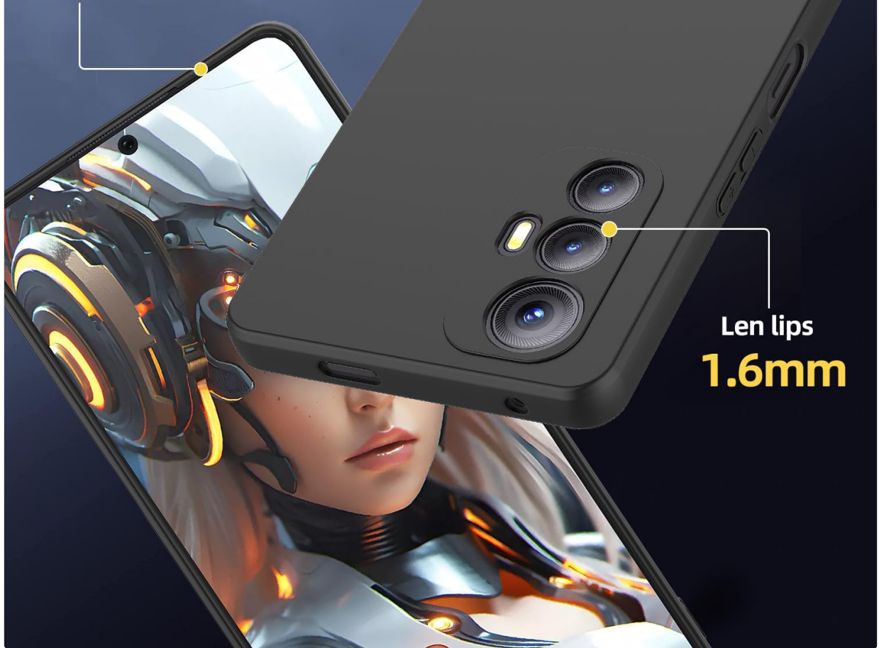
Image: Detail of the case design, highlighting the 0.3mm raised screen edge and 1.6mm raised camera lens lips for enhanced protection.