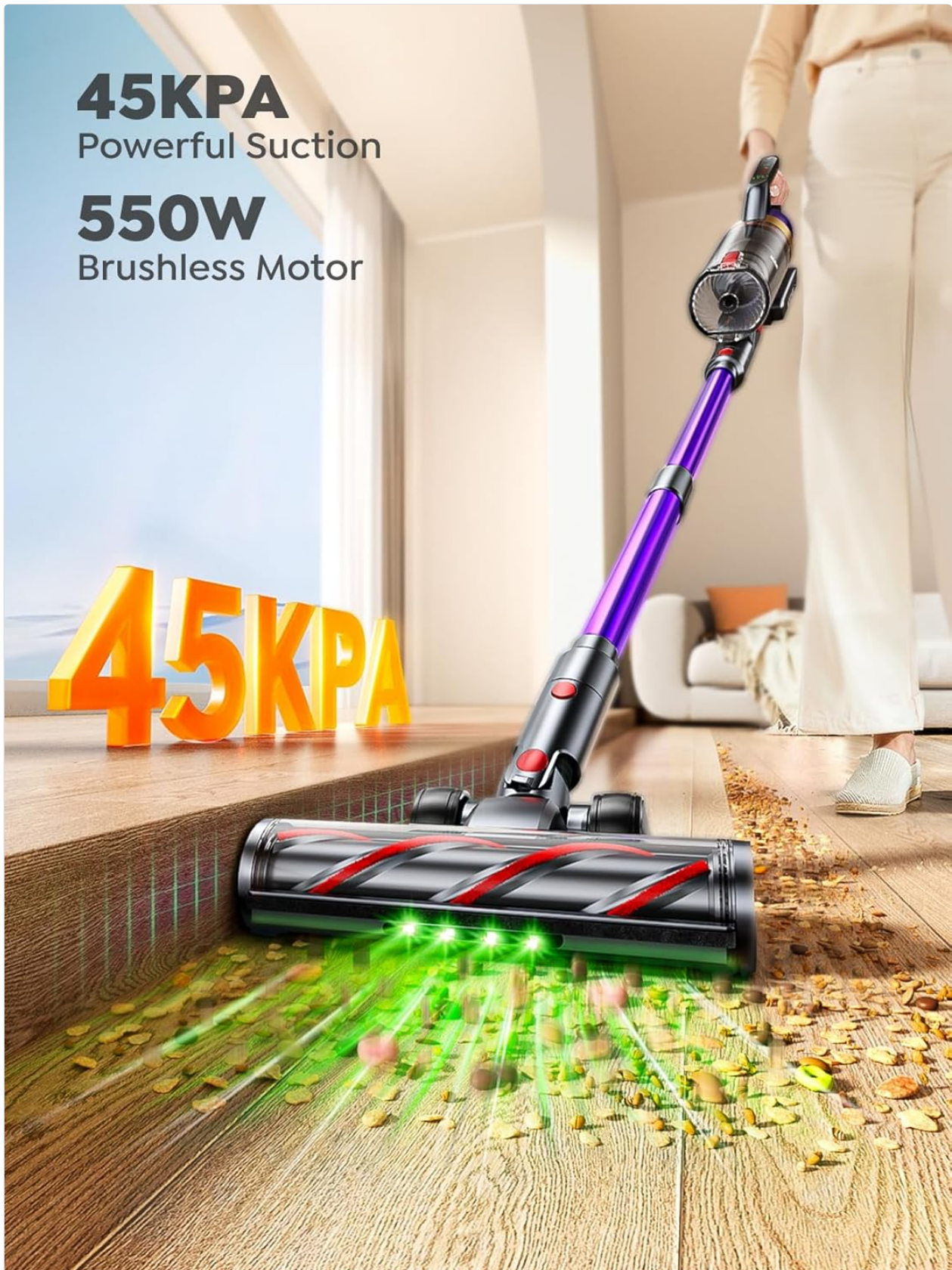
Figure 7.3: Powerful Suction for Various Debris