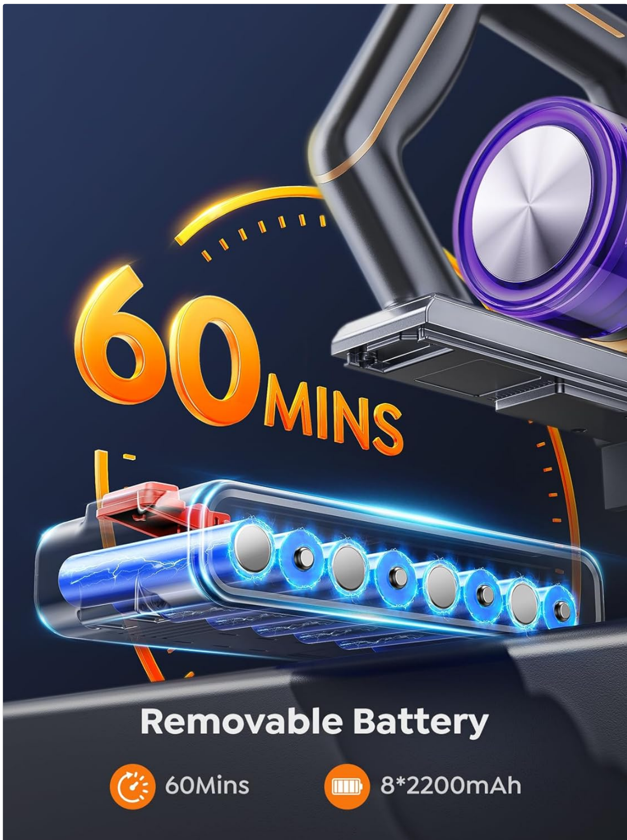
Figure 6.2: Detachable Battery for Extended Runtime