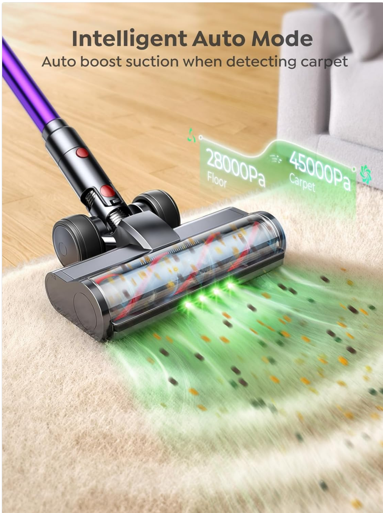
Figure 7.1: Intelligent Auto Mode in Action