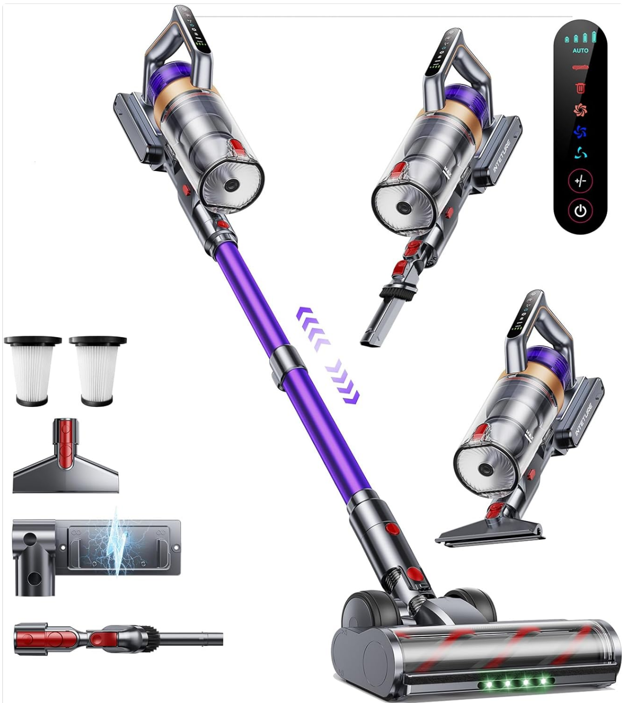
Figure 3.1: Included Components