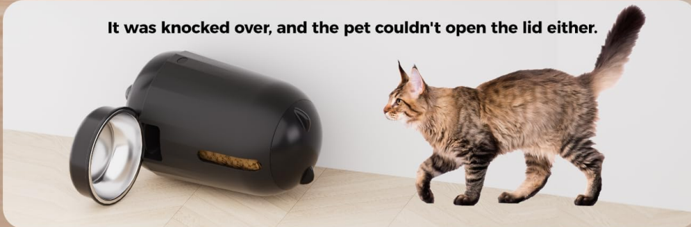
Image: A visual representation of the feeder's 3L capacity and its stability, even if accidentally knocked over by a pet.

It was knocked over, and the pet couldn't open the lid either.