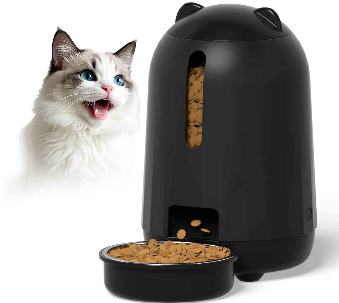
Image: The PAPIFEED Automatic Cat Feeder in black, dispensing kibble into a bowl, with a cat observing from the side.