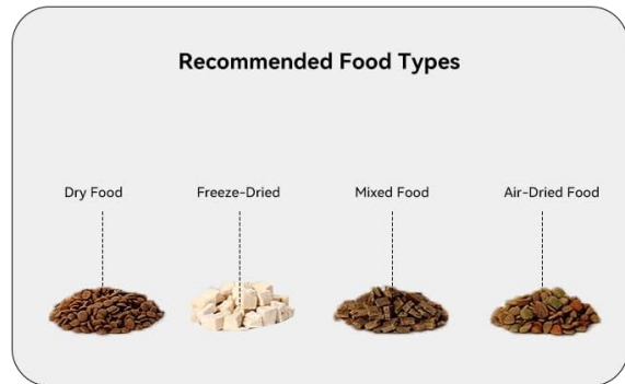
Image: A graphic detailing the feeder's anti-clog mechanism and visual examples of suitable kibble sizes and food textures.