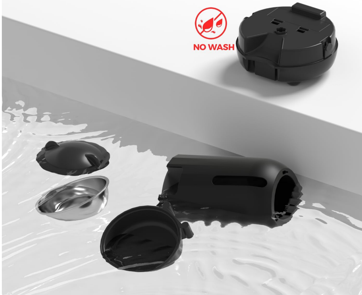
Image: The feeder's detachable parts, including the food bin and bowl, shown being cleaned under running water.