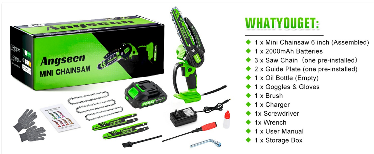
Figure 3.1: Contents of the Angseen Mini Chainsaw package.

The image above displays the complete set of accessories provided with your mini chainsaw, including the tool itself, batteries, chains, guide plates, charger, safety gear, and maintenance tools.