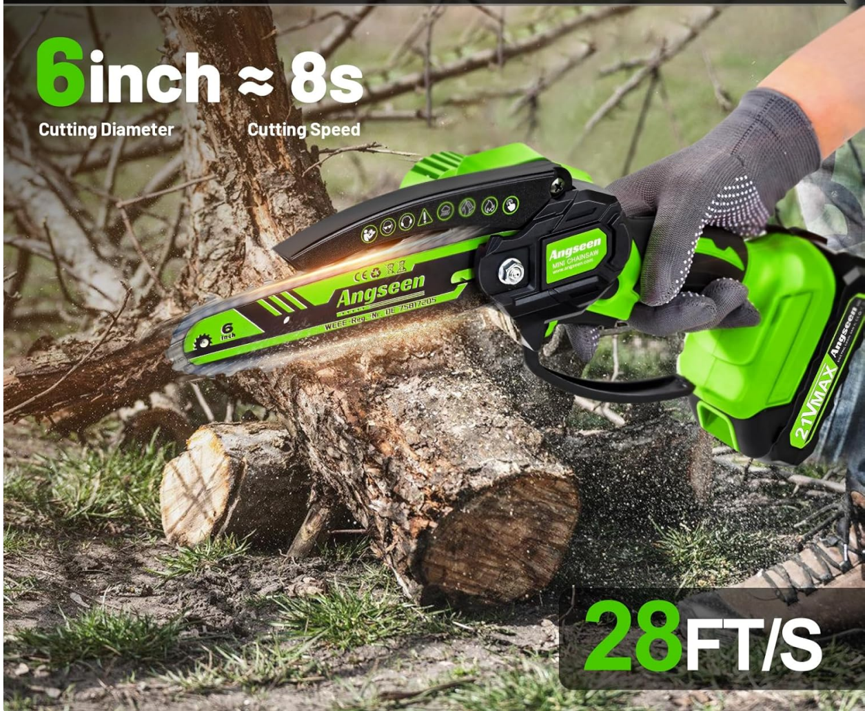
Figure 5.1: The Angseen mini chainsaw demonstrating high-efficiency cutting on a log.

This image shows the mini chainsaw in action, highlighting its ability to cut through wood quickly and efficiently, with a cutting diameter of 6 inches in approximately 8 seconds.