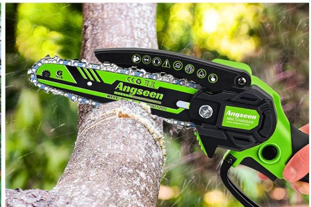
Figure 5.2: The lightweight design of the mini chainsaw enables comfortable one-handed operation for pruning.

This image illustrates the chainsaw's lightweight design, emphasizing its suitability for one-handed use in different pruning scenarios, making it user-friendly for various individuals.