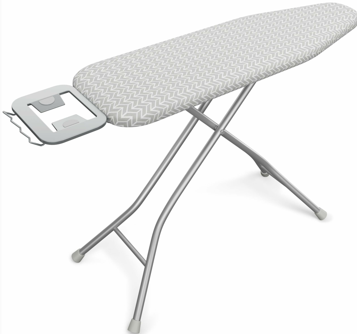
Image: The Yaheetech Foldable Ironing Board in a laundry room setting, showcasing its full size and integrated iron rest.