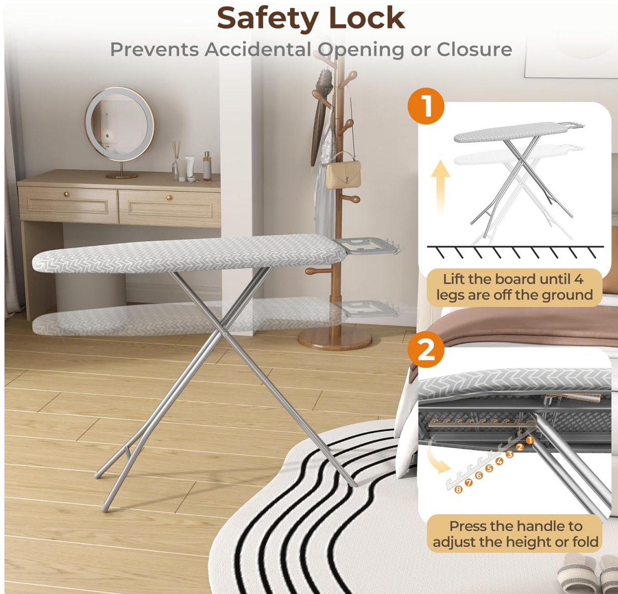
Image: A visual guide demonstrating how to lift the board and press the handle to adjust its height or fold it for storage, highlighting the safety lock feature.