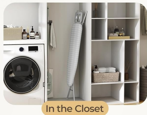
Image: Illustrations demonstrating the compact folding size of the ironing board, showing it stored upright against a wall and neatly tucked away inside a closet.