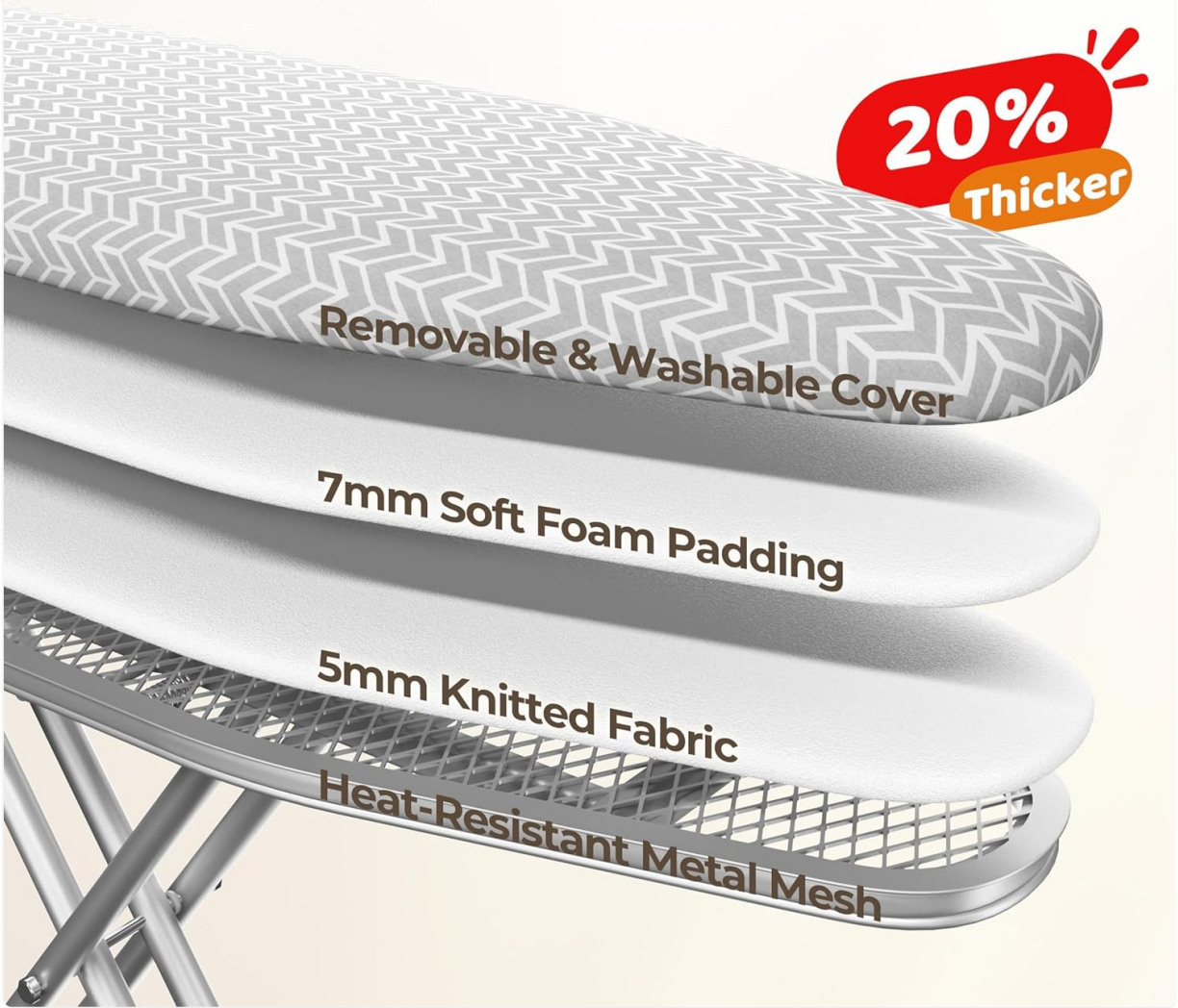
Image: A cross-section diagram detailing the four layers of the ironing board's heat-resistant structure: a removable and washable cover, 7mm soft foam padding, 5mm knitted fabric, and a heat-resistant metal mesh base.