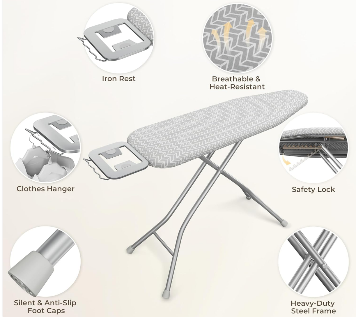
Image: Close-up views of various product details, including the iron rest, breathable and heat-resistant cover, safety lock, silent and anti-slip foot caps, and heavy-duty steel frame.