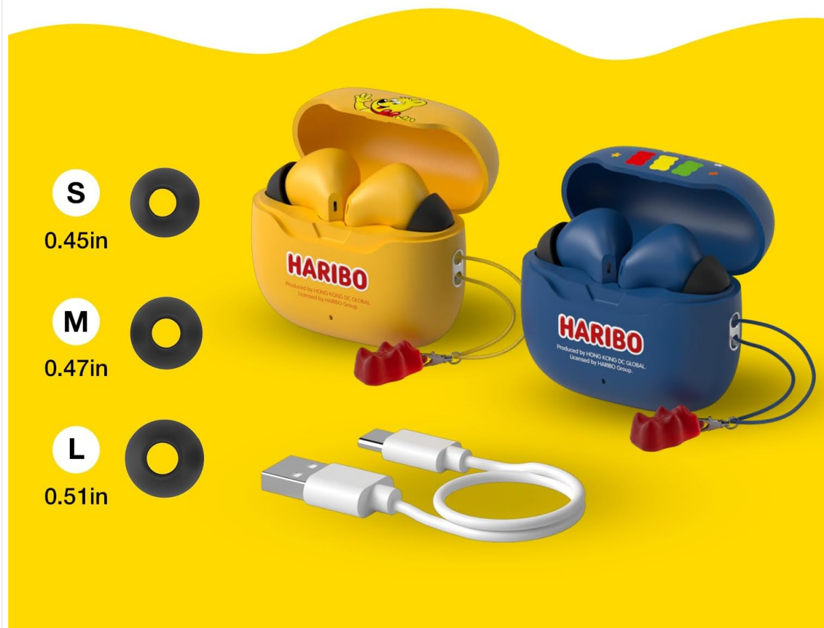
Figure 5: Included eartips for a comfortable fit.