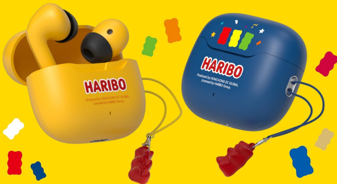
Figure 2: Key features of the DCHK Haribo Wireless Earbuds.