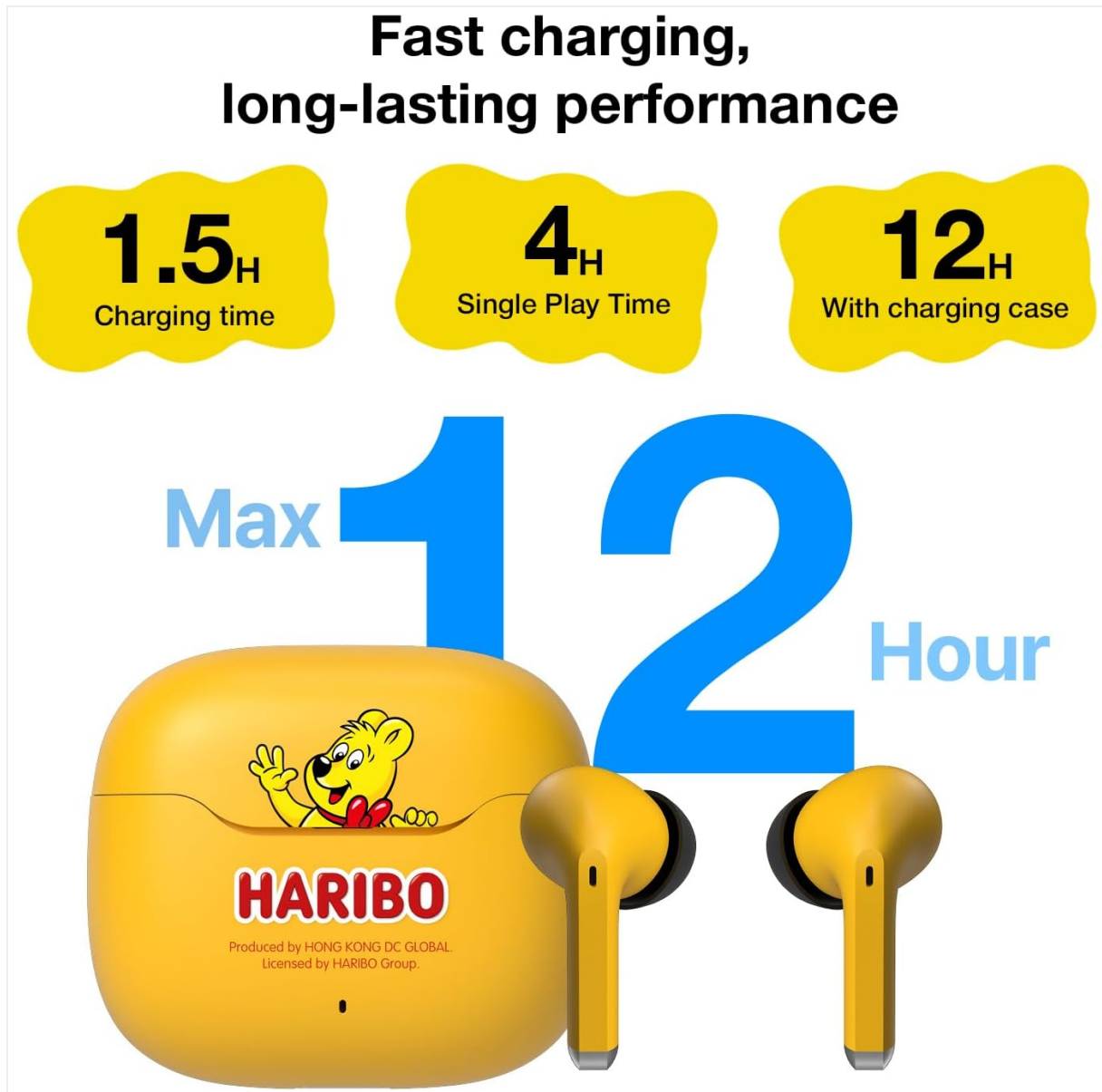
Figure 3: Charging and battery life overview.