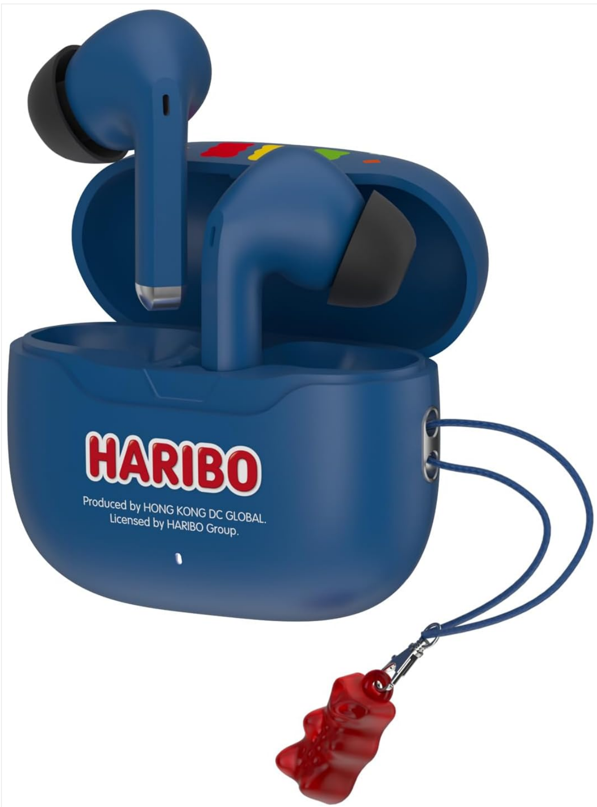
Figure 1: DCHK Haribo Wireless Earbuds and Charging Case.