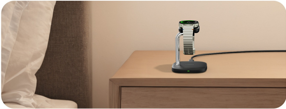
Image: Detailed compatibility list for the SwanScout 505S Charger Stand.