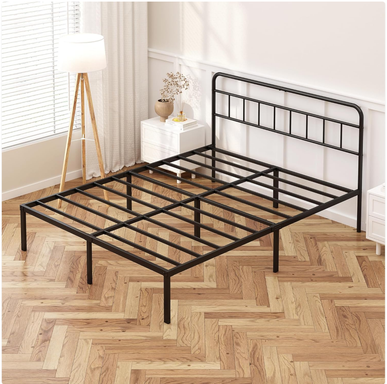
Image: The Kujielan King Size Metal Bed Frame without a mattress, clearly showing the robust metal slatted base.

The under-bed clearance provides convenient storage space. Utilize storage bins or containers to keep items organized beneath the bed.