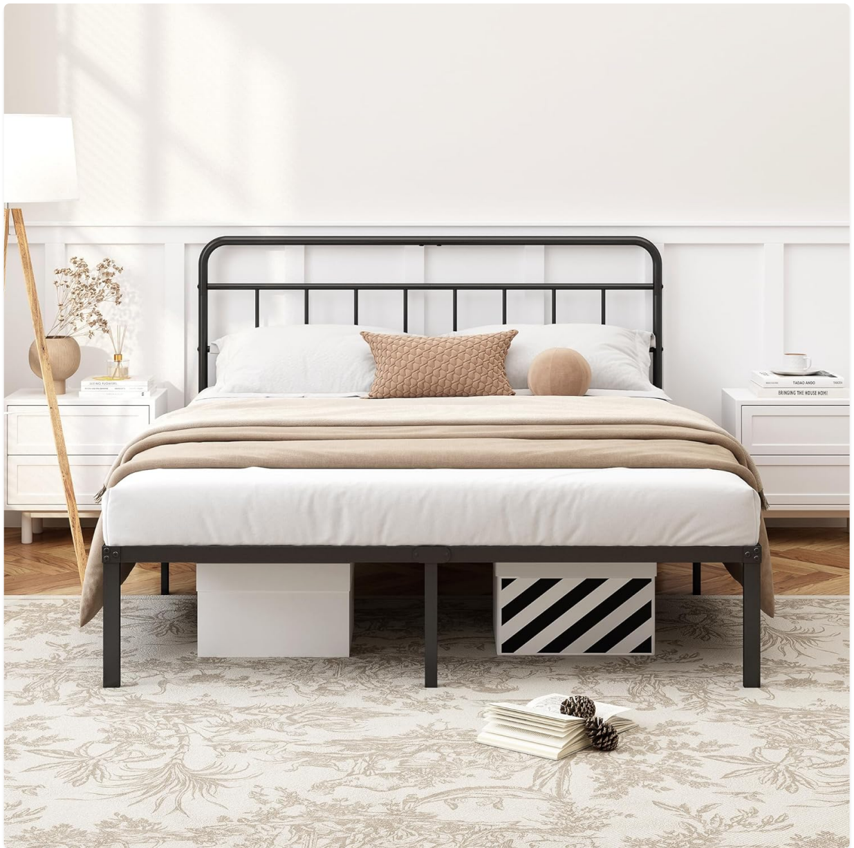
Image: Kujielan King Size Metal Bed Frame with mattress and bedding, showcasing its minimalist design in a bedroom.