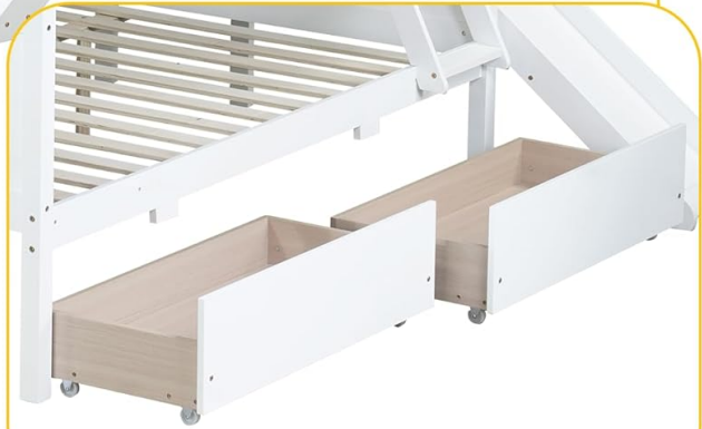
Image: The bunk bed featuring two pull-out storage drawers located beneath the lower bed, offering convenient space for organization.