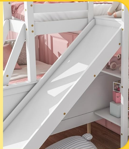
Image: Detail view of the three-step ladder and the integrated slide, designed for safe access and fun.

Making it easier to climb up and slide from the upper bed platform.