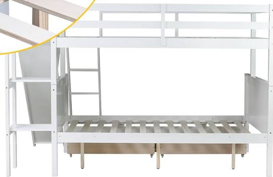
Image: Safety features including weight capacity (Upper: 250 lbs, Lower: 400 lbs) and the robust slat system for both bunks.

The high guard rails surrounding the top bed will provide further protection along with the low platform with panelled headboard and footboard.