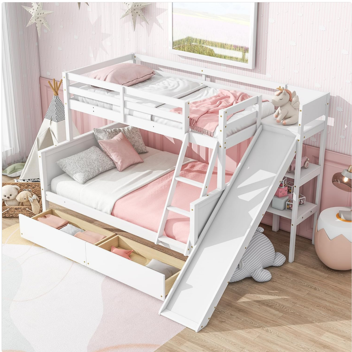
Image: The Polibi Twin Over Full Bunk Bed, fully assembled, showcasing its design with a slide, ladder, and integrated storage drawers.