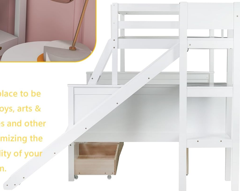
Image: Detail of the integrated storage shelves, providing accessible space for decorative items or essentials.

It is the perfect place to be decorated with toys, arts & crafts, bookshelves and other accessories, maximizing the space and flexibility of your bedroom.