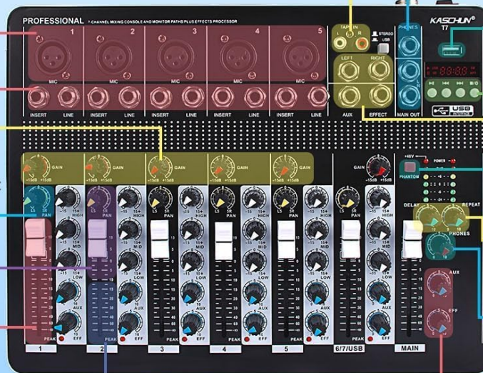
Image: A detailed labeled diagram of the Kaschun T7 mixer's controls and ports.

[AUX/EFFECT CONTROL] Adjust output level of the AUX bus from AUX jack Adjust effect level which is processed by built-in effect processor to main output.