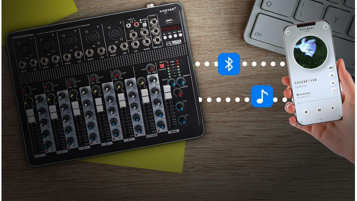
Image: The Kaschun T7 mixer on a desk, emphasizing its enhanced Bluetooth capabilities for wireless audio streaming from various devices.

Support for laptops/tablet/phone with BT