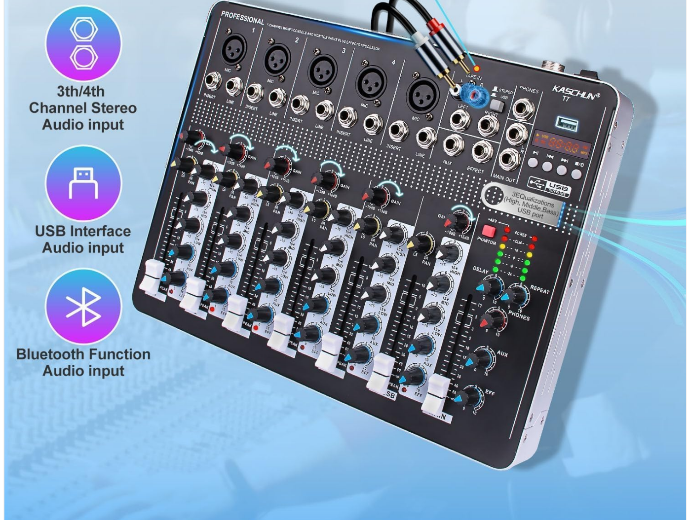
Image: The Kaschun T7 mixer demonstrating its function as a music player, with visual cues for USB and Bluetooth audio input.

Unbalanced 1/4 inch jacks of 3/4 channels can be connected to Phone/PC with audio cables As Mp3 Player.