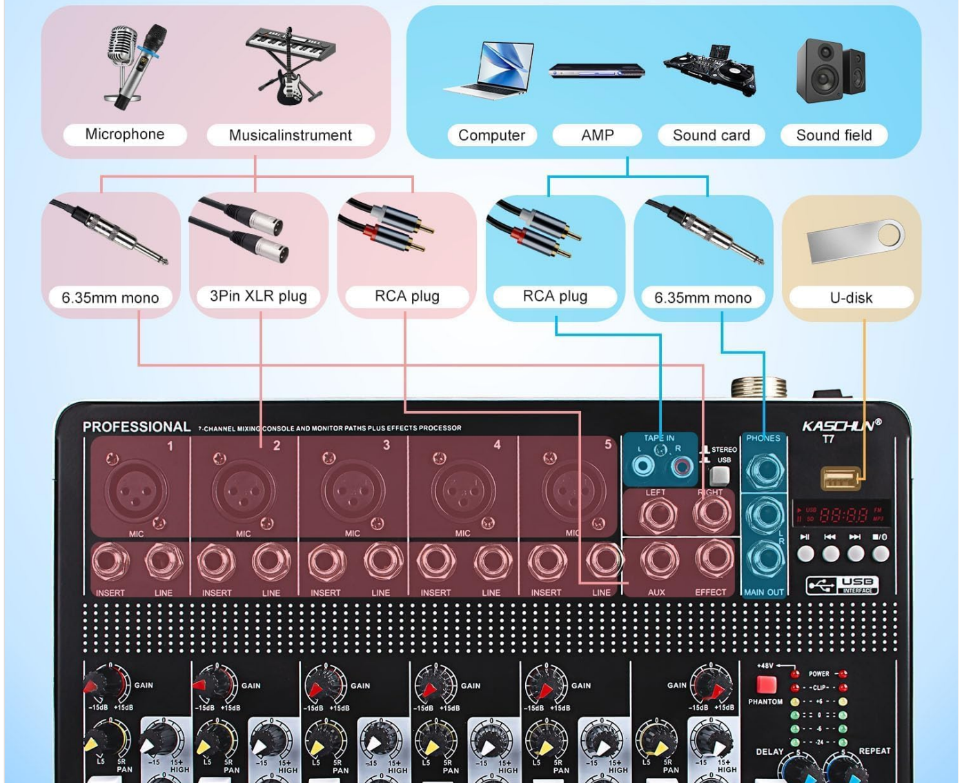
Image: Visual representation of multiple device connections to the Kaschun T7 mixer, illustrating microphone, instrument, computer, and sound card inputs.