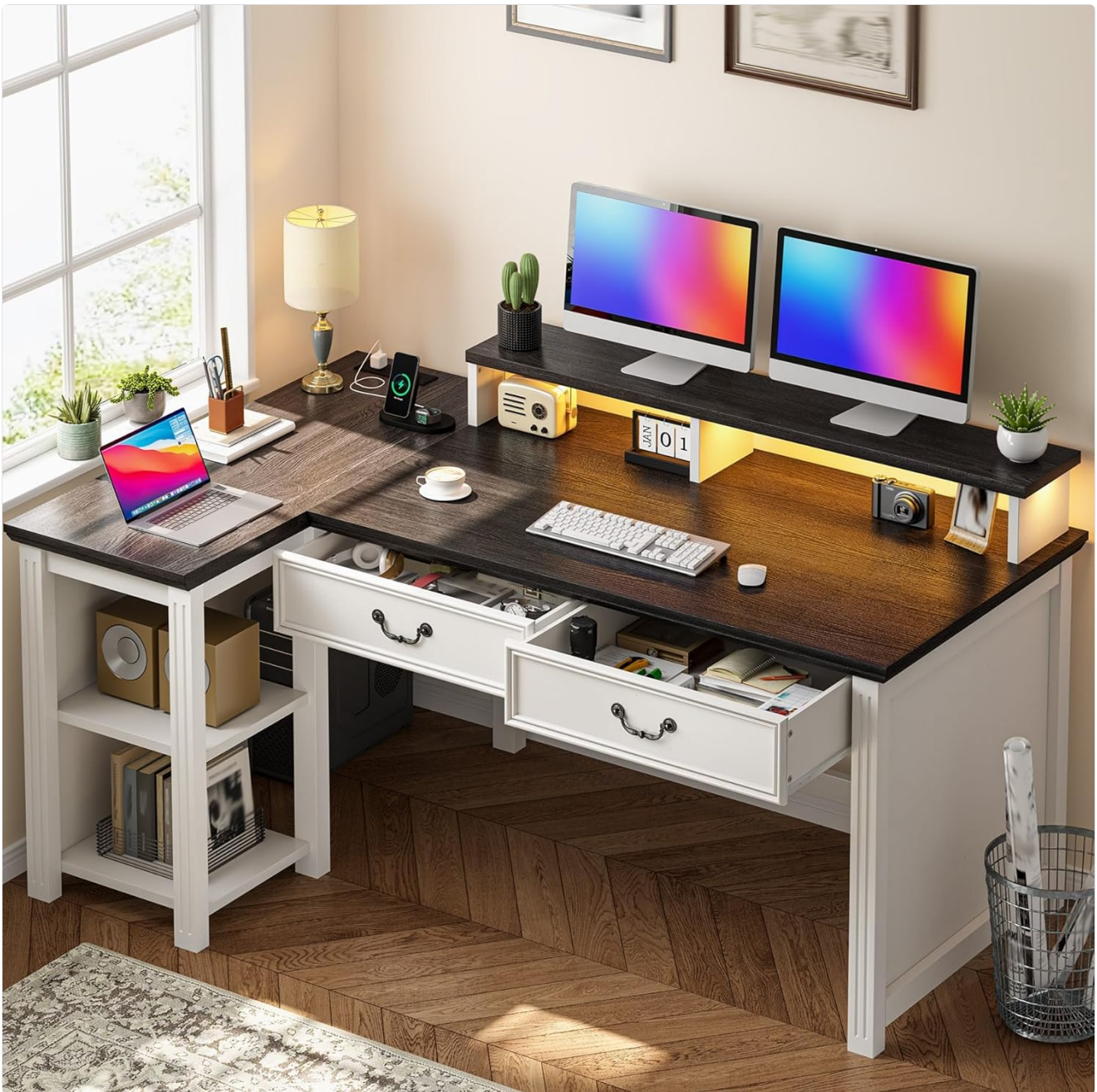
The EnHomee 55" L Shaped Farmhouse Office Desk, showcasing its spacious design, integrated monitor stand, and ample storage. This desk is designed to enhance productivity and organization in any home office or bedroom setting.