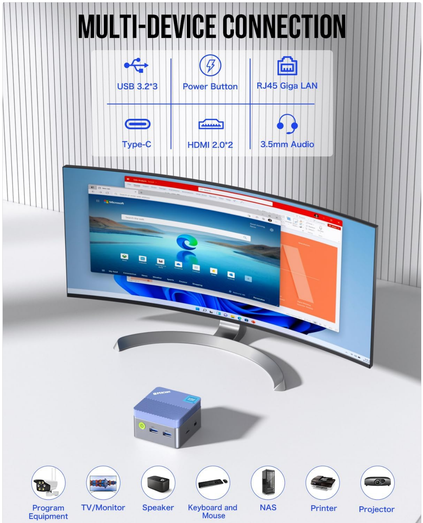
Image: The GMKtec Mini PC G5 demonstrating dual HDMI 4K display capability, connected to two monitors showing different content.

The Mini PC G5 supports connecting two displays simultaneously for an extended workspace or mirrored display. Simply connect two monitors to the two HDMI ports on the device. Windows 11 will automatically detect the displays, and you can configure their arrangement and resolution through the display settings.