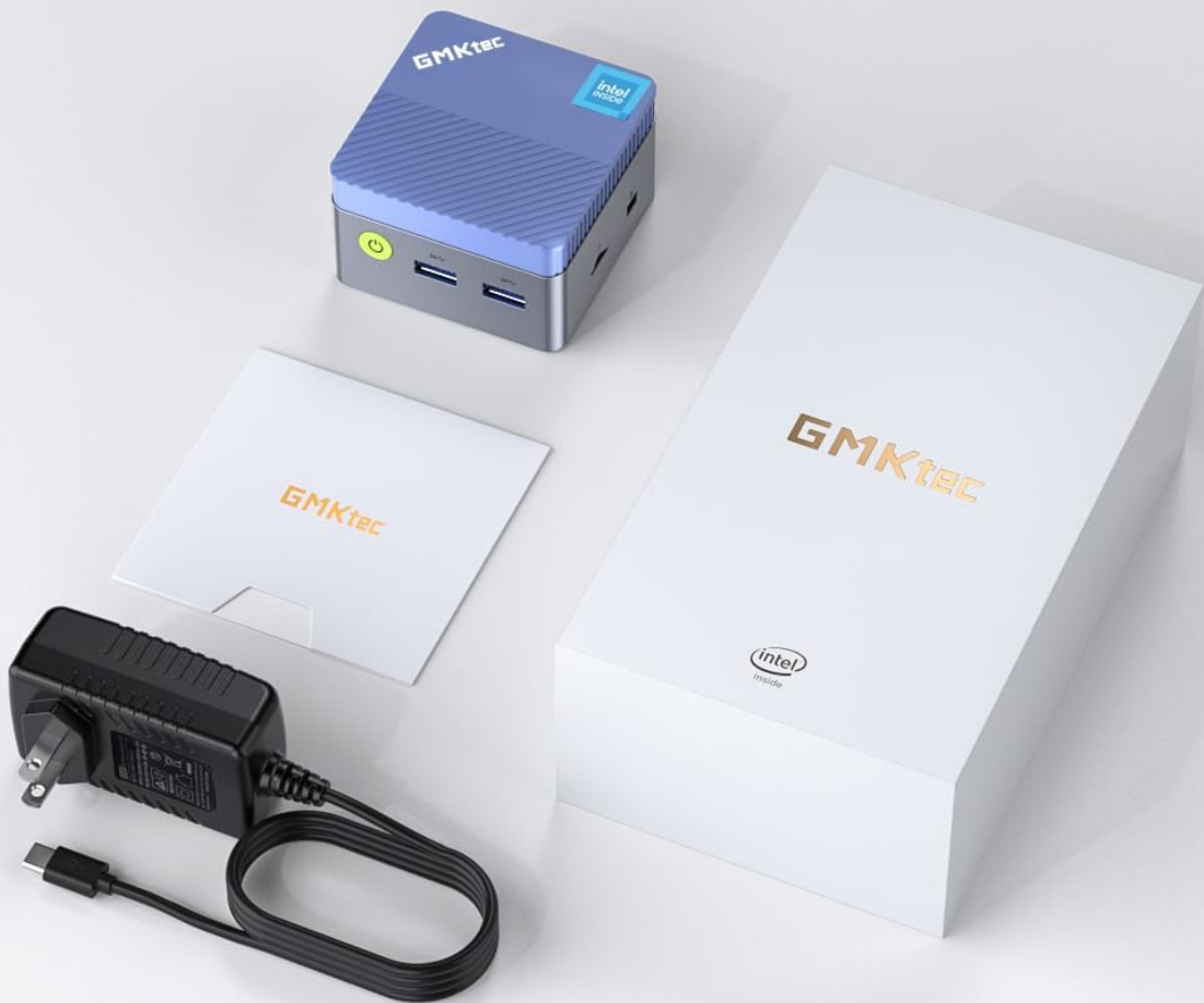
Image: Contents of the GMKtec Mini PC G5 retail box, showing the mini PC, power adapter, HDMI cable, and user manual.