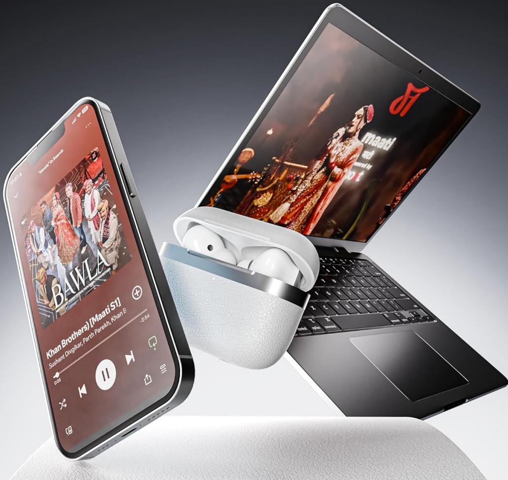
Image: The boAt Airdopes 111v2 charging case and earbuds positioned between a smartphone and a laptop, visually representing the multipoint connectivity feature that allows connection and switching between two devices with ease.