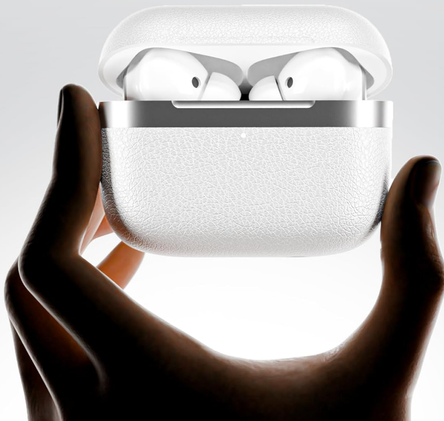
Image: A hand holding the boAt Airdopes 111v2 charging case, illustrating the 50 hours of total playback time and the ASAP Charge feature (10 minutes charge for 120 minutes playtime).

10 Mins ASAP™ Charge = 120 Mins Playtime