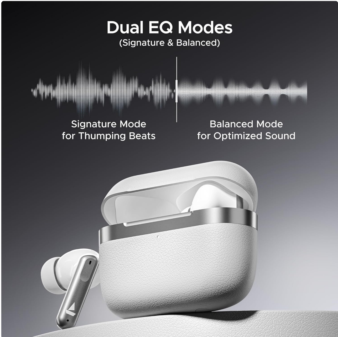
Image: A visual representation of the Dual EQ Modes, contrasting the sound waves for "Signature Mode for Thumping Beats" and "Balanced Mode for Optimized Sound," with the Airdopes 111v2 case and earbuds in the foreground.

Refer to the full user manual or the boAt Hearables App for instructions on how to switch between these modes.