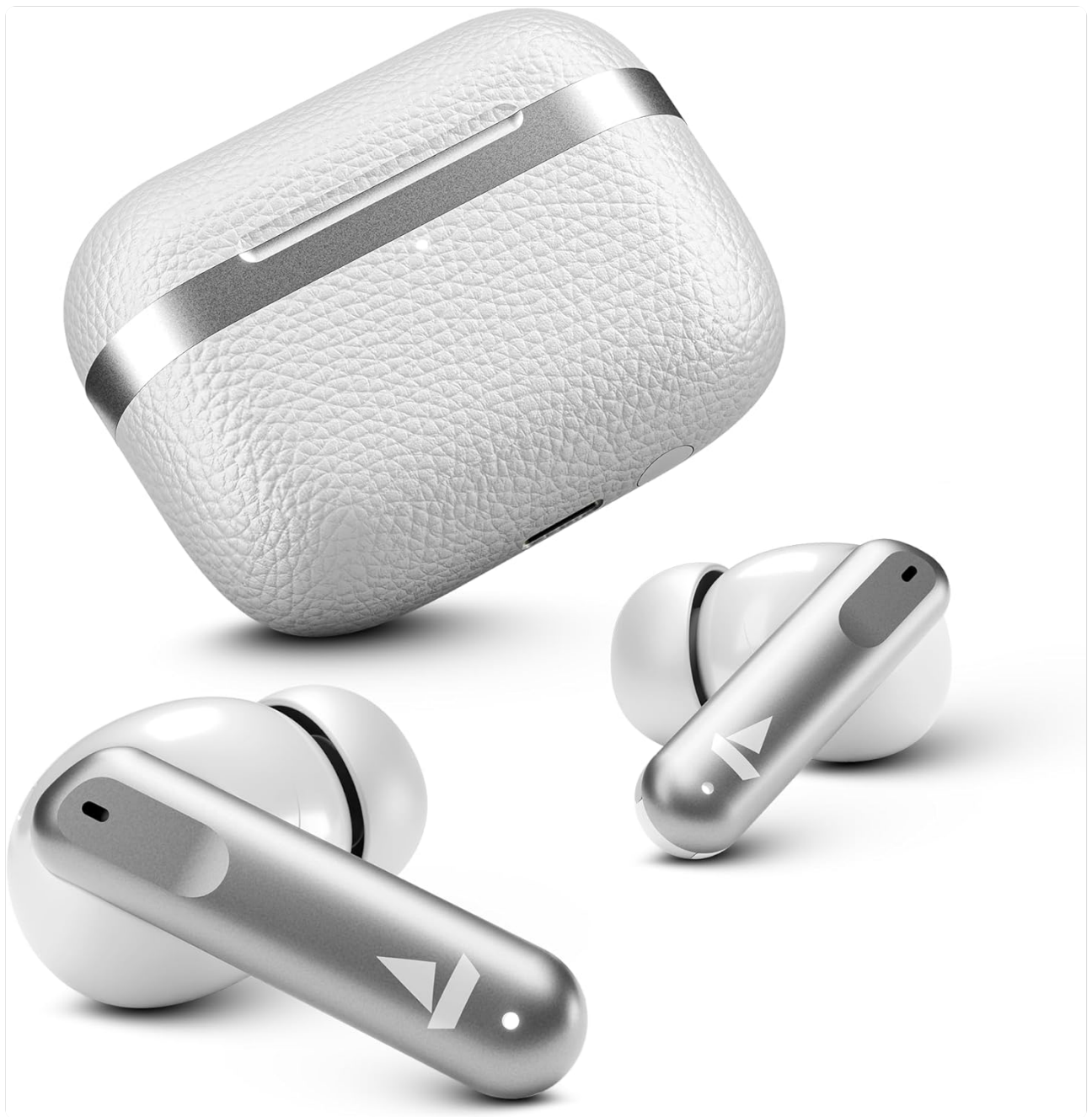
Image: The boAt Airdopes 111v2 TWS Earbuds and their charging case, showcasing the Ivory White color and premium leather finish.