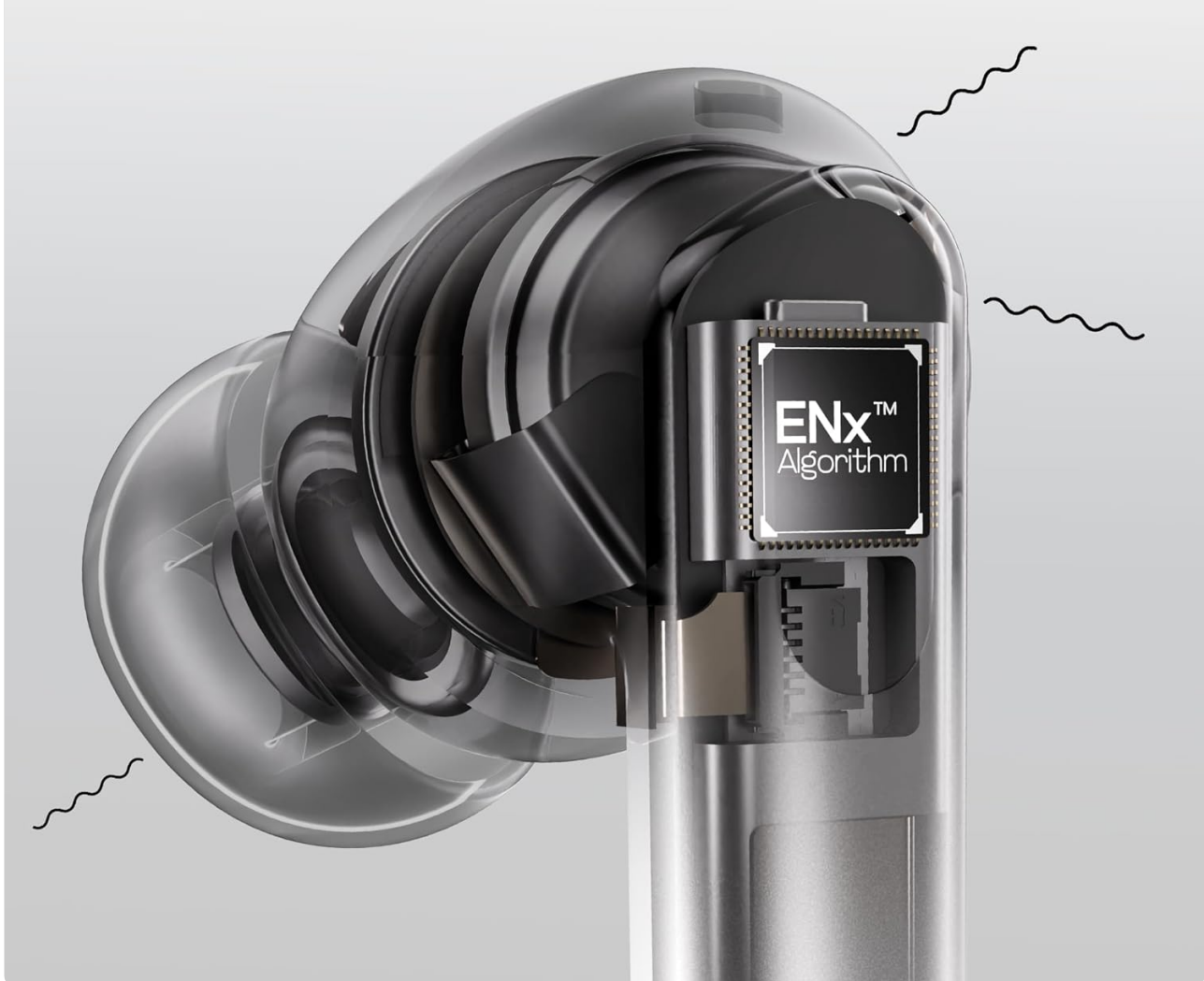
Image: A cutaway diagram of an earbud highlighting the "4 Mics with ENx™ Technology" and an "ENx™ Algorithm" chip, indicating its function to eliminate background noise for crystal-clear conversations.

Eliminates Background Noise for Crystal-Clear Conversations