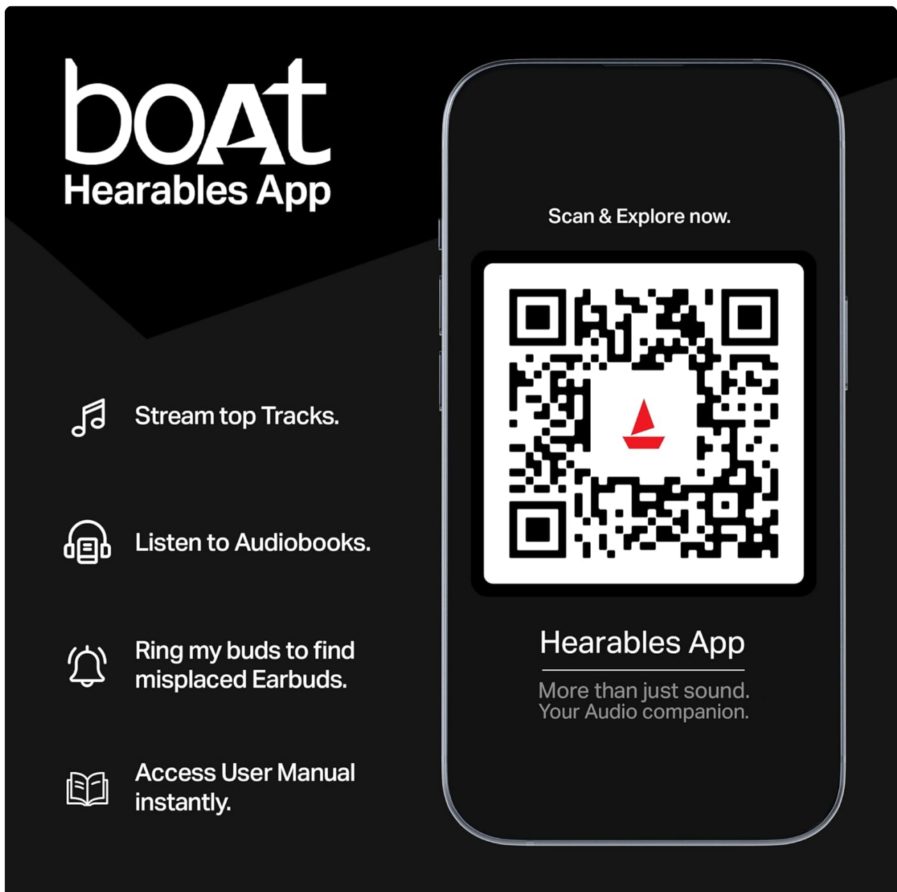
Image: A smartphone screen displaying the boAt Hearables App interface, with a QR code for scanning and exploring features

For warranty information and customer support, please refer to the official boAt website or the boAt Hearables App. The app provides instant access to the user manual, troubleshooting guides, and allows you to manage your earbuds.