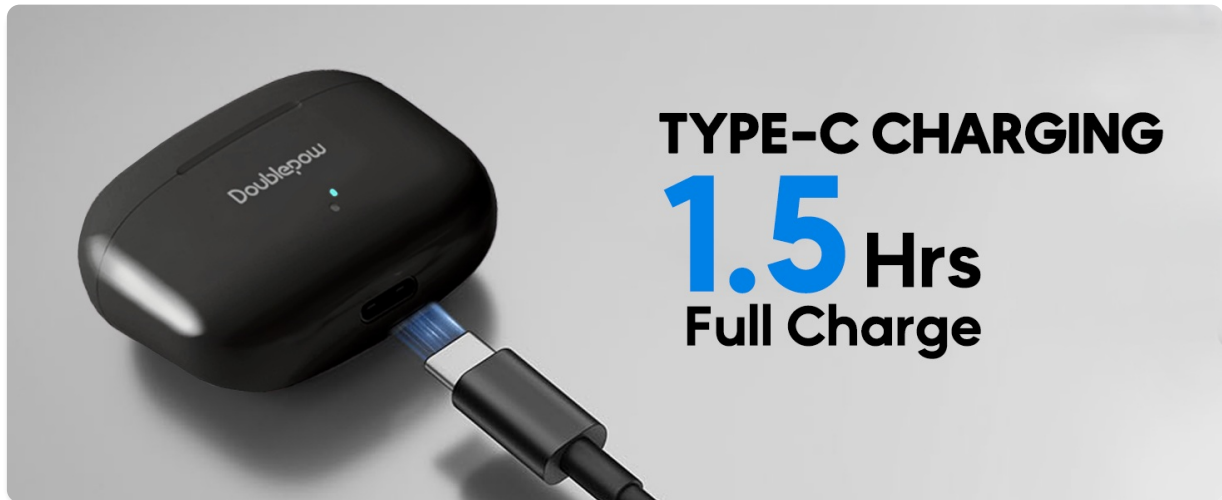
Image: The charging case with a USB-C cable connected, illustrating the Type-C charging feature.