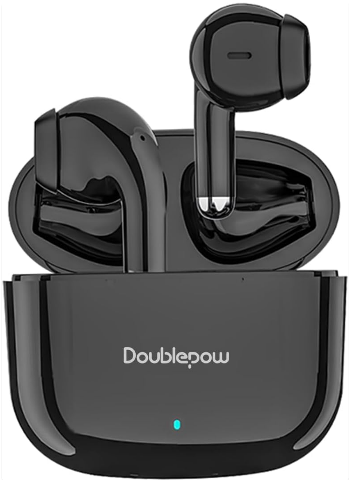
Image: Doublepow LP40 Pro Wireless Earbuds and their charging case.