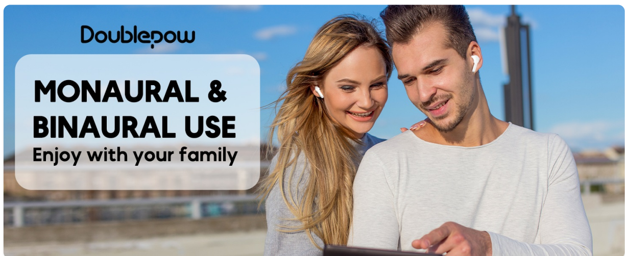
Image: Graphic demonstrating the flexibility of using the earbuds either individually (monaurally) or as a pair (binaurally).

The LP40 Pro earbuds support both monaural (single earbud) and binaural (both earbuds) use. You can use one earbud independently while the other is in the charging case, or use both for a stereo experience.