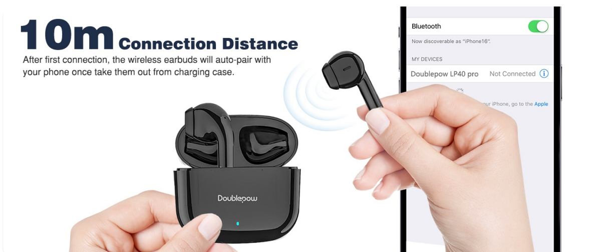
Image: Visual representation of the earbuds automatically pairing with a smartphone, highlighting the 10-meter connection distance.

After first connection, the wireless earbuds will auto-pair with your phone once take them out from charging case.