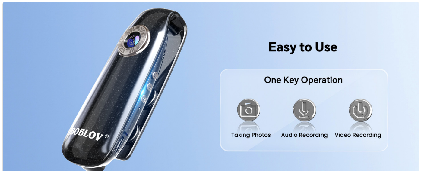
Image: A close-up of the camera highlighting the three main function buttons: Photo, Audio Recording, and Video Recording.

The BOBLOV 007 Mini Body Camera features a simple three-button interface for various functions.