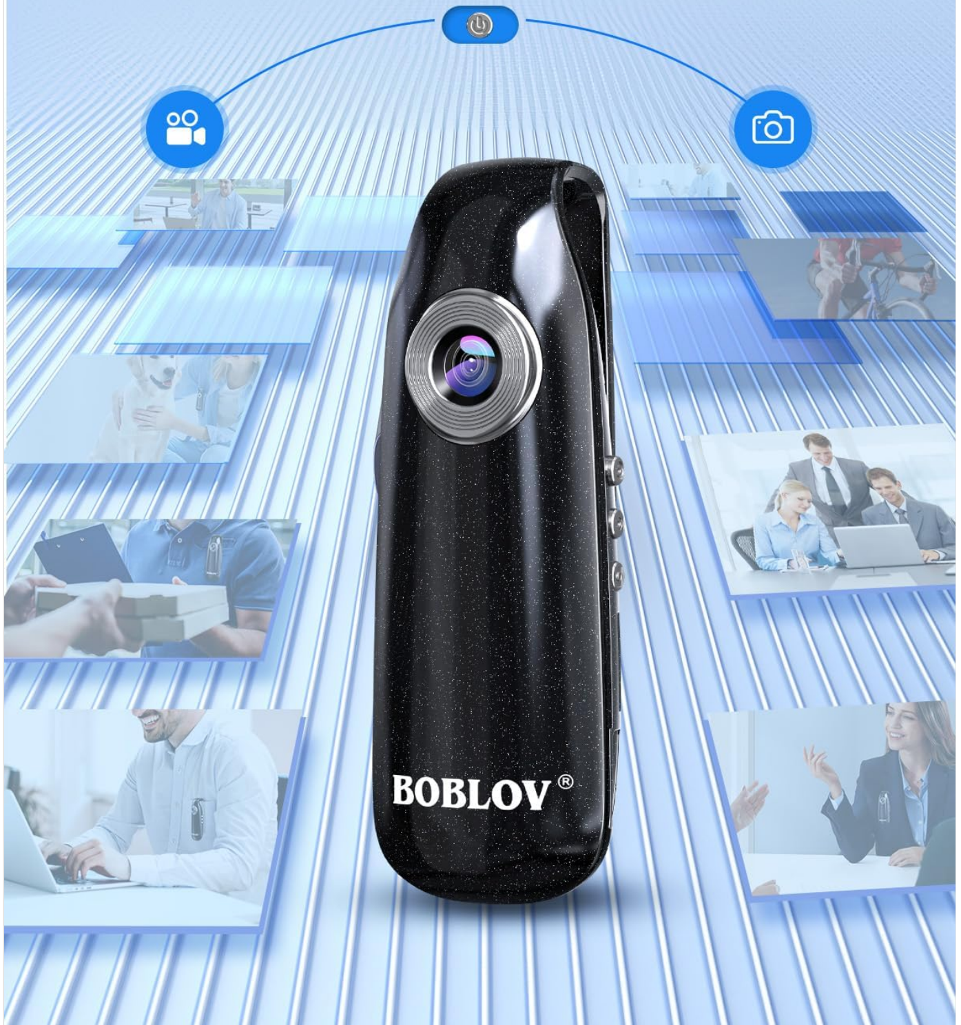
Image: Visual representation of the 1080P loop recording feature, showing the camera continuously capturing footage.