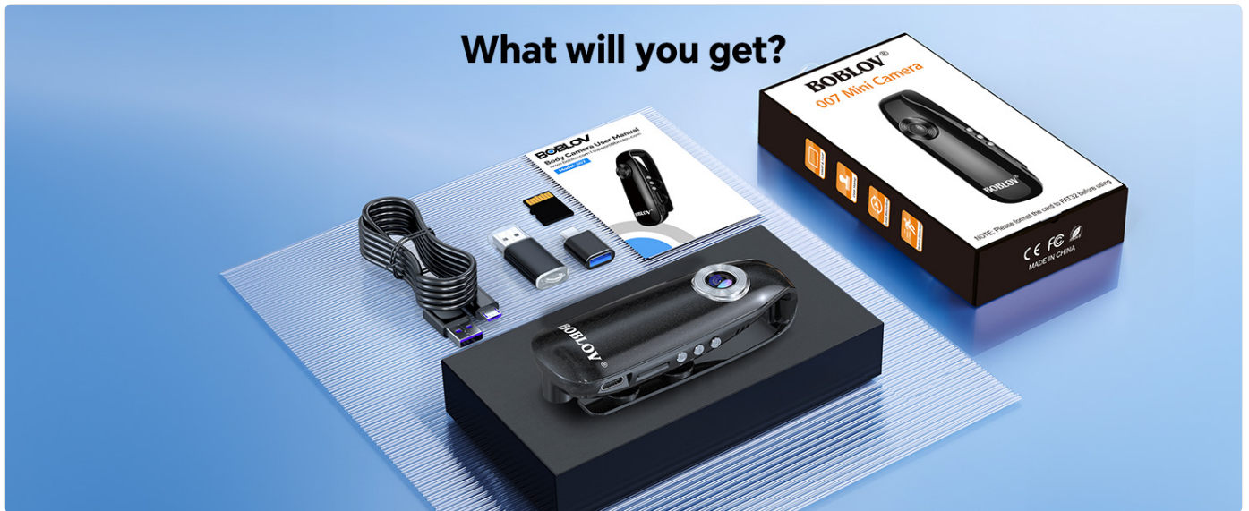
Image: A visual representation of the package contents, including the camera, USB cable, card reader, and user manual.