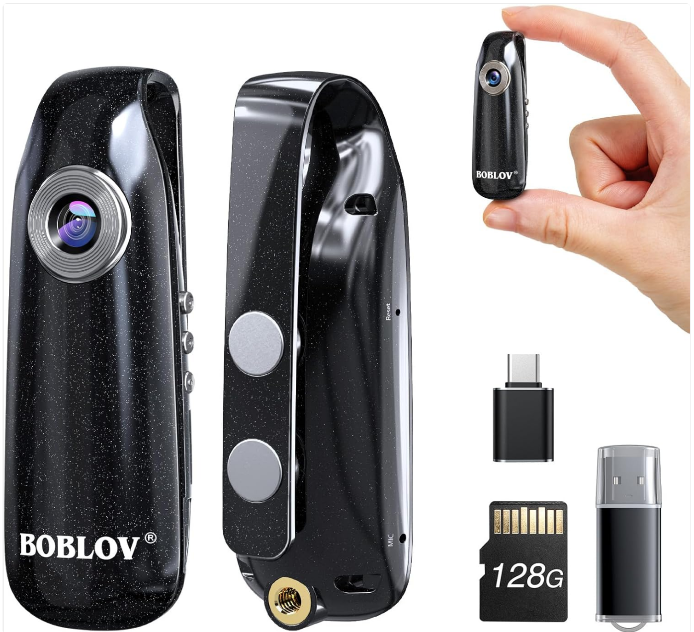
Image: The BOBLOV 007 Mini Body Camera shown with its compact design and various accessories like the USB cable, card reader, and TF card.