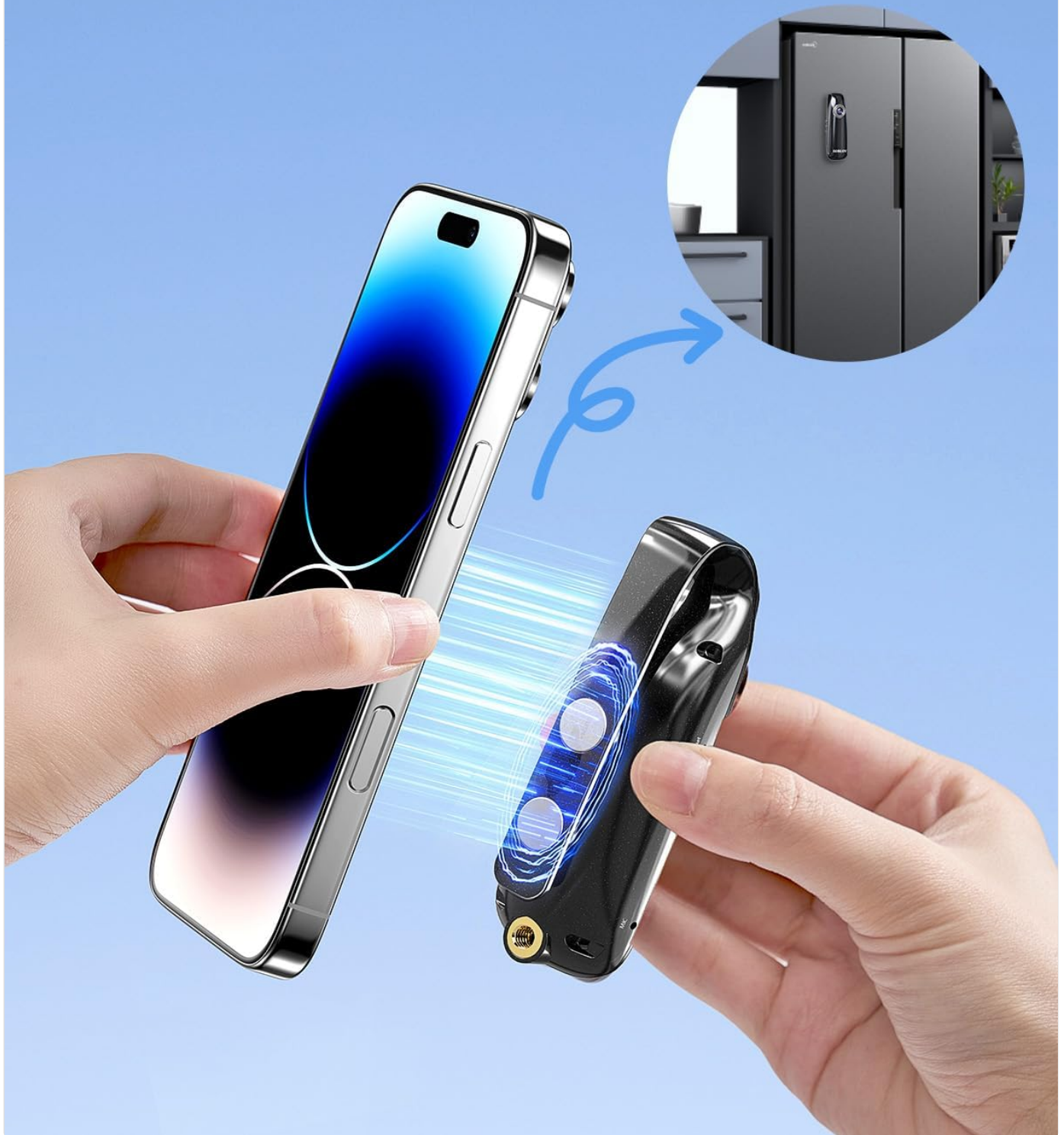
Image: Illustrates the strong magnetic back clip, showing the camera adhering to a phone and a refrigerator.