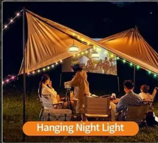
Hanging Night Light