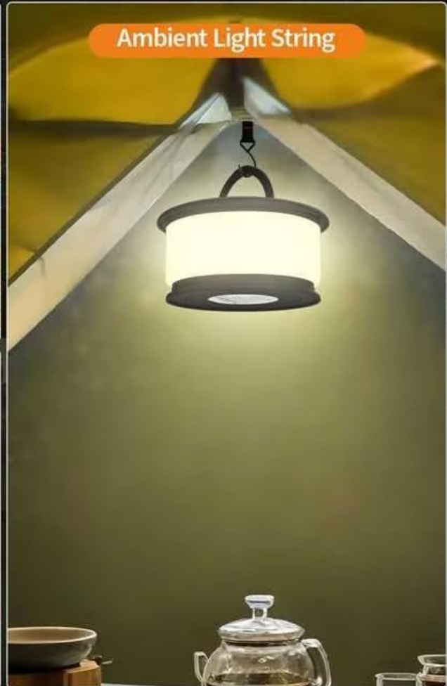
Ambient Light String