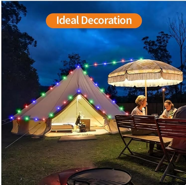
The TOHETO JSK-L26 can be used as a camping lantern, for lighting hammocks, as a portable light carried on a backpack, or as general decoration.