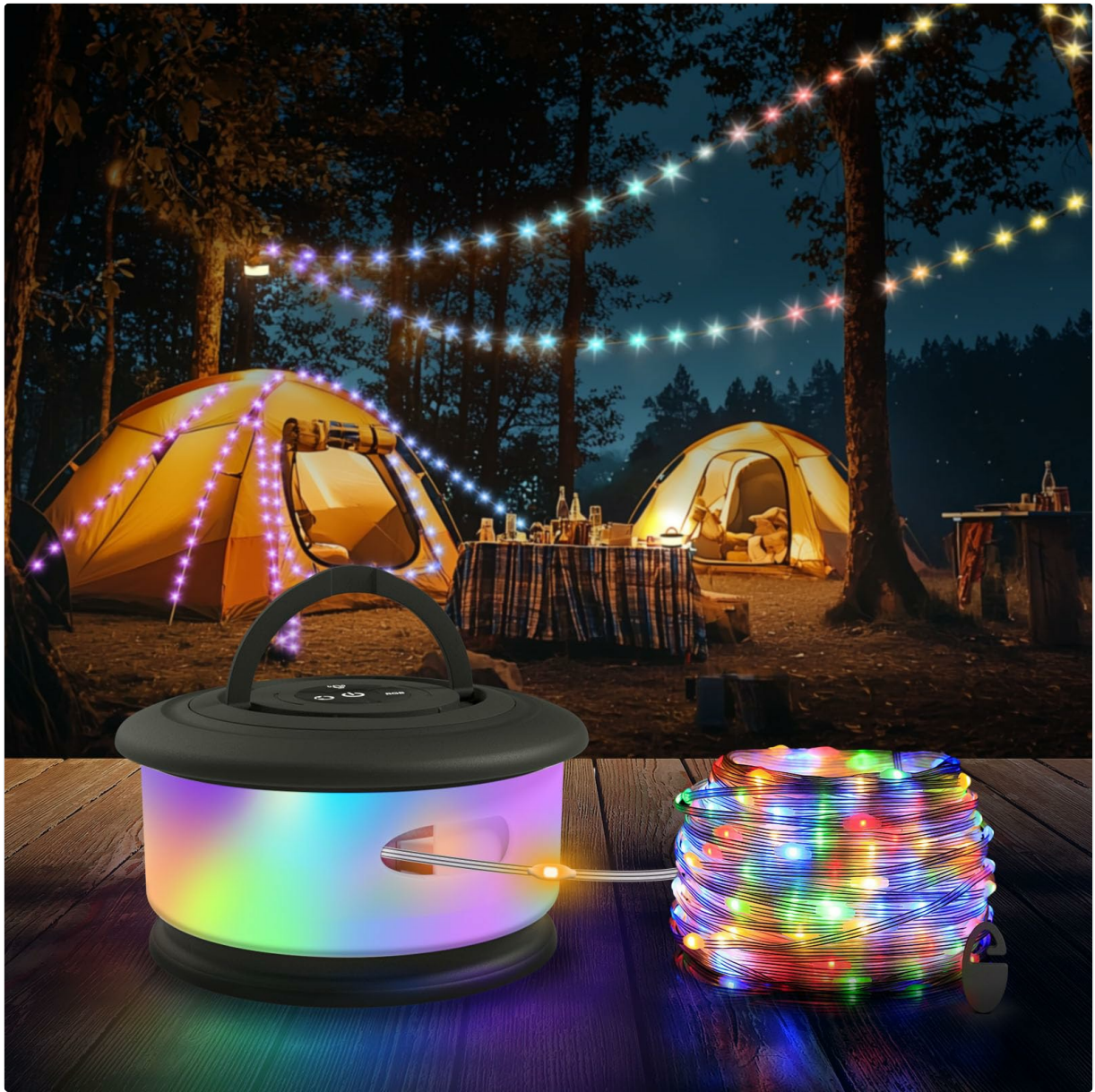
The TOHETO JSK-L26 Camping String Lights and Lantern in its compact form.