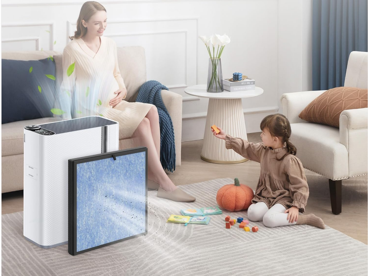
Image: A visual reminder that replacing the filter every 4-6 months contributes to better air quality and a healthier living environment.

It is recommended to replace it every 4-6 months for optimal performance