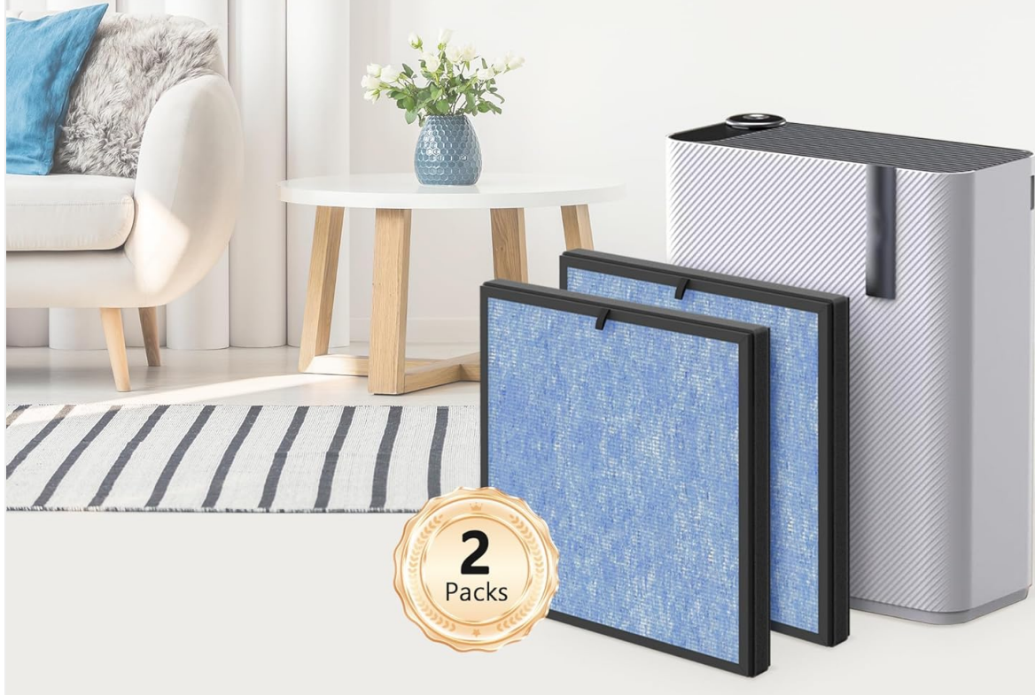
Image: The Harebery KJ01 replacement filters shown alongside the Dhyala KJ01 air purifier, indicating compatibility.