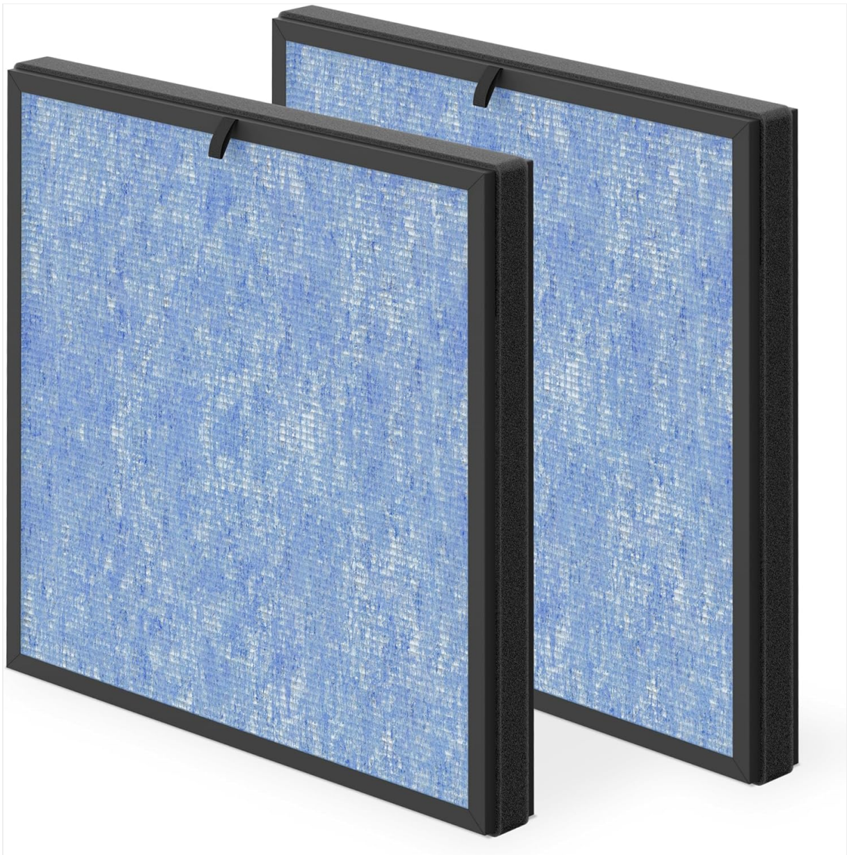
Image: A pair of Harebery KJ01 replacement filters, illustrating the product ready for installation into the air purifier.