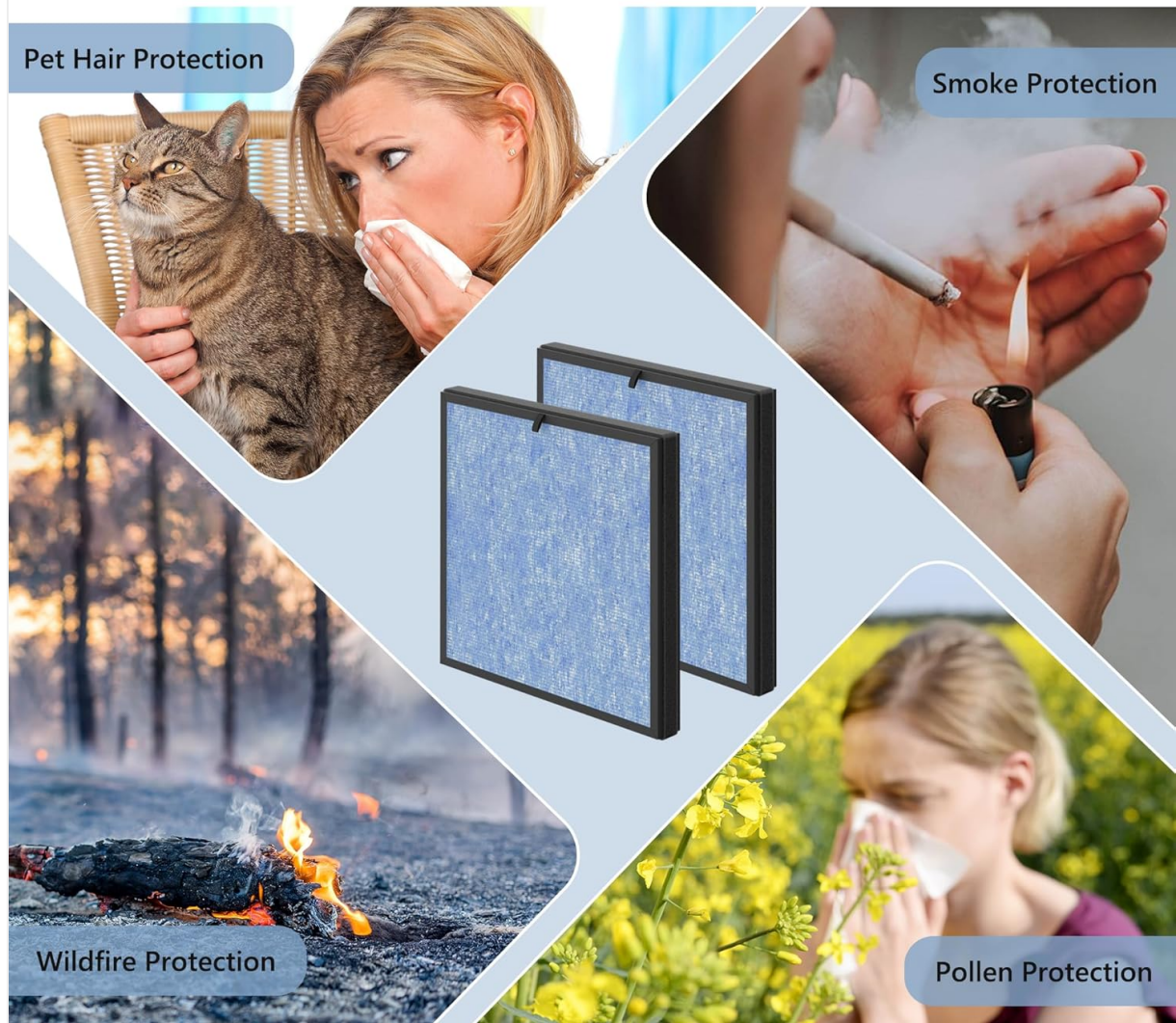
Image: Visual representation of the filter's protective capabilities against common indoor air pollutants, including pet hair, smoke, wildfire particles, and pollen.