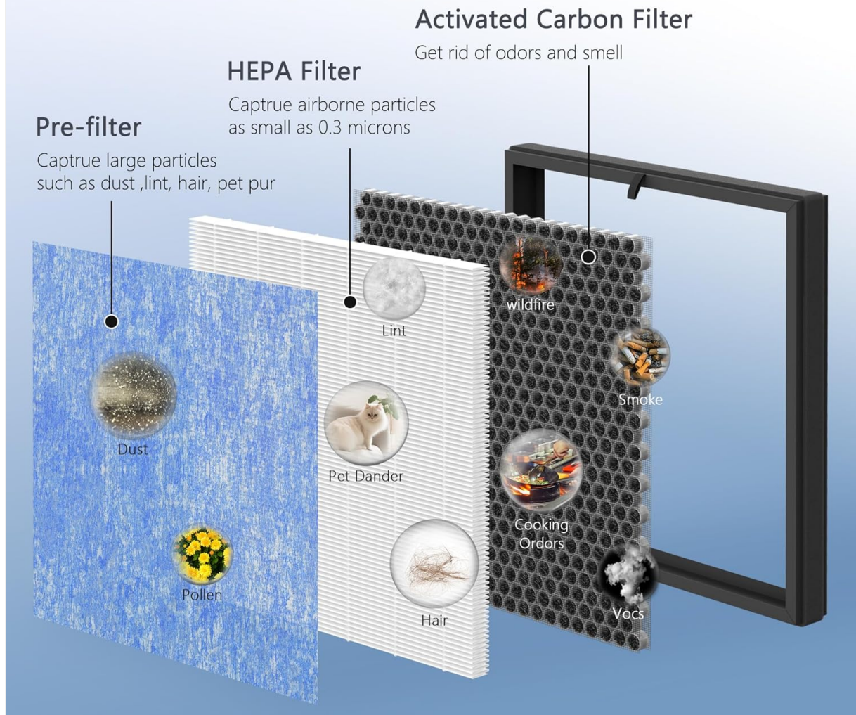
Image: Illustration of the 3-stage filtration process, detailing the function of the pre-filter, HEPA filter, and activated carbon filter in capturing various pollutants like dust, pollen, pet dander, smoke, and VOCs.